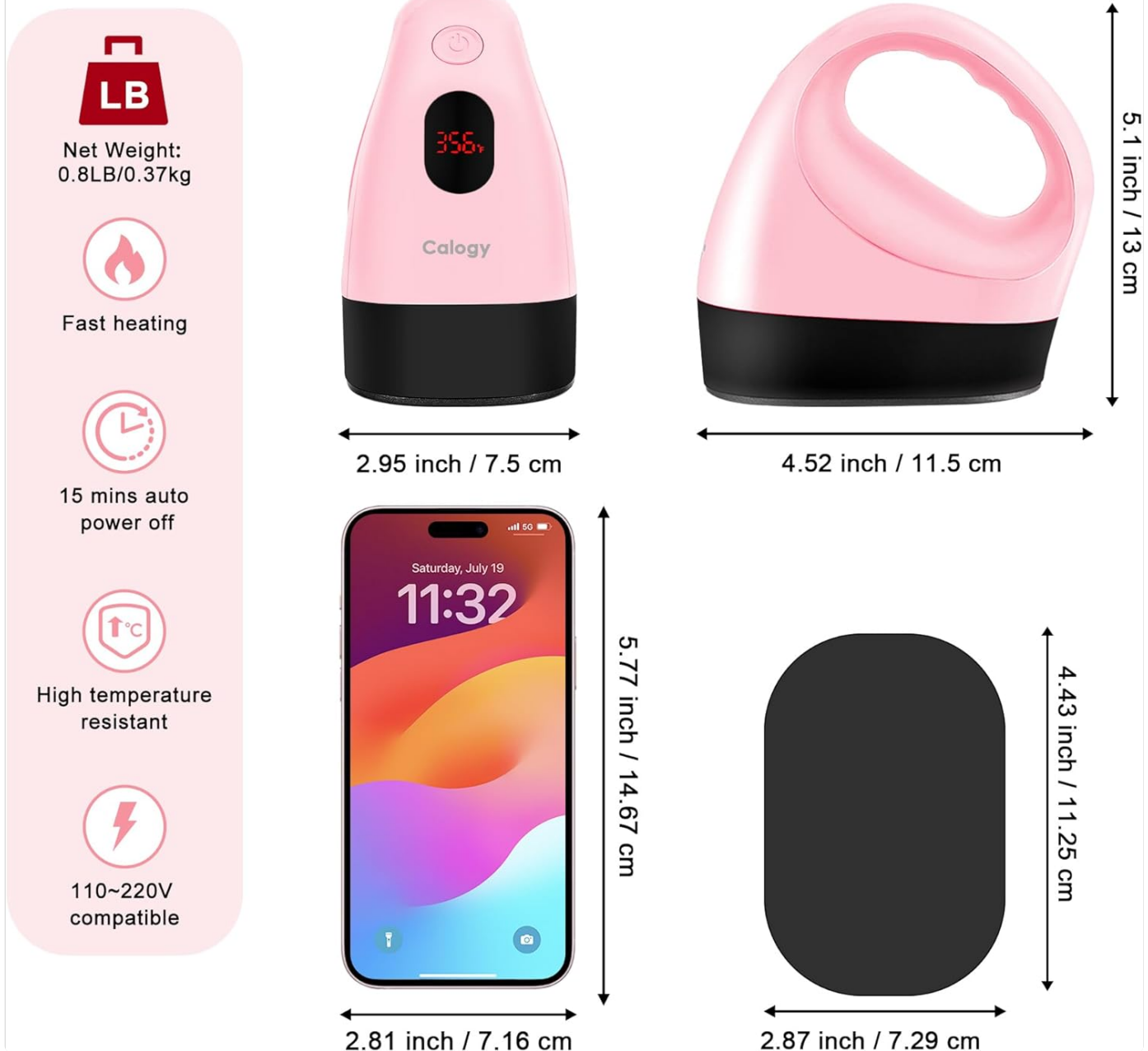
Figure 3: Compact and portable design of the Calogy Mini Heat Press.