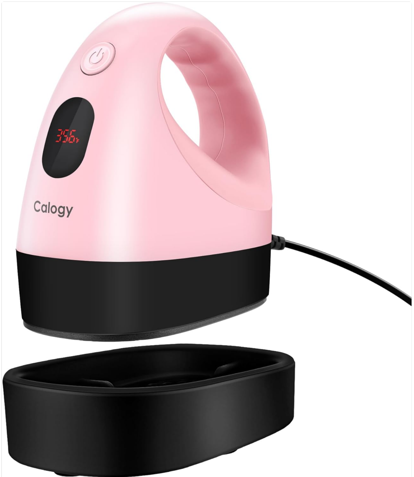
Figure 4: Calogy Mini Heat Press components including the main unit with power button and display, and the separate safety base.