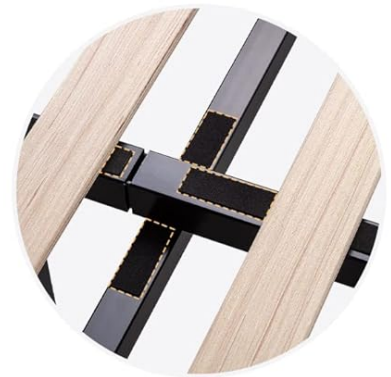
Sturdy metal structure support

This image highlights key construction details of the bed frame. It shows the solid wood slats designed for smart assembly, thick foam padding attached to the metal beams to mute noises, and the robust metal structure providing strong support for the mattress.