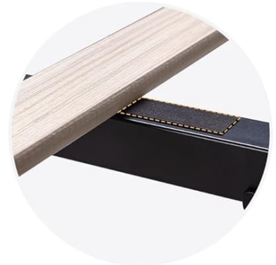
Thick attached foams to mute noises