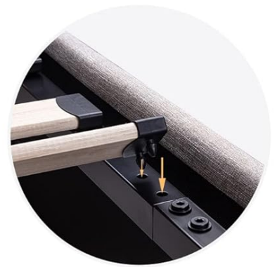
Solid wood slats with smart assembly