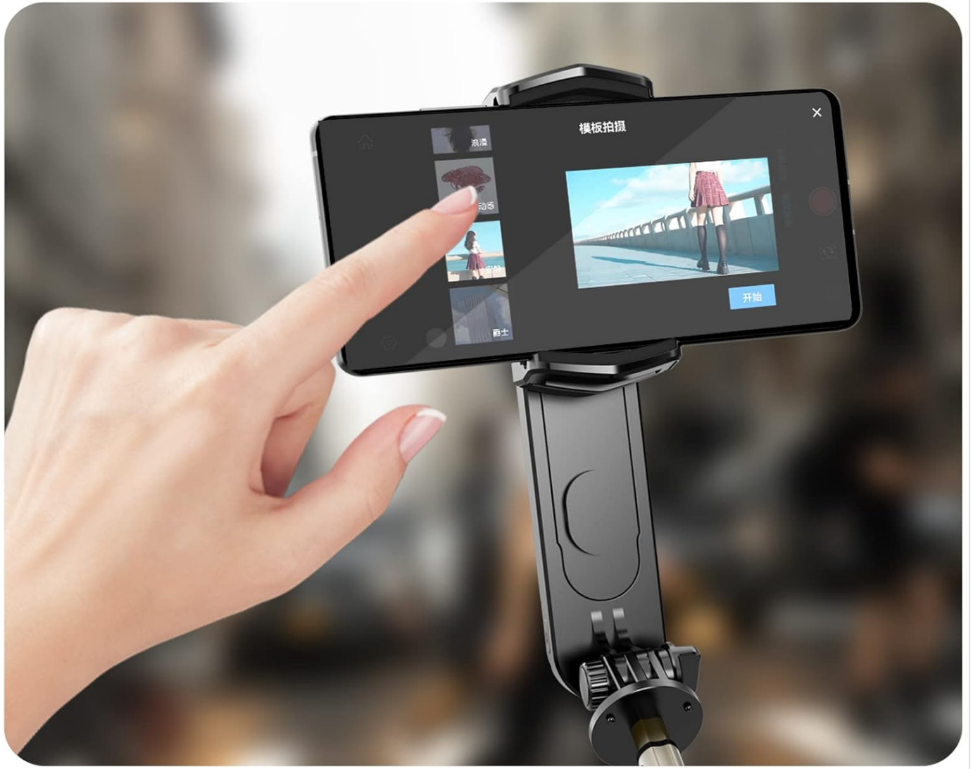
Figure 4: The KOSCHEAL Q09 with a smartphone displaying the app interface, indicating ease of use for video creation.

LA APLICACIÓN TIENE INCORPORADAS RICAS PLANTILLAS QUE SIGUEN LAS INSTRUCCIONES DE OPERACIÓN Y EL FUNCIONAMIENTO ES SENCILLO.