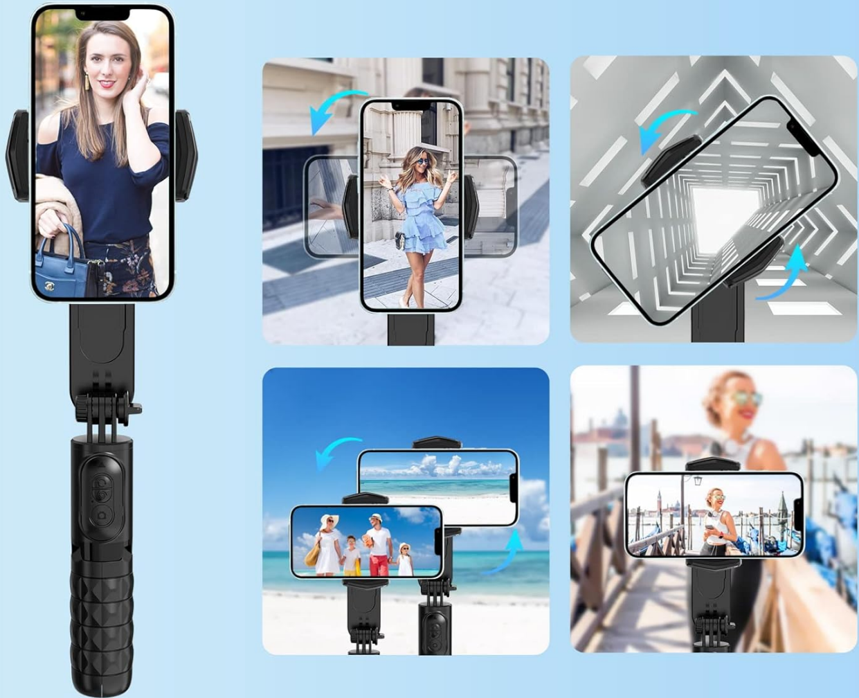
Figure 3: Demonstrating the multi-functional wireless command capabilities of the KOSCHEAL Q09, including various phone orientations.