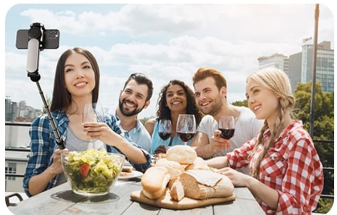
Figure 2: The KOSCHEAL Q09 demonstrating its two primary modes: selfie stick and gimbal stabilizer, highlighting the phone attachment mechanism.