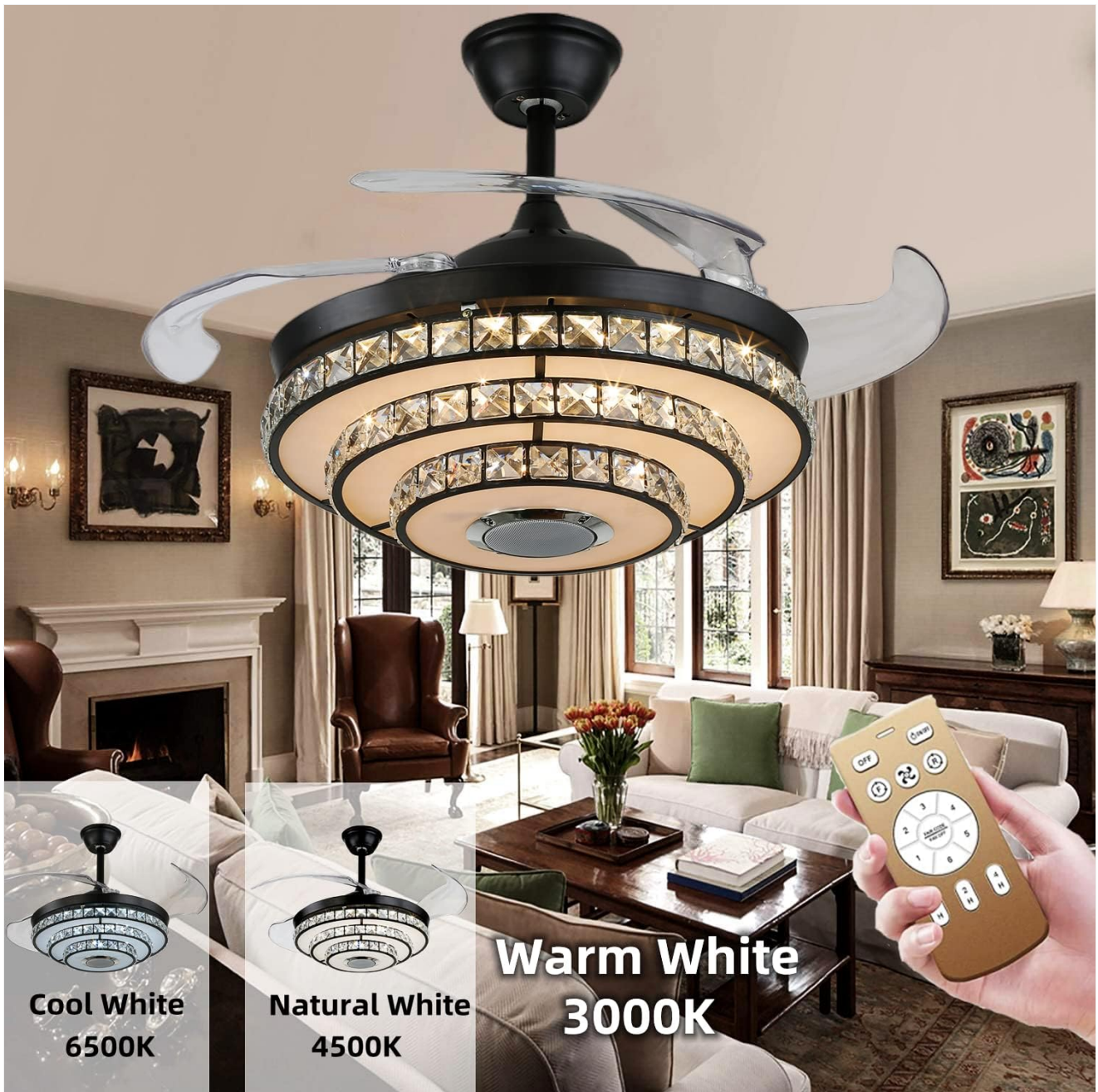
Image 5.1: Remote control functions for light color, fan speed, and rotation direction.