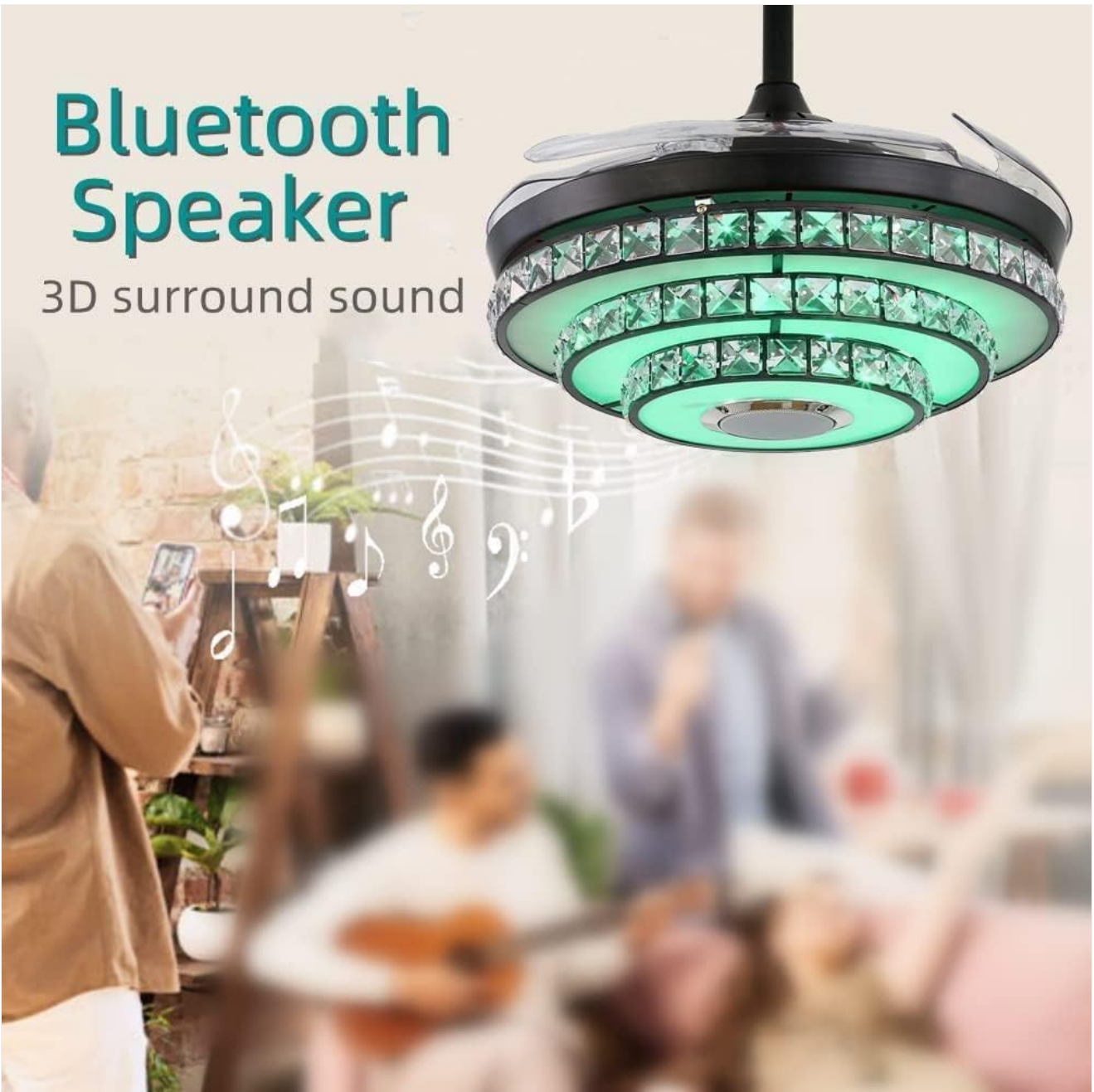
Image 5.2: The integrated Bluetooth speaker provides 3D surround sound for music playback.