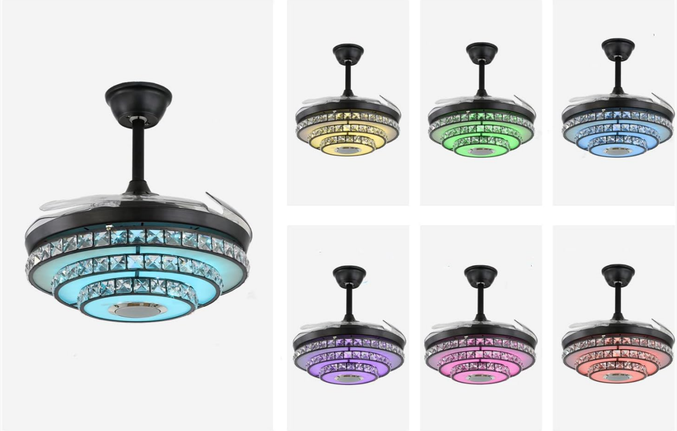
Image 5.4: The LED RGB light offers a wide range of color change options.