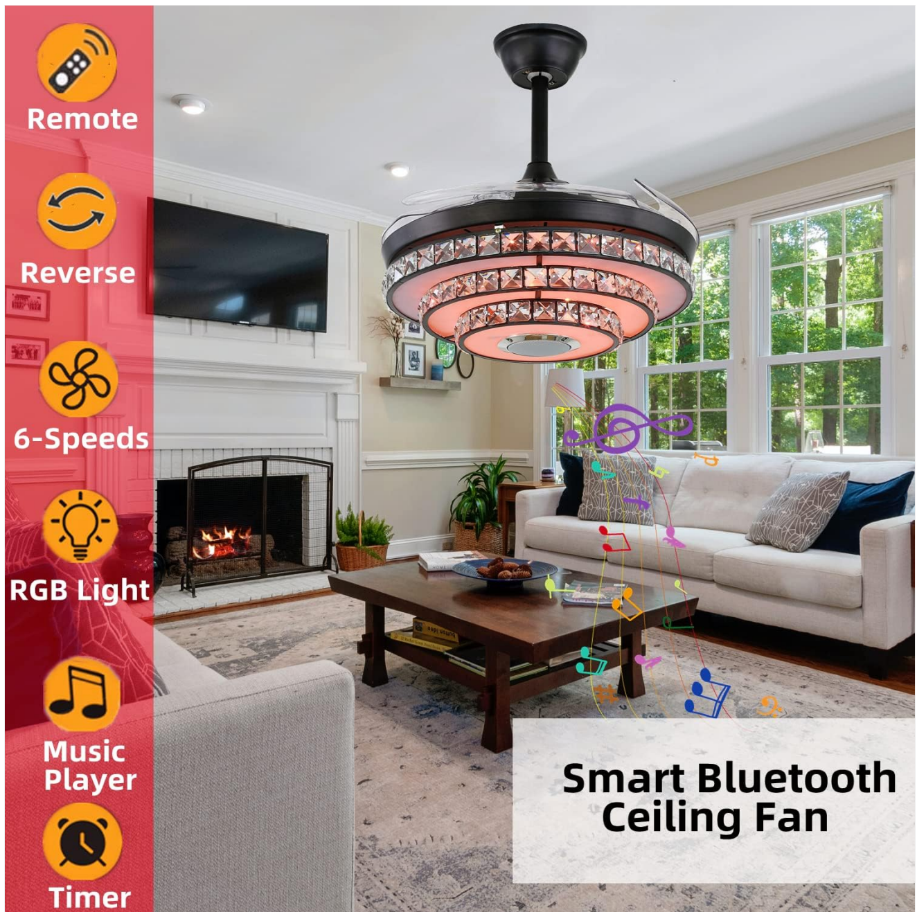
Image 1.1: Overview of the FANEPRO Smart Bluetooth Ceiling Fan highlighting its key features.