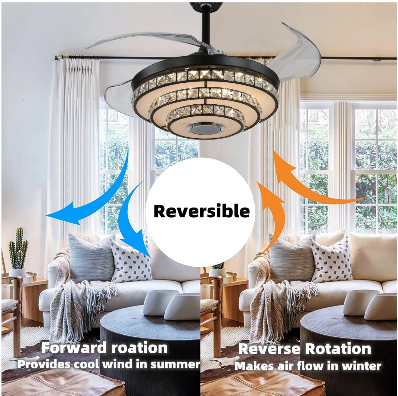
Image 5.5: Illustration of forward rotation for cool wind in summer and reverse rotation for air circulation in winter.