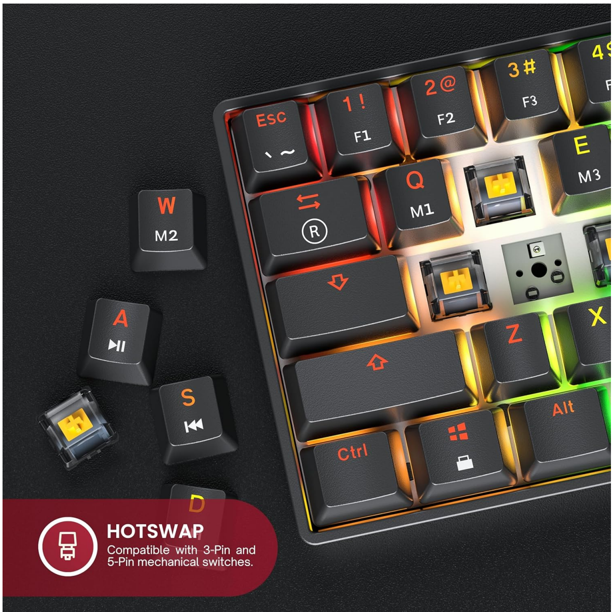
Image: Detail of the hot-swappable switch mechanism on the GK61 keyboard.