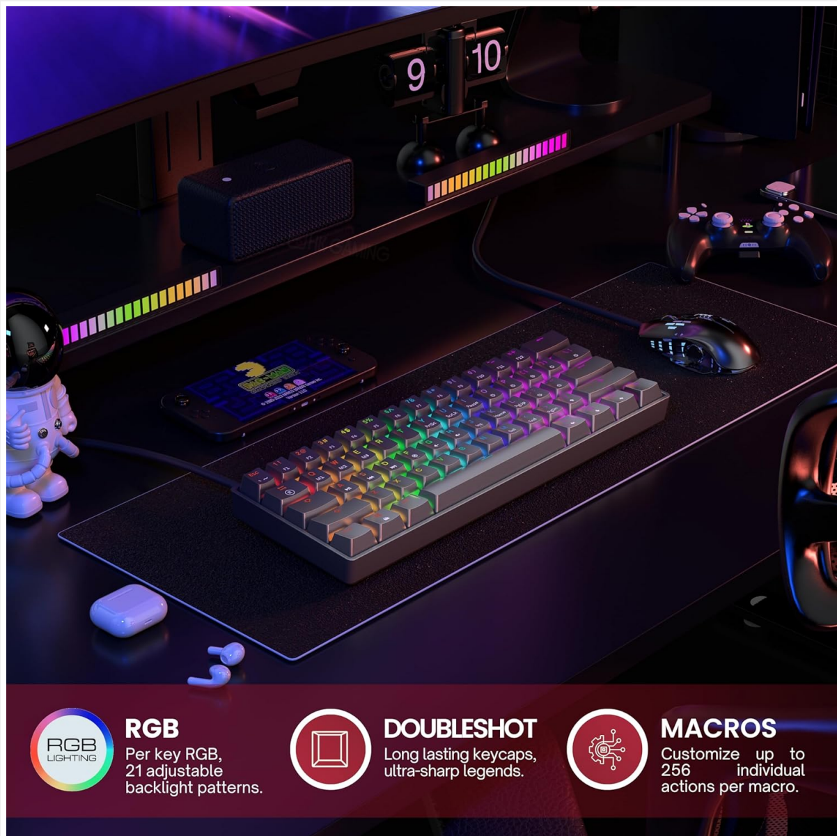
Image: Keyboard showcasing RGB lighting, durable keycaps, and macro capabilities.