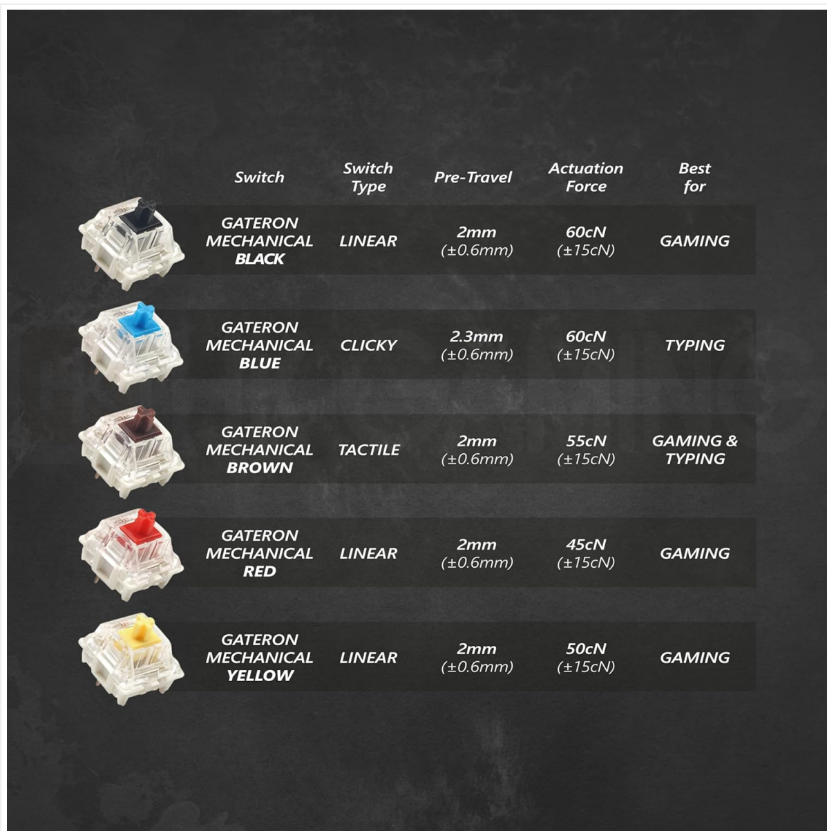
Image: Gateron switch specifications, including actuation force and travel distance.