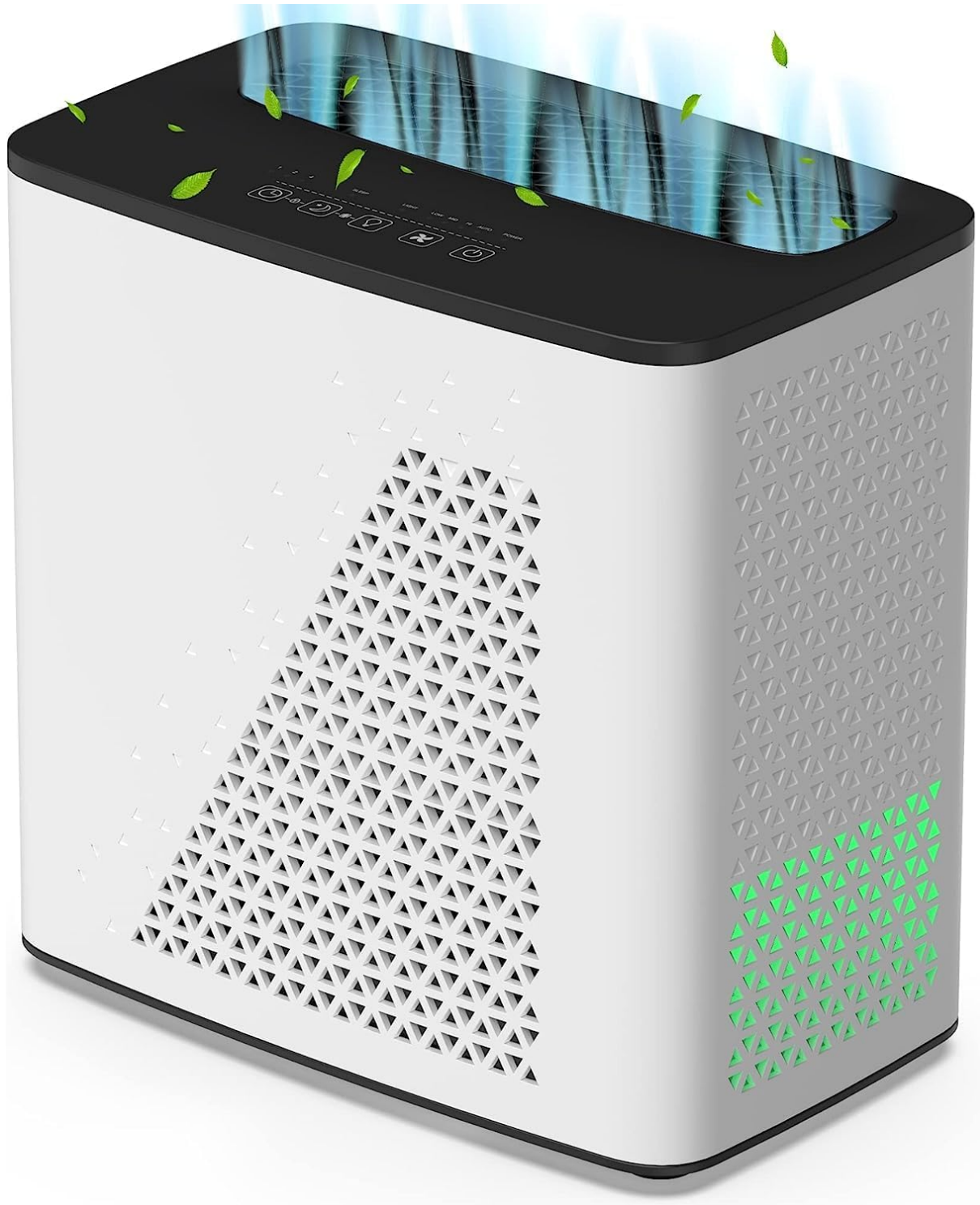
Figure 1: YIOU Air Purifier P1802