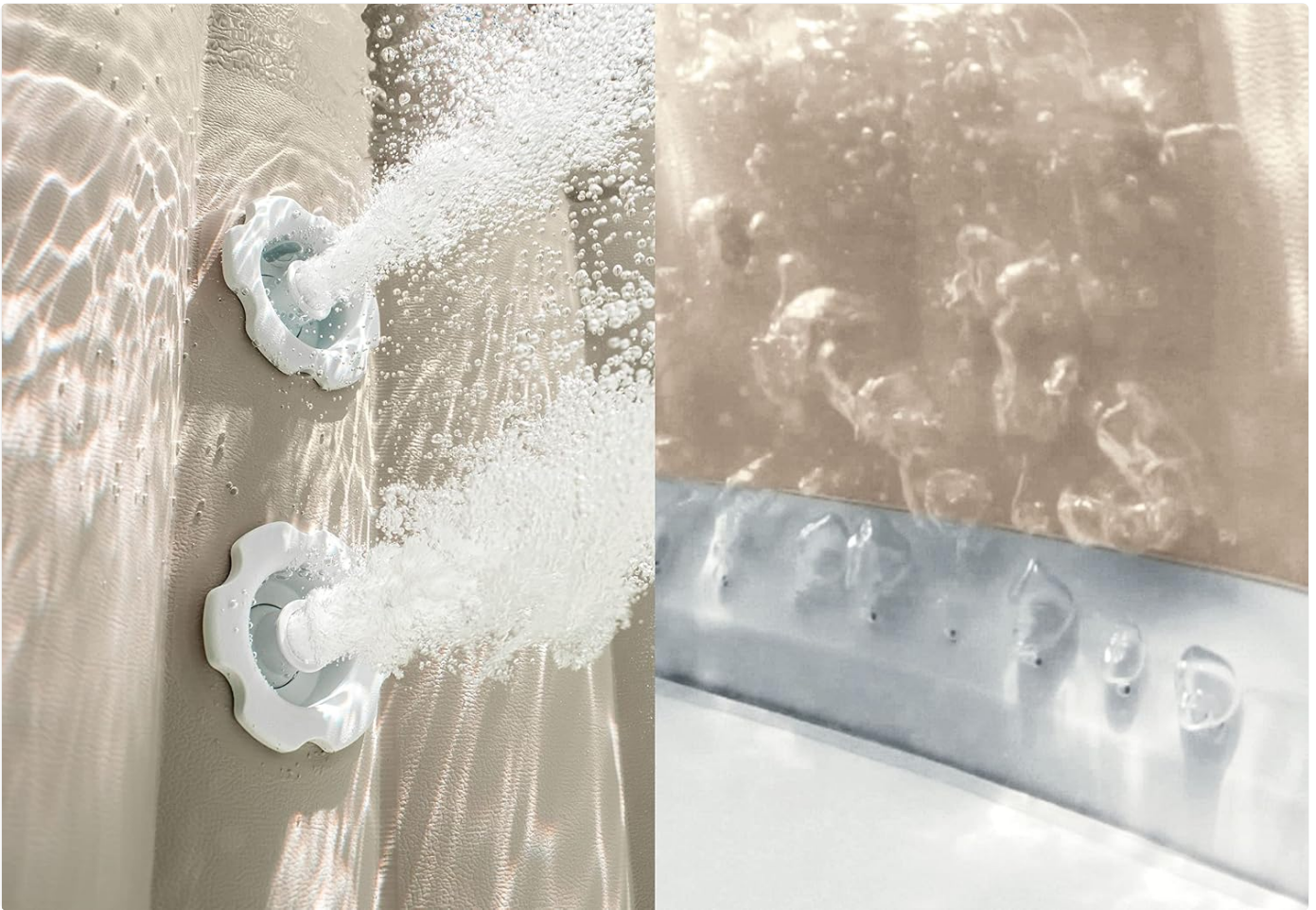
Image 5.2: The spa features both invigorating air bubble jets and powerful hydro jets.