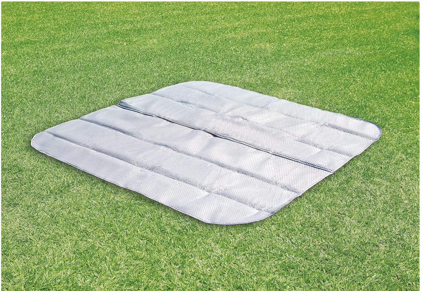
Image 4.1: The protective ground cloth should be placed on a level surface before setting up the spa.

Unfold the ground cloth and place it on your chosen site. This provides an additional layer of protection for the spa's base.