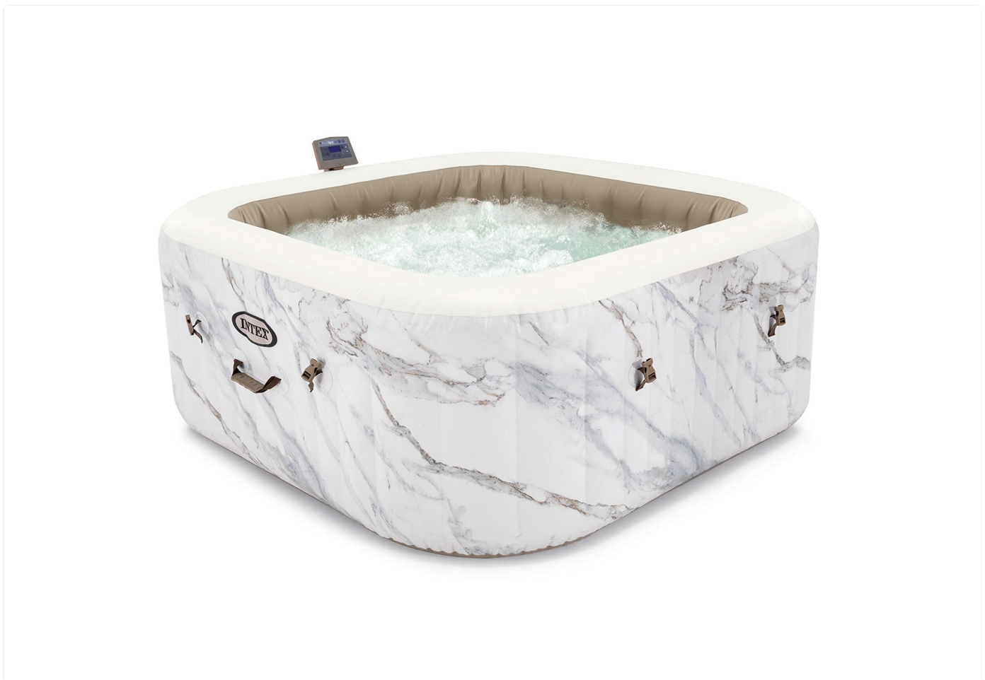
Image 1.1: The Intex PureSpa Calacatta Square Hot Tub, Model 28464EX, shown in an outdoor setting.