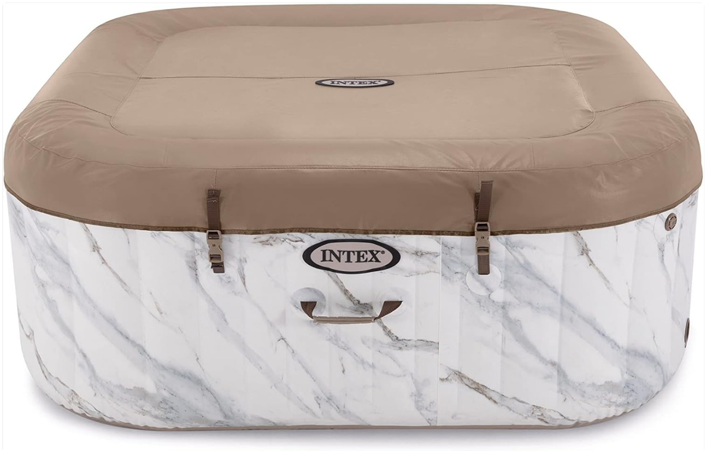
Image 6.1: The insulated cover helps maintain water temperature and keeps the spa clean.