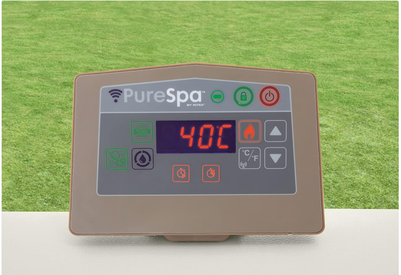
Image 5.1: The wireless control panel allows for easy adjustment of spa functions.

The PureSpa features a wireless, rechargeable control panel for easy operation. Familiarize yourself with the buttons and display.