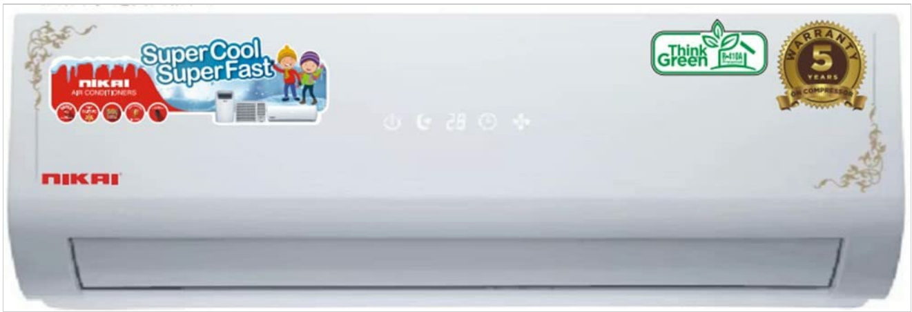
Figure 2.1: Nikai NSAC12136HC24 Indoor Unit. This image shows the white indoor unit of the split air conditioner, typically mounted on a wall, with its air outlet and control panel visible.

The system consists of an indoor unit, an outdoor unit, and a remote control.