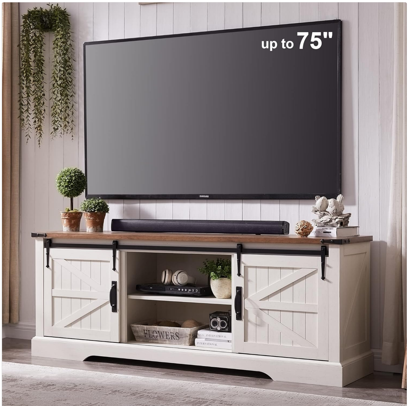
Image: The OKD Farmhouse TV Stand in Antique White, featuring a large television on its top surface and decorative items on its shelves. The sliding barn doors are partially open, revealing interior storage.