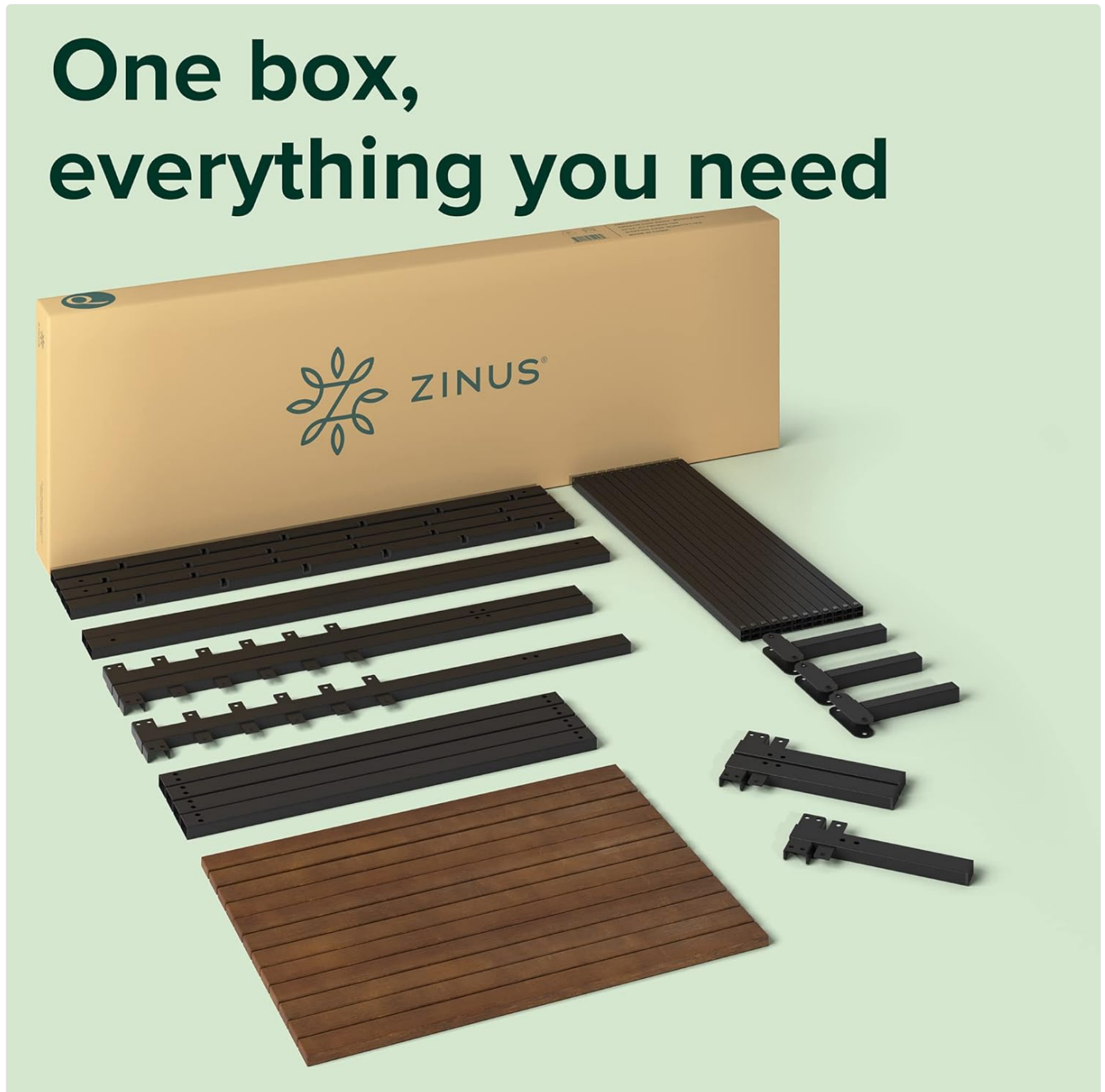
Figure 1: All components included in the single shipping box.

Verify that all parts listed below are present before beginning assembly. If any parts are missing or damaged, please contact ZINUS customer support.