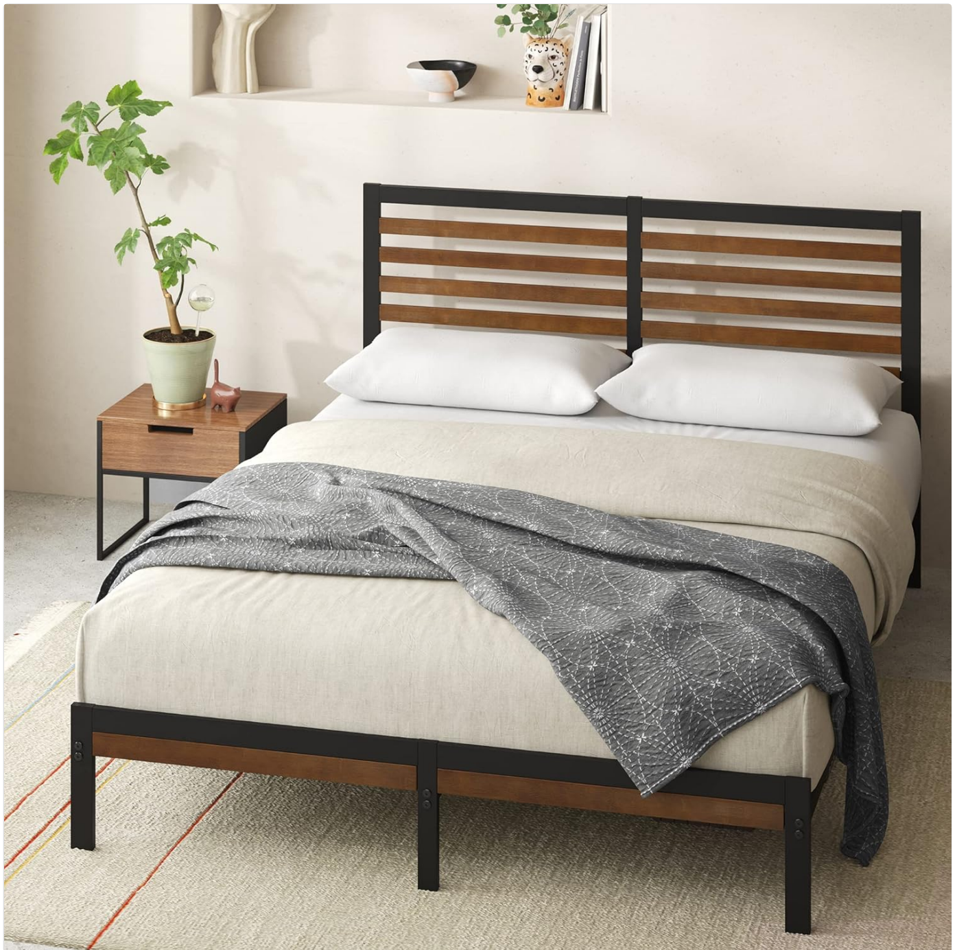
Figure 5: The ZINUS Kai bed frame in use, providing a stable foundation for a mattress.