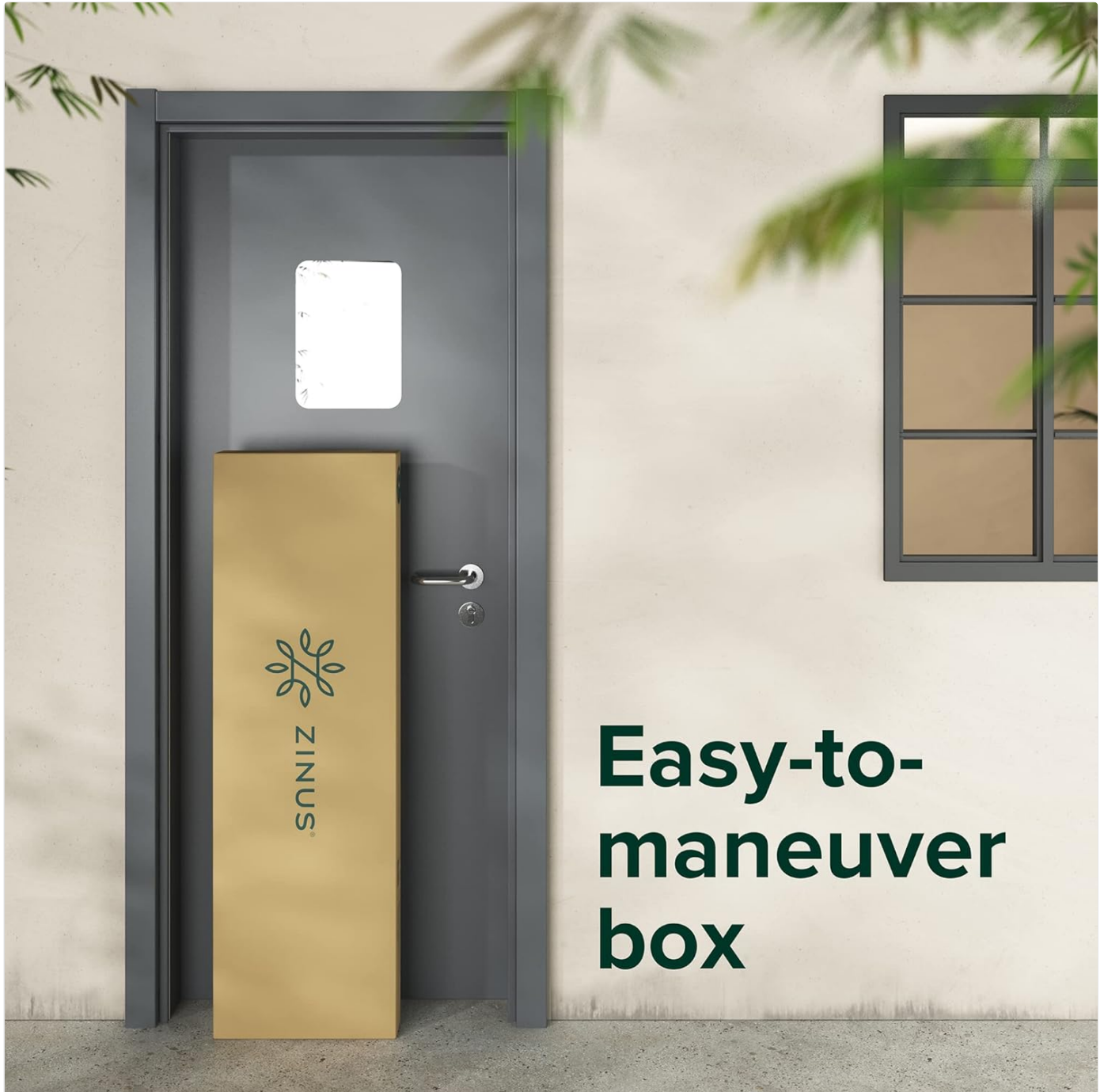
Figure 2: The bed frame ships in a single, easy-to-maneuver box.