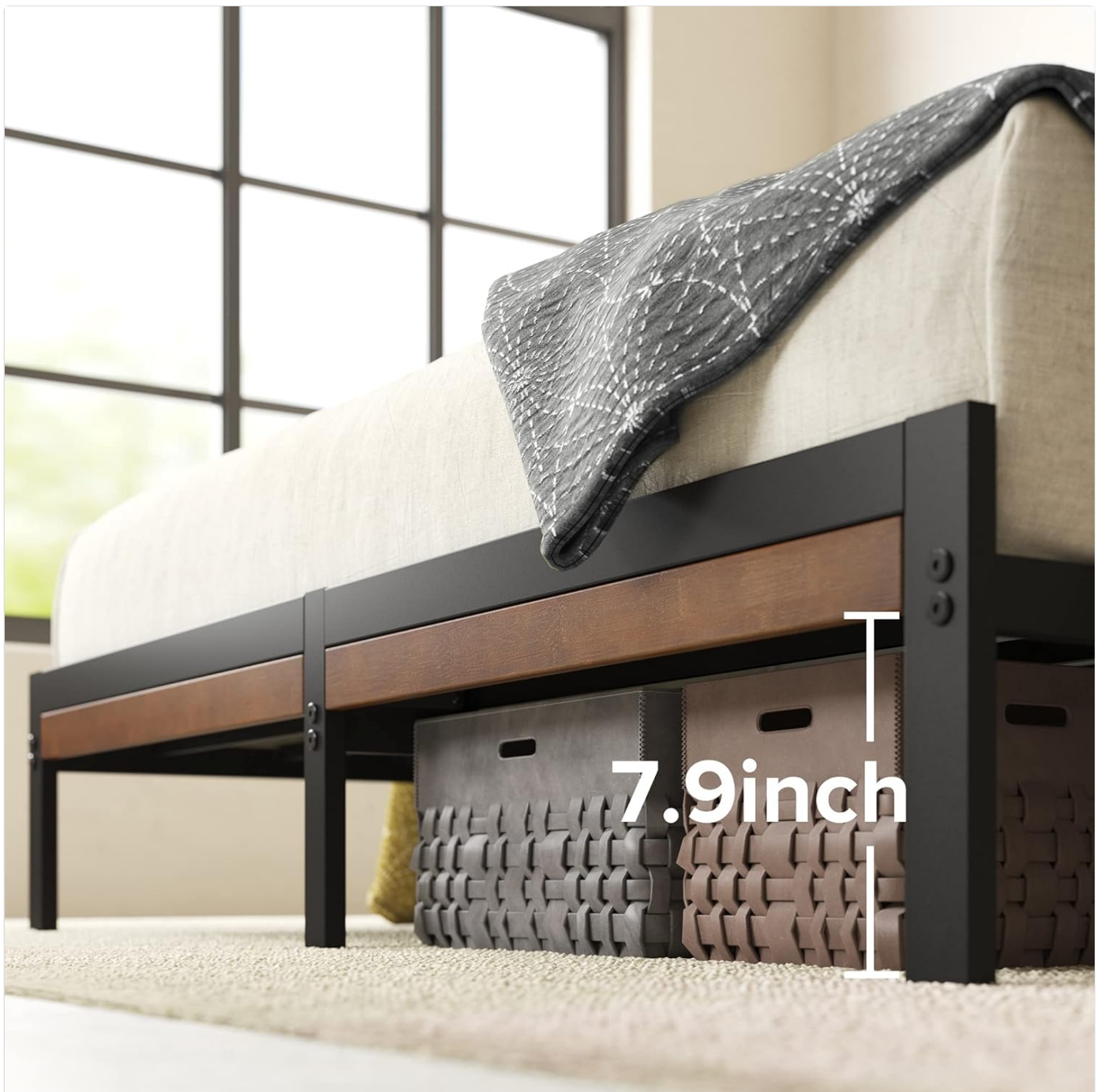
Figure 7: Detailed view of the 7.9-inch under-bed clearance.