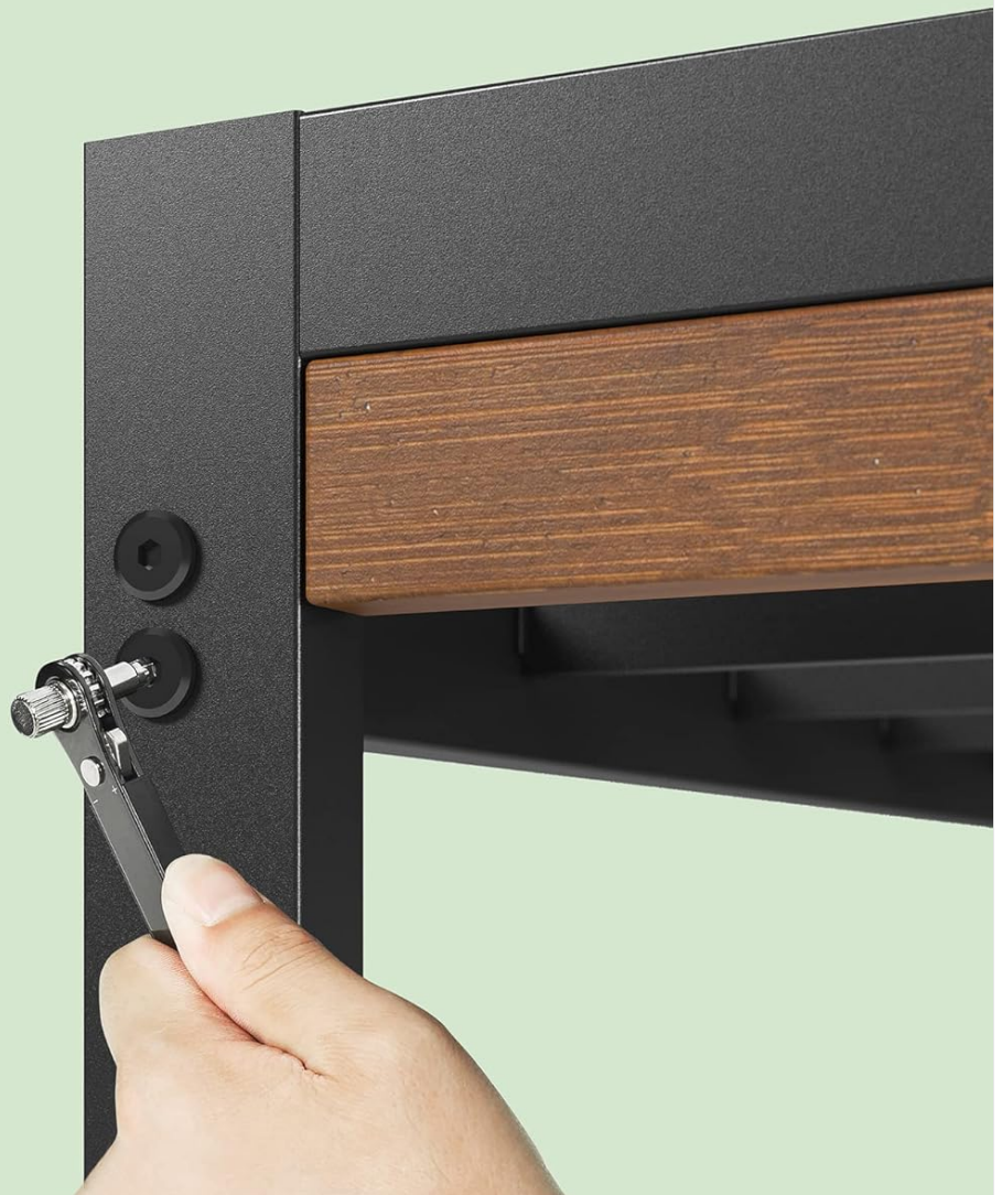
Figure 3: Assembly is made easy with included tools and a numbering system for parts.