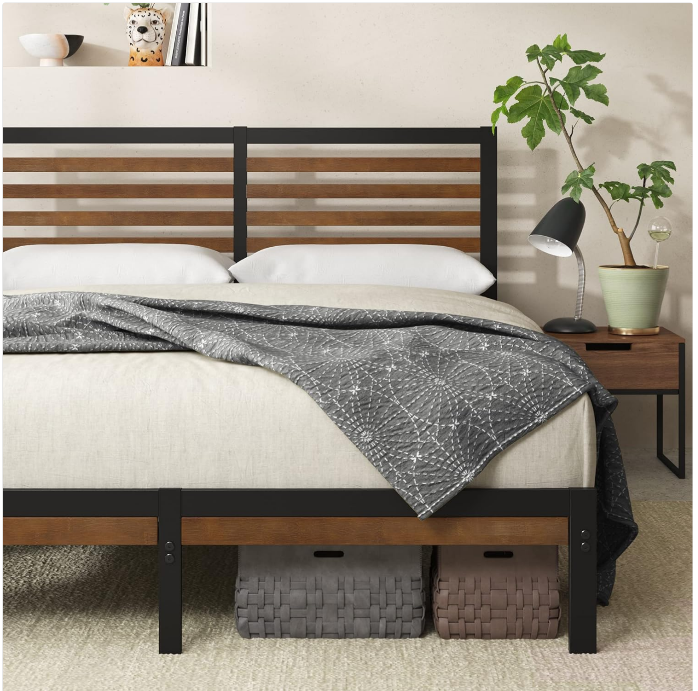
Figure 6: Example of under-bed storage with the ZINUS Kai bed frame.