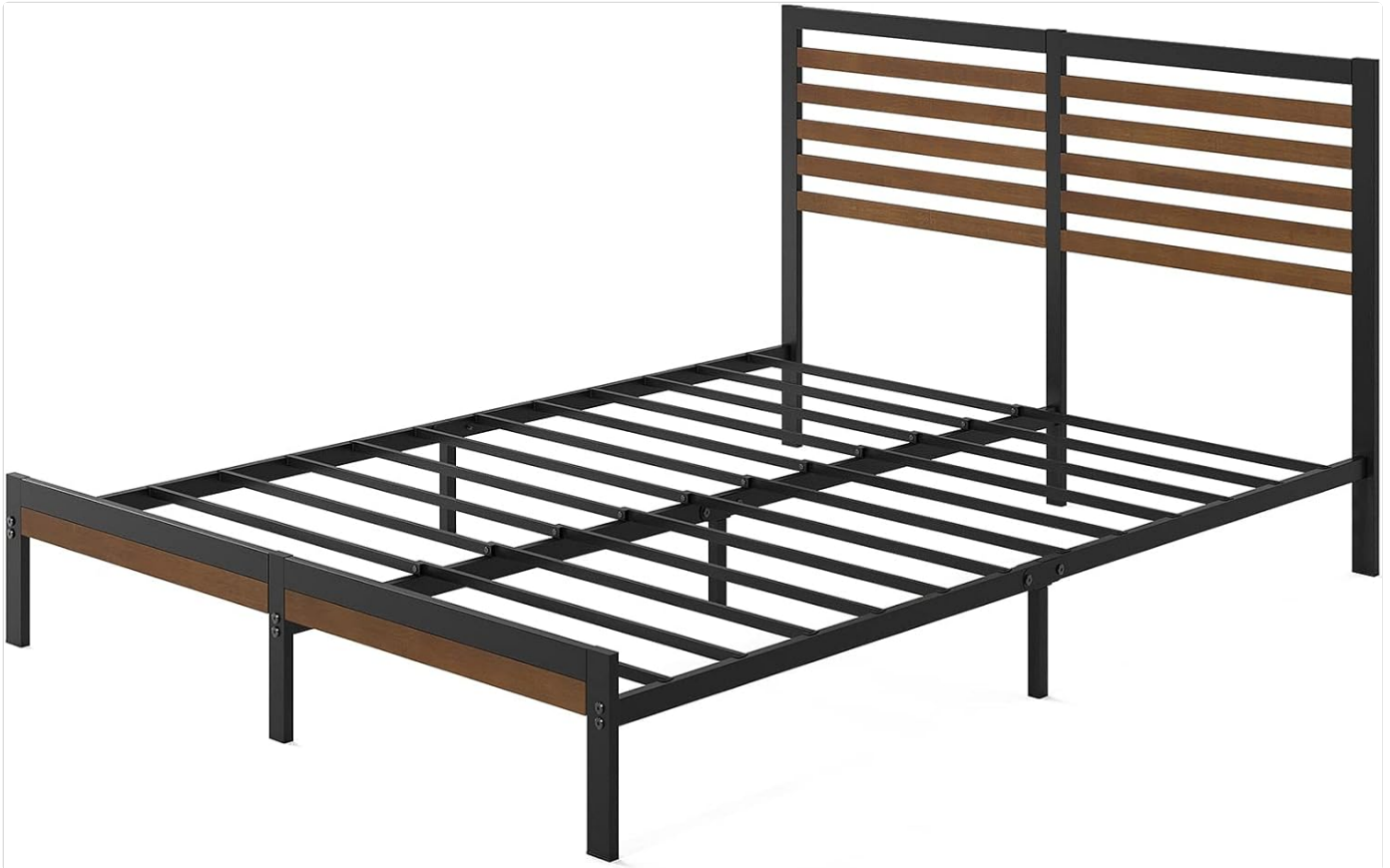
Figure 4: The assembled ZINUS Kai bed frame, ready for a mattress.

For detailed visual instructions, refer to the official ZINUS installation manual (PDF) available here .