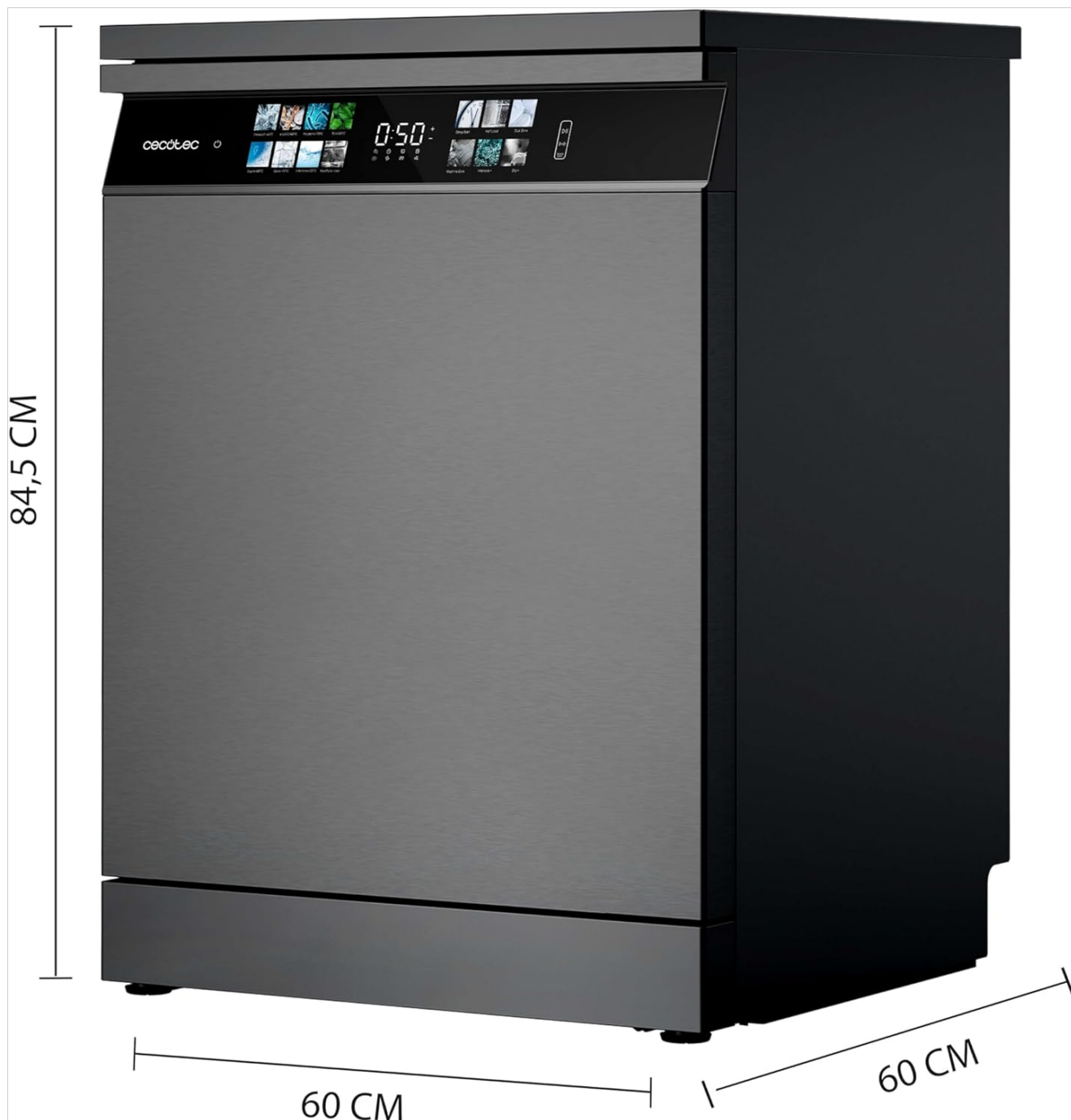
Front view of the dishwasher, showing its dimensions of 60 cm width, 60 cm depth, and 84.5 cm height.