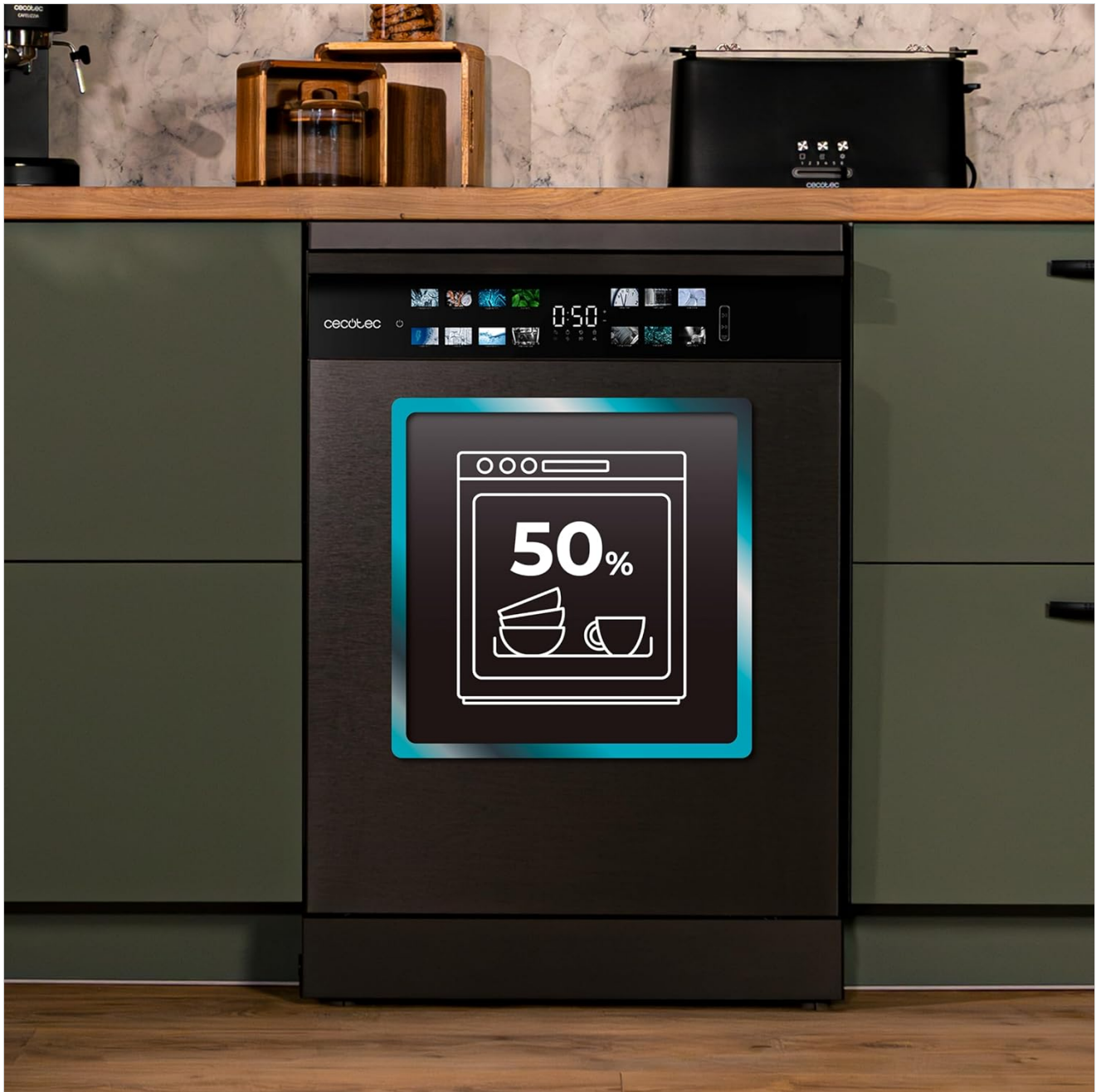
The Half Load function optimizes resource consumption for smaller dish loads.