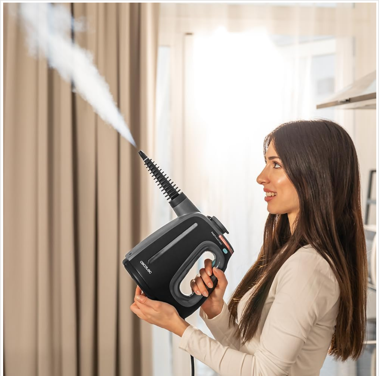
Image: A woman using the handheld Cecotec Hydrosteam 1300 Rapid Max with a narrow nozzle attachment, directing steam for detailed cleaning.