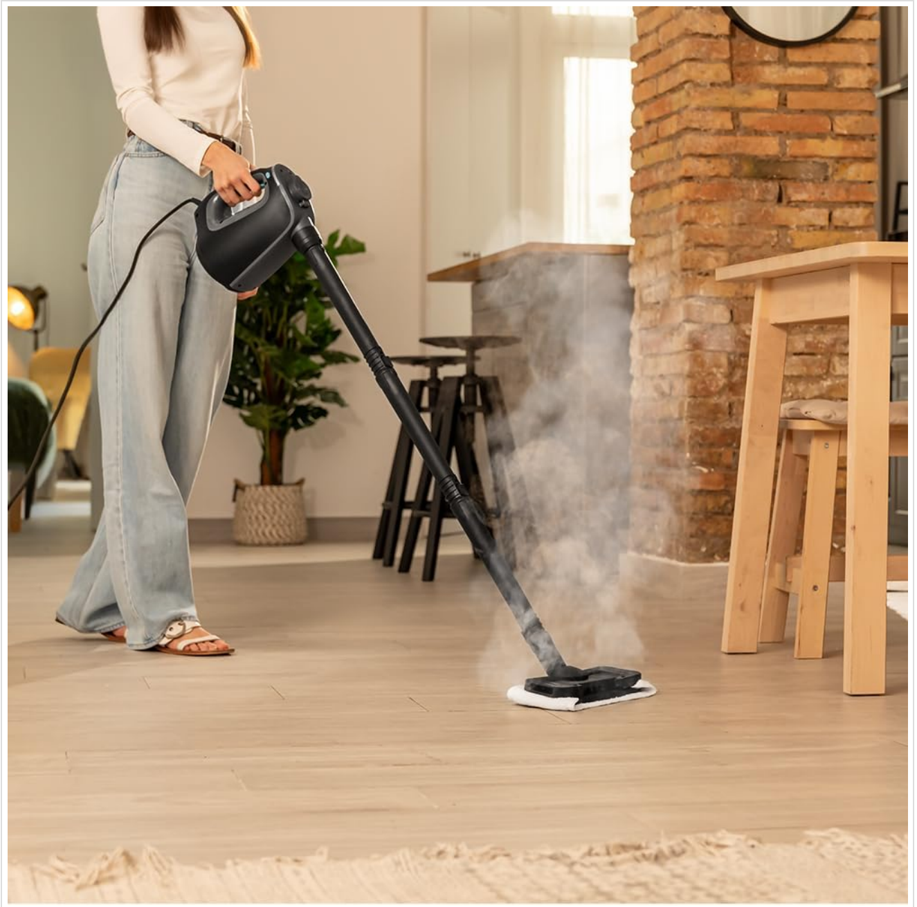
Image: A woman using the Cecotec Hydrosteam 1300 Rapid Max in mop configuration to clean a light-colored floor in a living area.

4. Window Cleaning: Use the window cleaning nozzle for streak-free windows and mirrors.