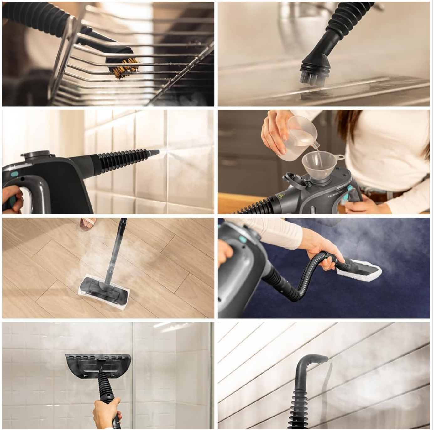
Image: A collage showing various accessories of the Cecotec Hydrosteam 1300 Rapid Max steam cleaner being used for different cleaning tasks, including cleaning a grill, sink, tiles, floor, upholstery, shower, and wall.