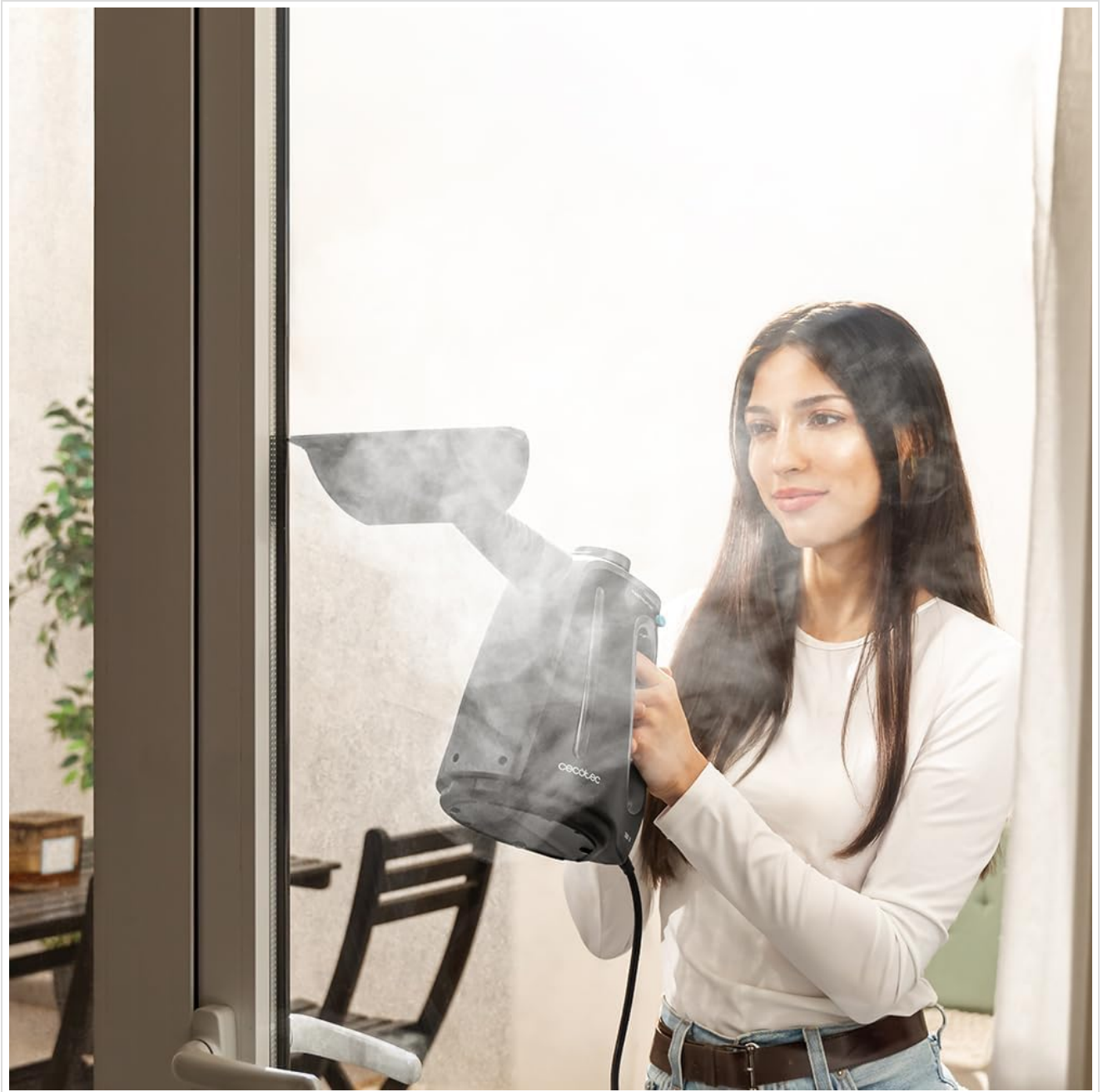
Image: A woman cleaning a window with the handheld Cecotec Hydrosteam 1300 Rapid Max, using the window cleaning attachment, with steam visible.