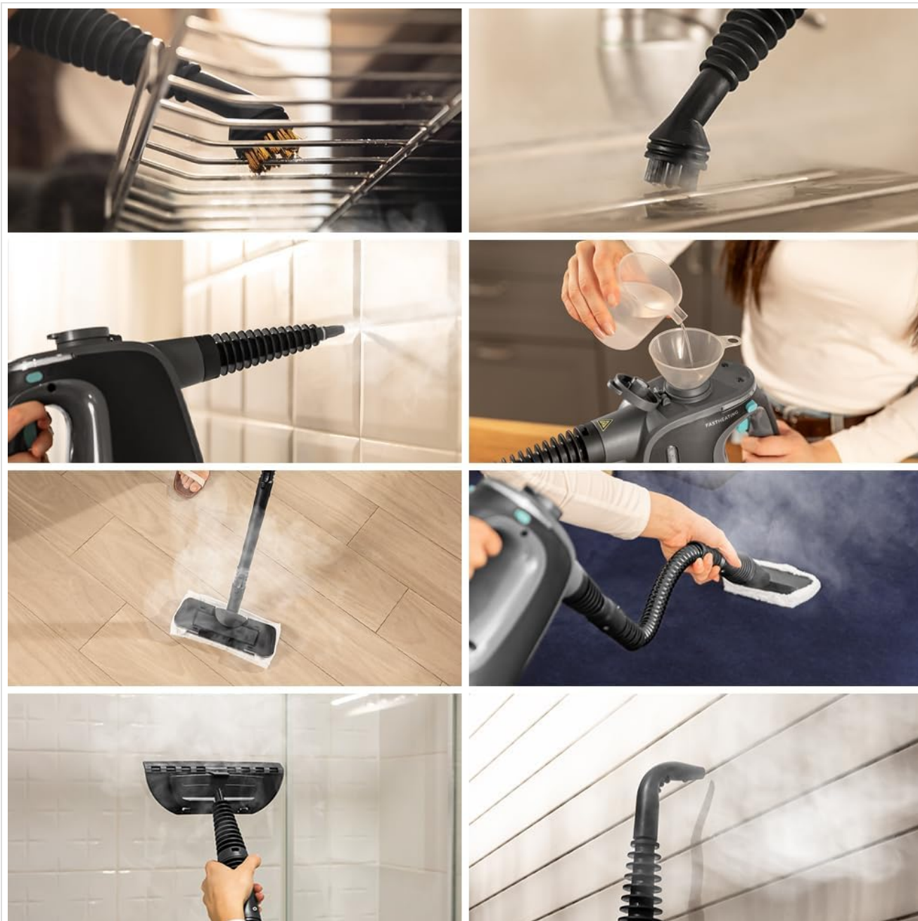
Image: A close-up shot from a collage showing a hand pouring water into the steam cleaner's tank using a measuring cup and funnel.