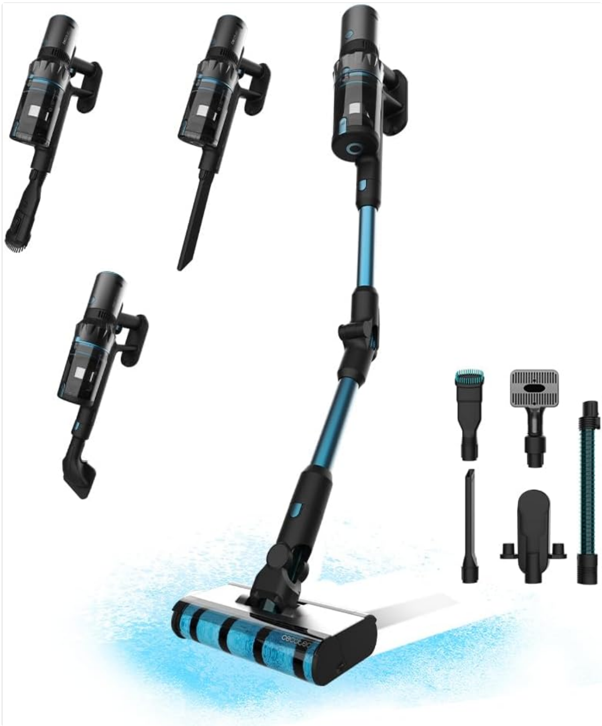
Figure 2.1: The Cecotec Conga Rockstar 5500 Hurricane ErgoTwice Animal cordless vacuum cleaner shown with its main unit, flexible tube, floor brush head, and various cleaning accessories including a 2-in-1 tool, corner tool, and pet accessory.