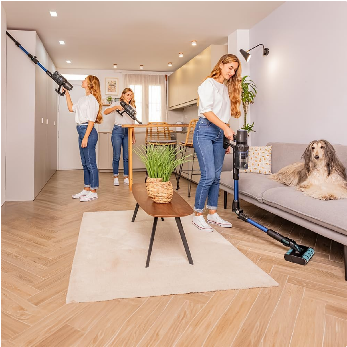
Figure 5.3: The specialized pet accessory can be used to effectively remove loose hair from pets, contributing to a cleaner home environment.