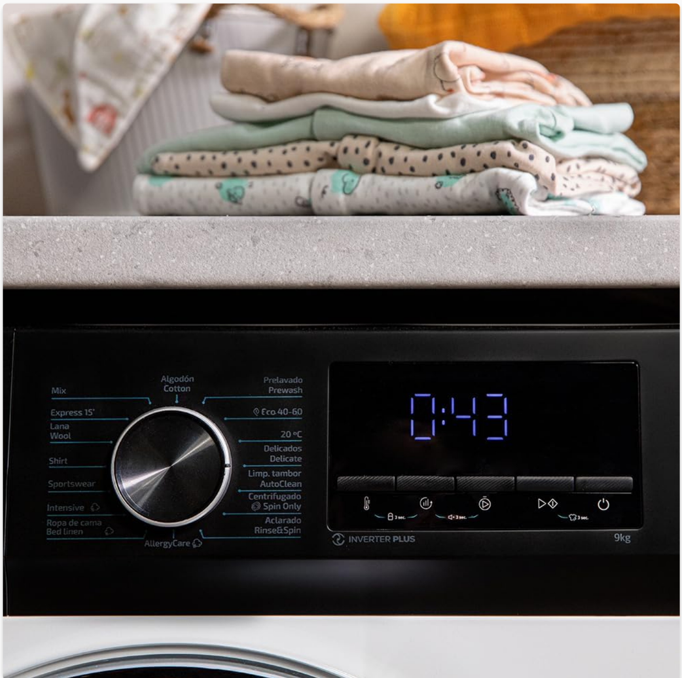
Image 3.1: Close-up view of the control panel, showing the program selection knob and digital display.