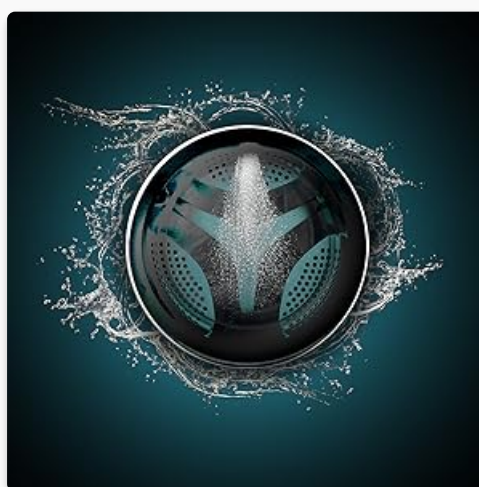
Image 5.4: Graphic depicting the Drum Clean cycle, showing water spraying inside the drum for thorough cleaning.