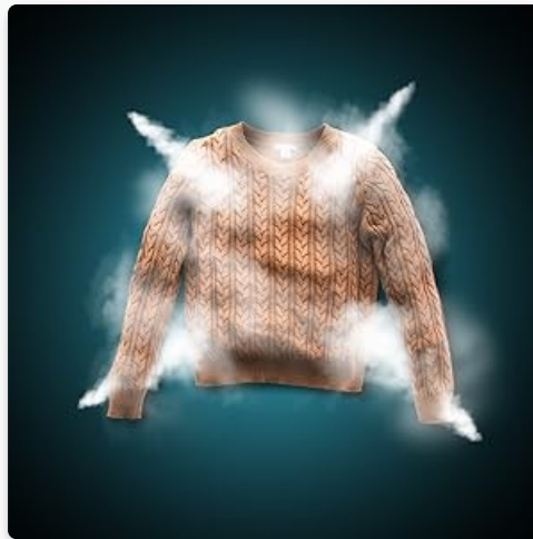
Image 5.2: Visual representation of the SteamMax function, showing steam treating a garment.