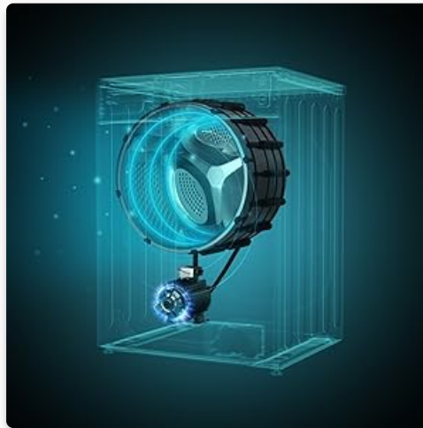
Image 8.2: Diagram illustrating the Inverter Plus motor and its connection to the washing machine drum, highlighting its efficient operation.