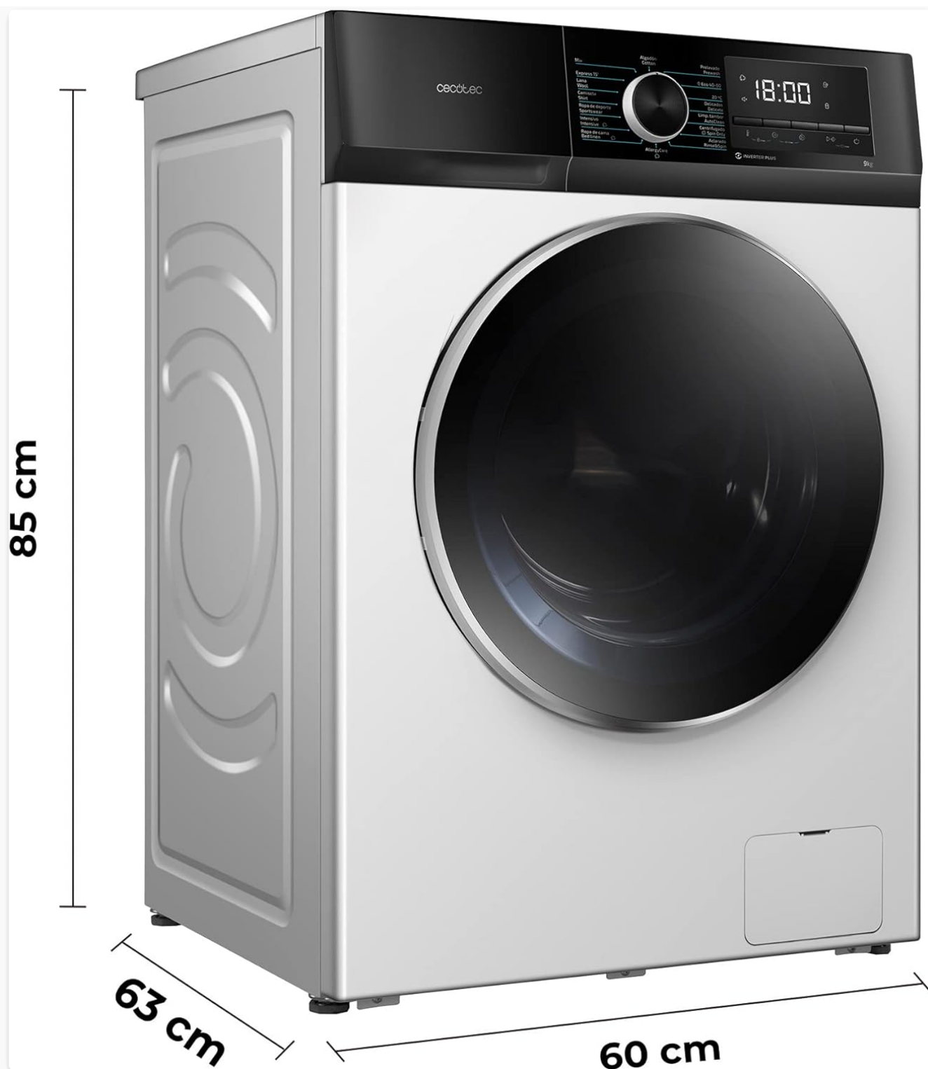
Image 3.2: Side view of the washing machine illustrating its dimensions: 85 cm height, 63 cm depth, and 60 cm width.