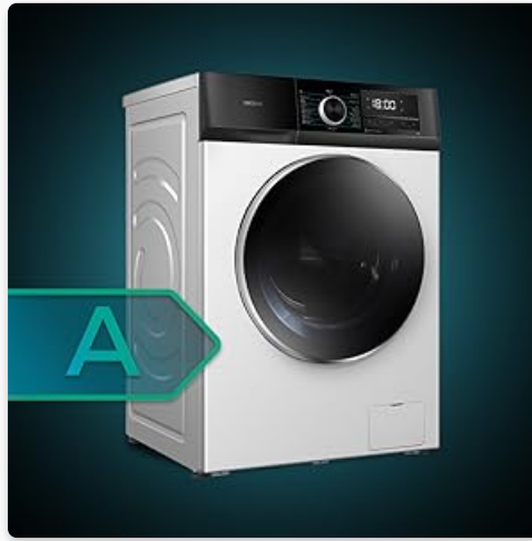
Image 8.1: The washing machine proudly displaying its Class A energy efficiency rating.