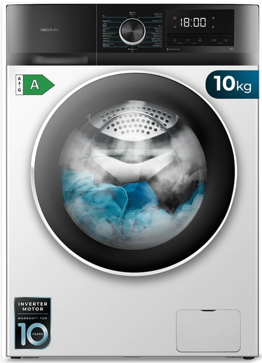
Image 1.1: Front view of the Cecotec Bolero Dresscode 10500 Inverter A washing machine, showing the drum, control panel, and 10kg capacity label.