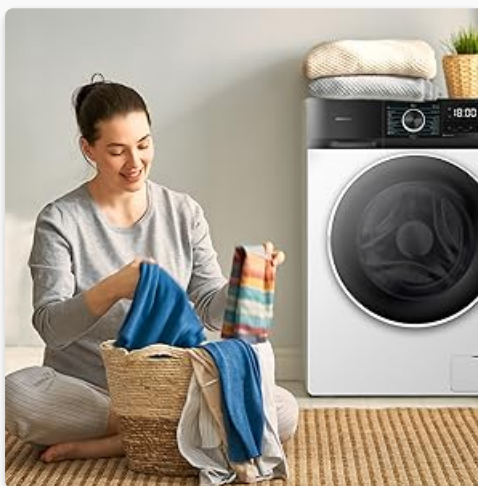
Image 5.1: Demonstrating the process of loading laundry into the washing machine.