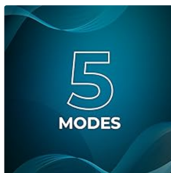
Five versatile operating modes.