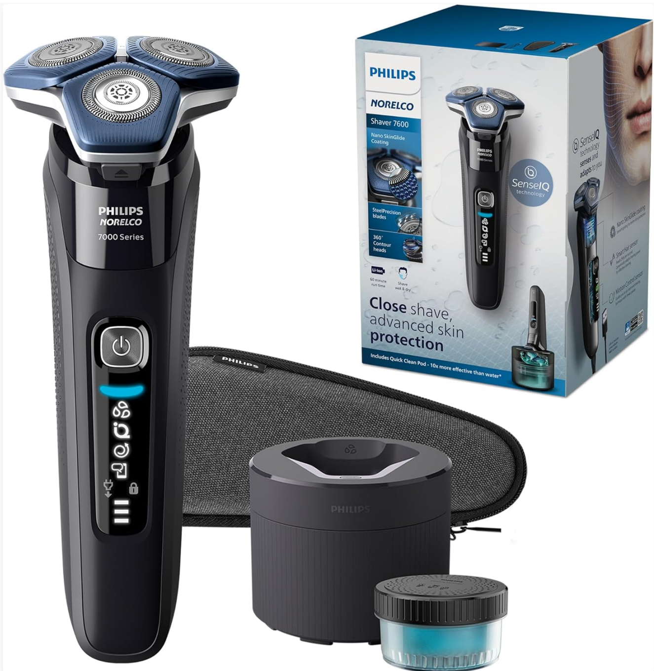
Image 1: Philips Norelco Shaver 7600, Quick Clean Pod, and travel case.