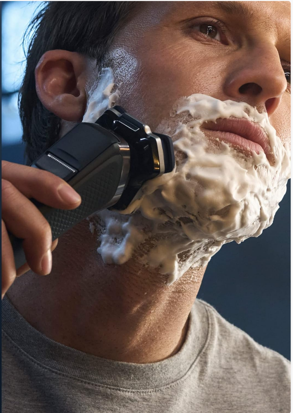
Image 4: The shaver can be used for a refreshing wet shave with foam or gel.