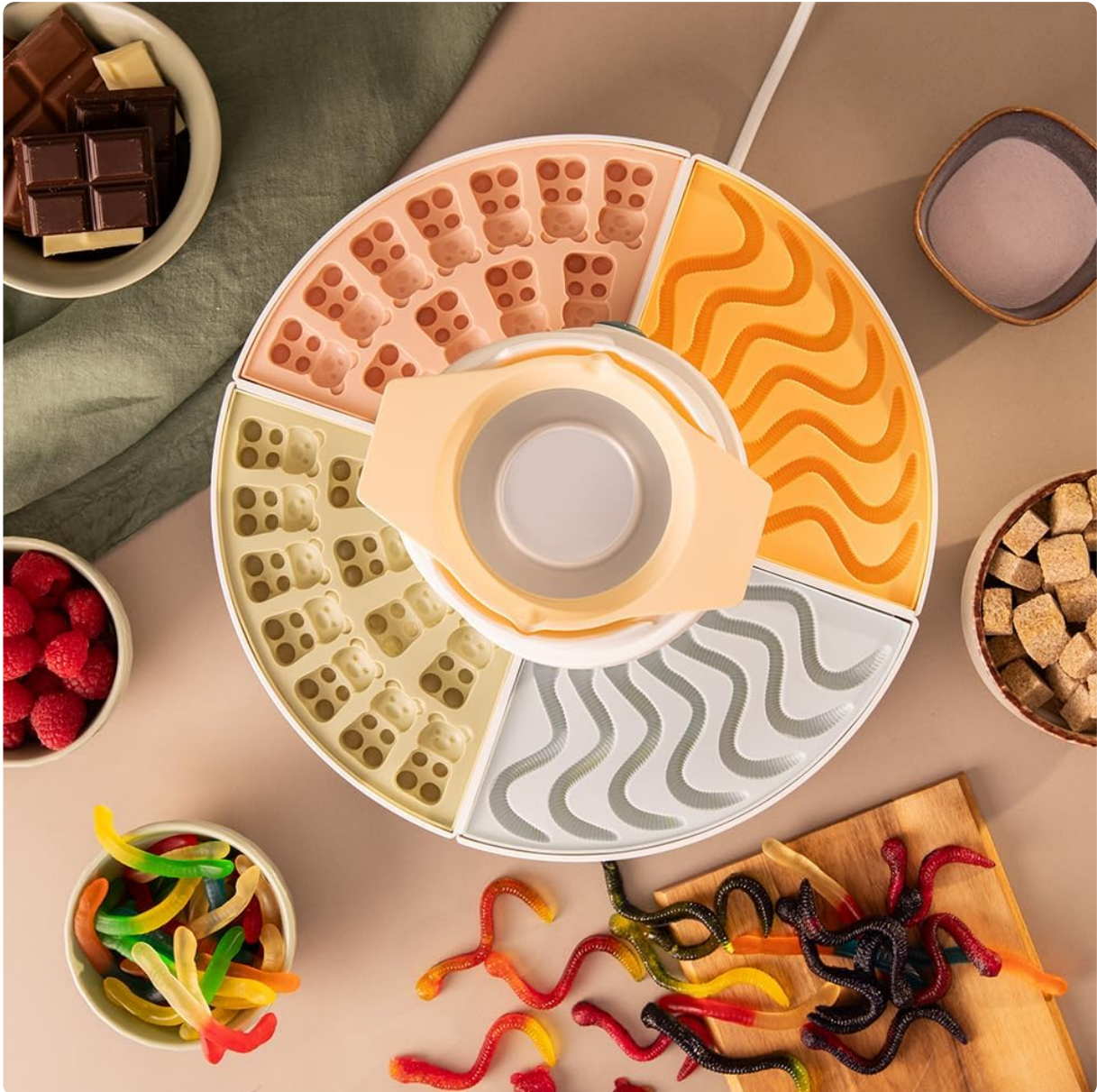
Image 3.1: Top-down view showing the main unit, melting pot, silicone molds, and serving trays.