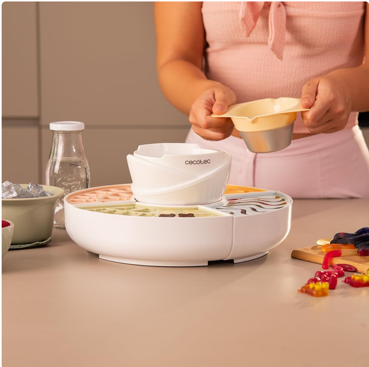
Image 4.1: The removable melting pot being lifted from the main unit.