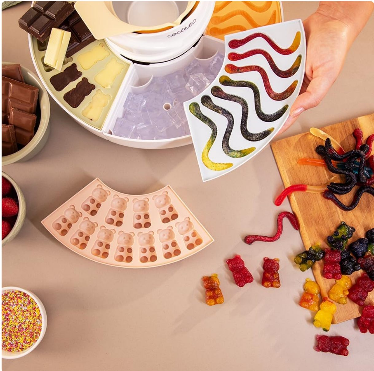
Image 5.1: Various finished gummy candies alongside the silicone molds.