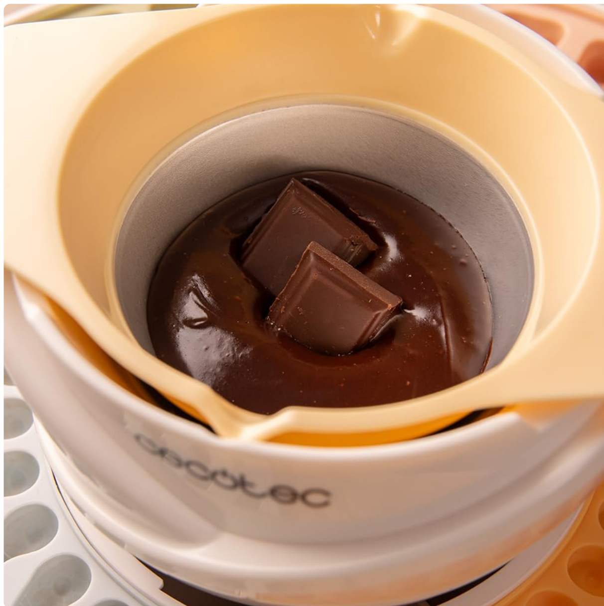
Image 5.2: A close-up view of chocolate pieces melting in the central pot.

unit. Use fondue forks or skewers to dip items into the melted chocolate.