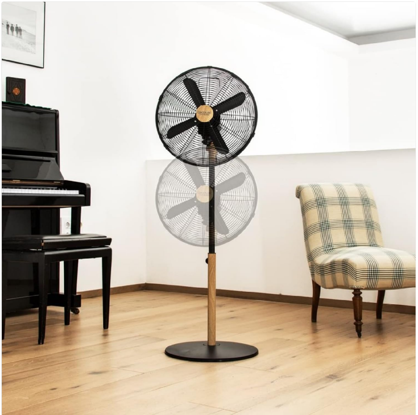
Figure 4: The fan operating with its oscillation feature, effectively circulating air within a living space.