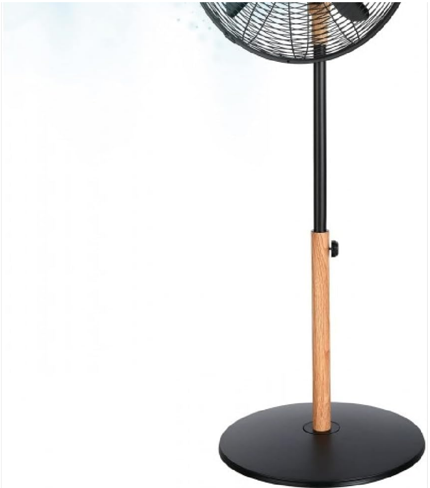
Figure 1: Fully assembled Cecotec EnergySilence 600 Woodstyle Pedestal Fan, showcasing its design and airflow.