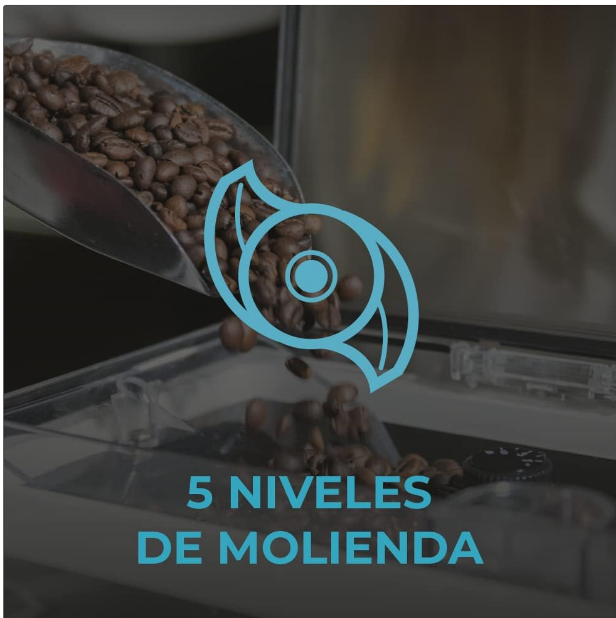
Figure 5.3: Icon indicating the 5 adjustable grinding levels for coffee beans.