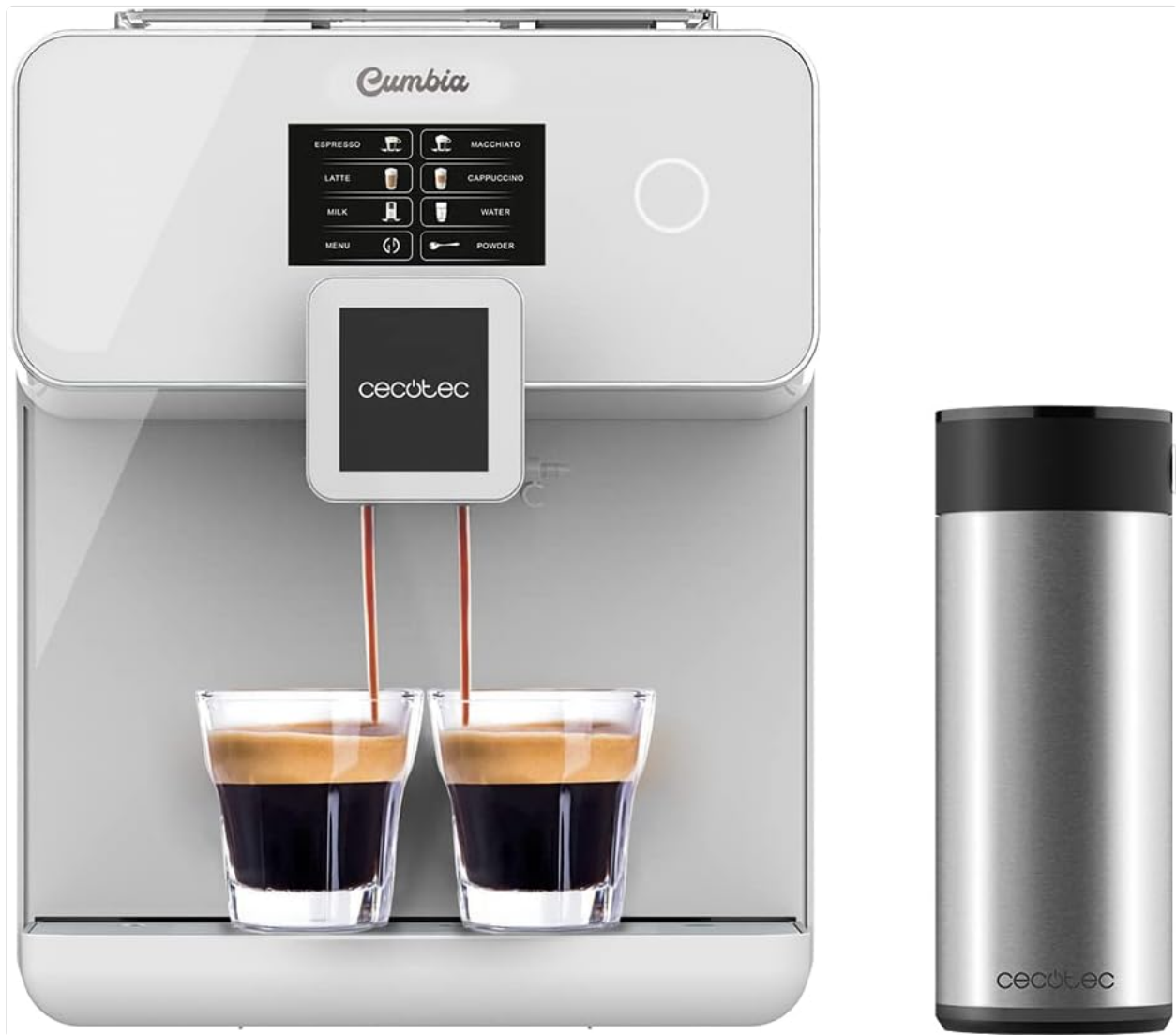
Figure 3.1: Overview of the Cecotec Power Matic-ccino 8000 Touch Série Bianca S. coffee machine with its main components.