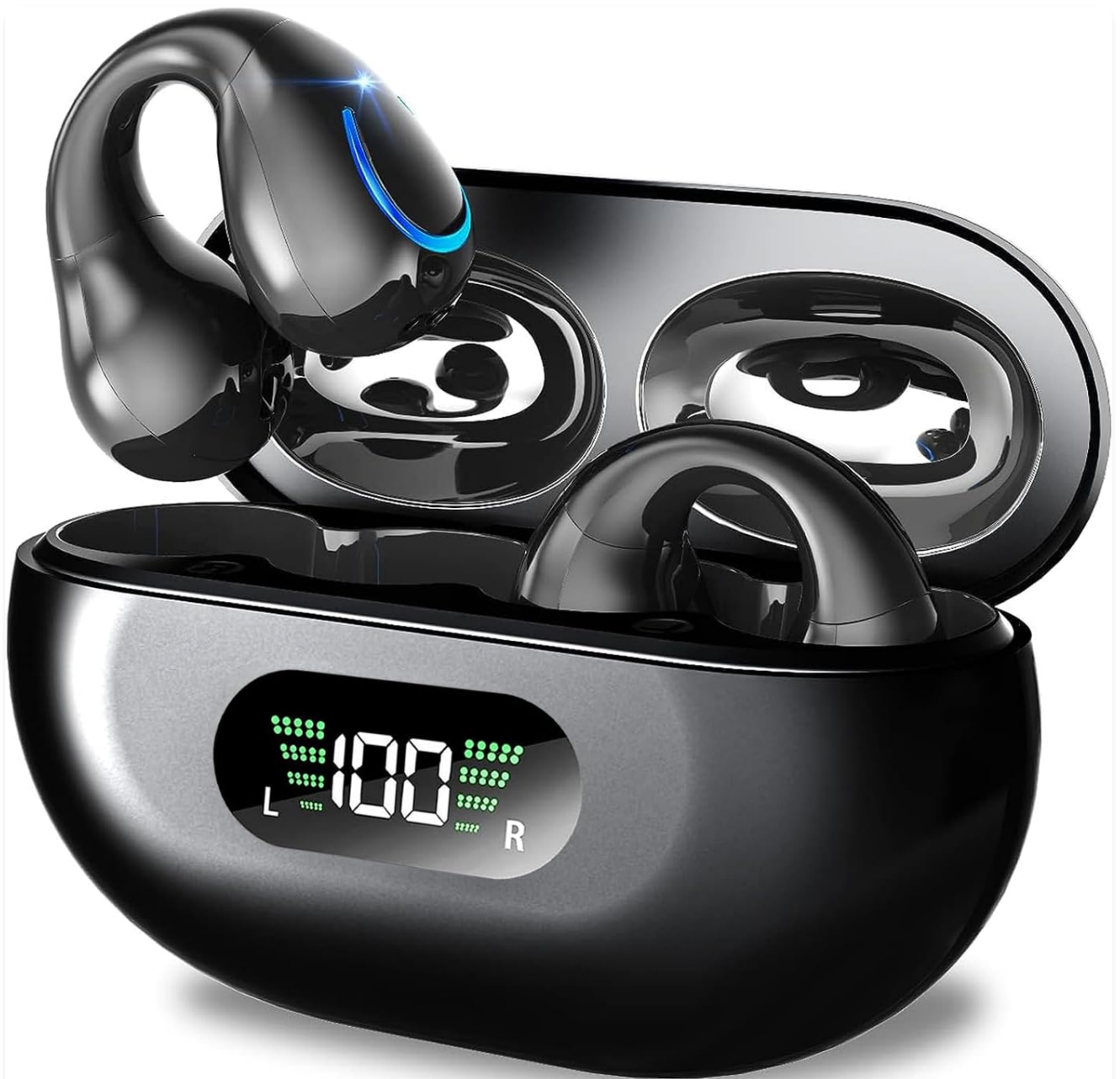
Image: Ertuly R15 Bone Conduction Open Ear Earbuds shown within their charging case. The case features a digital LED display indicating battery percentage for the case and individual earbuds.