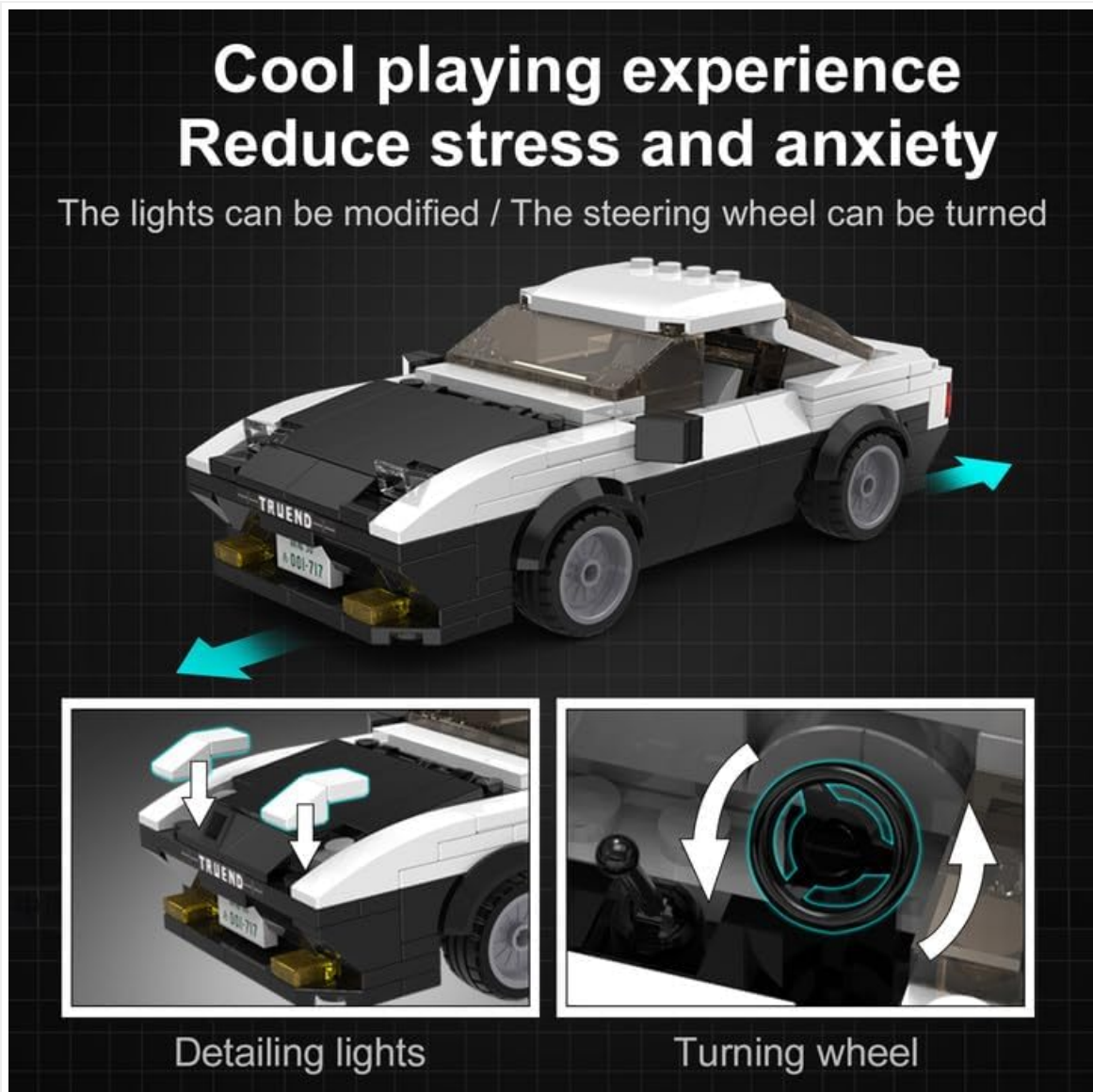
Figure 4: Illustration of the functional pop-up headlights and the turning wheel mechanism, allowing for interactive play and display.