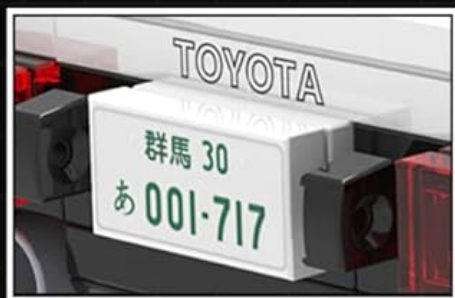
Exquisite car sticker