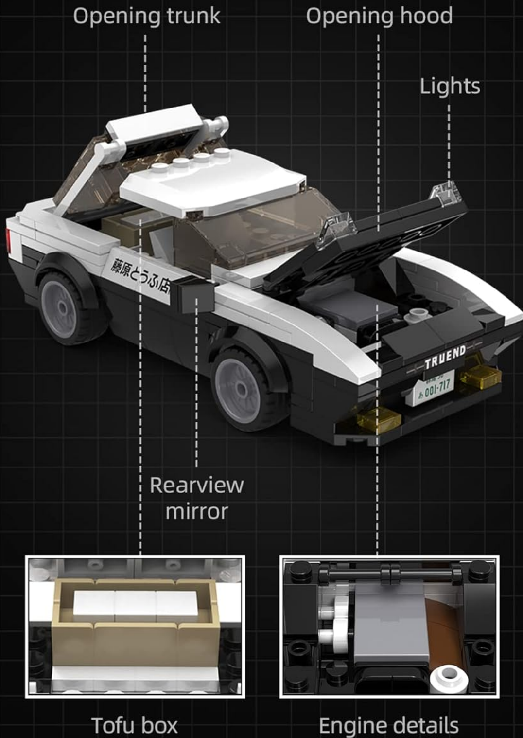
Figure 2: Detailed features of the AE86 model, including the opening trunk revealing a tofu box, opening hood with engine details, and functional pop-up lights.