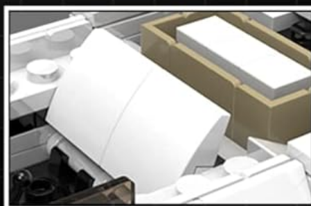
Front double seat