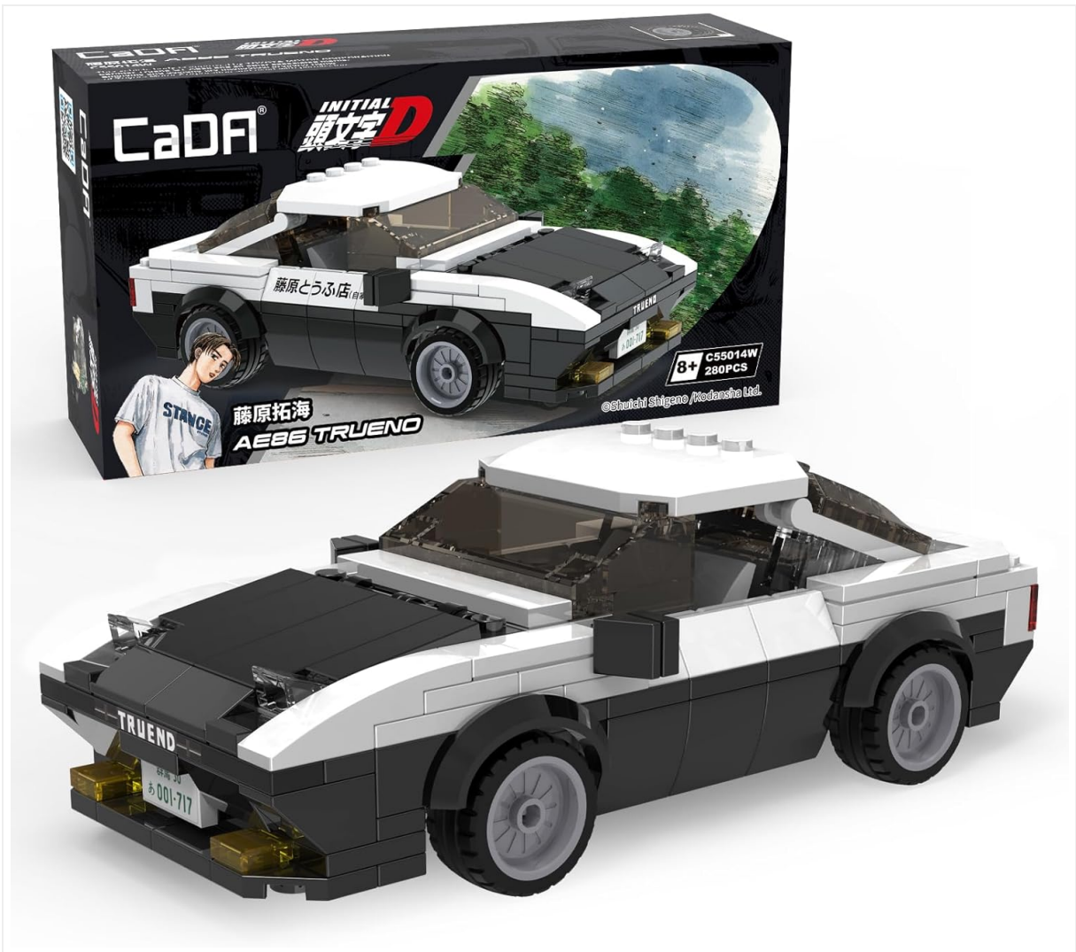
Figure 1: The CaDA Initial D Toyota AE86 Trueno building set, showing the product packaging and the fully assembled model.