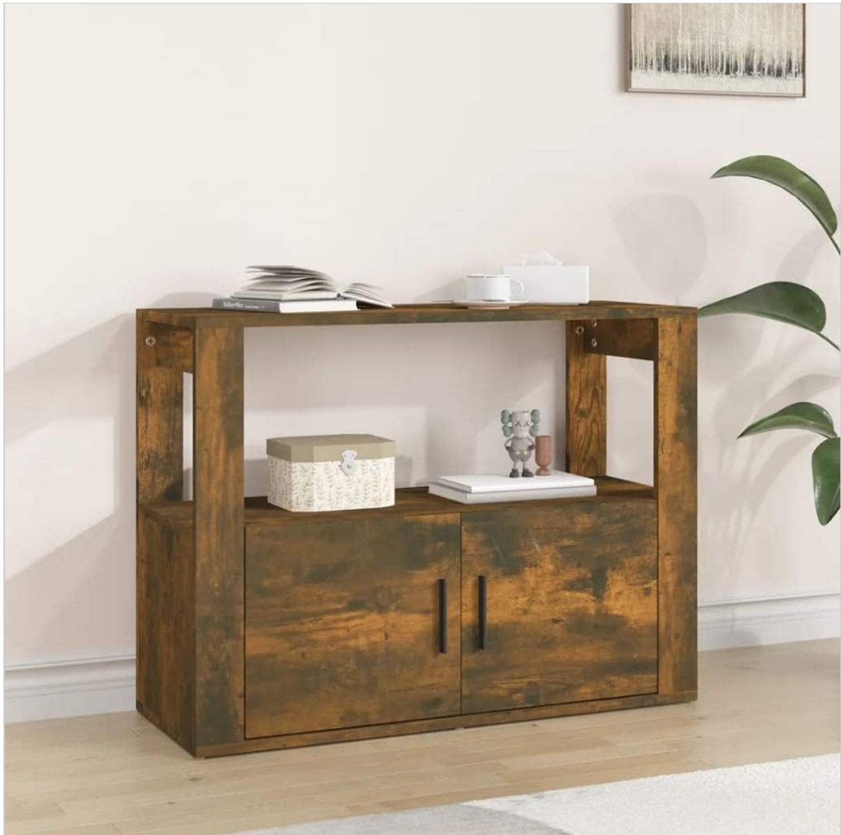
Image 1: Assembled vidaXL Buffet Storage Cabinet in a living room setting. The cabinet features an open top shelf and two lower doors, providing both display and concealed storage.