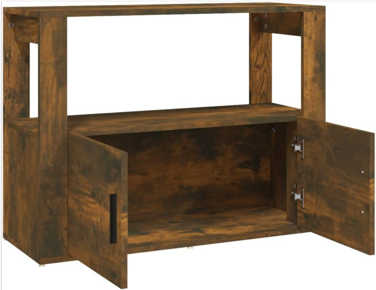
Image 3: The buffet cabinet with both lower doors open, revealing the internal storage compartment. This compartment is ideal for storing various items, keeping them organized and dust-free.