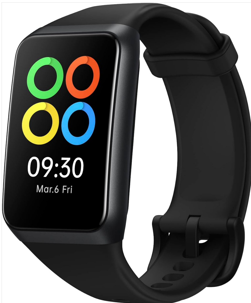
Image: OPPO Band 2 Smartwatch in black, featuring a rectangular display showing the time and activity rings.

This manual provides essential information for setting up, operating, and maintaining your OPPO Band 2 Smartwatch. Please read this guide thoroughly to ensure proper use and to maximize the device's features.