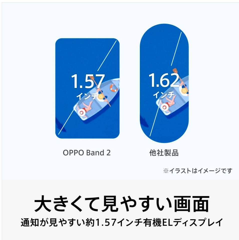
Image: A visual comparison illustrating the 1.57-inch display size of the OPPO Band 2.

The OPPO Band 2 features a 1.57-inch AMOLED touchscreen display. Swipe up/down or left/right to navigate through menus and features. Tap to select an option.