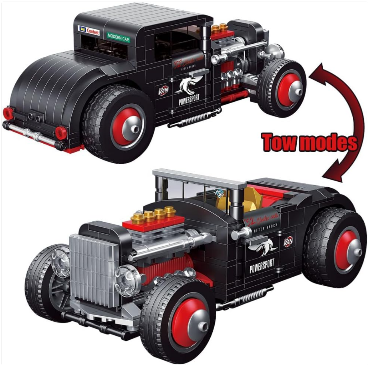
Image: Illustration of the RiceBlock Retro Car Sedan demonstrating its "tow modes" or alternative rear configurations.