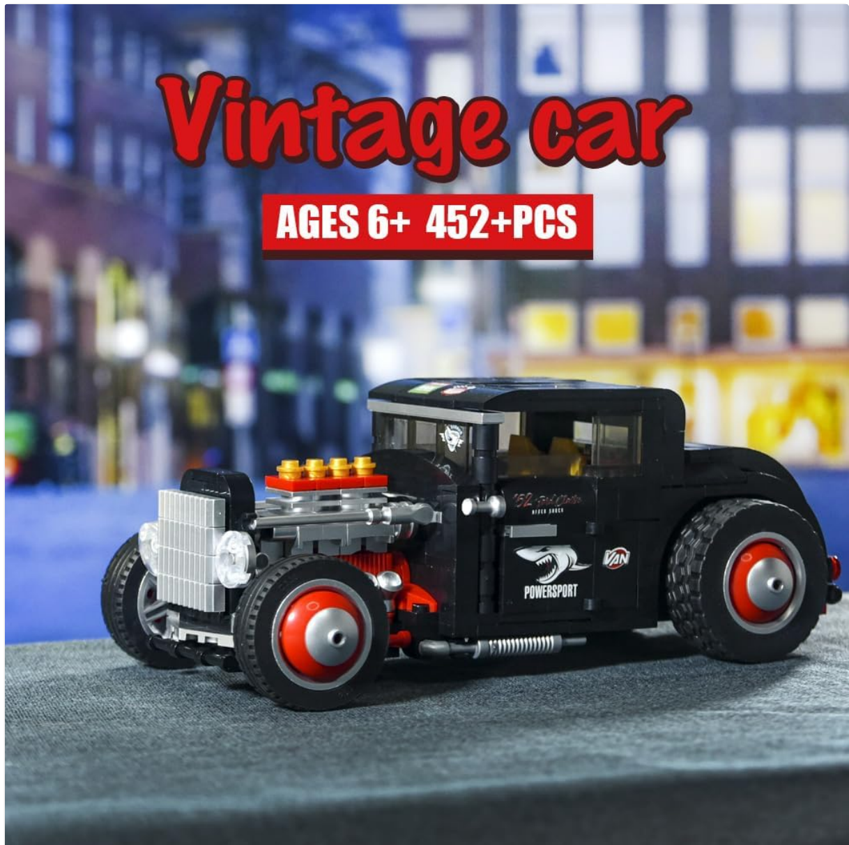
Image: The fully assembled RiceBlock Retro Car Sedan, showcasing its vintage design.