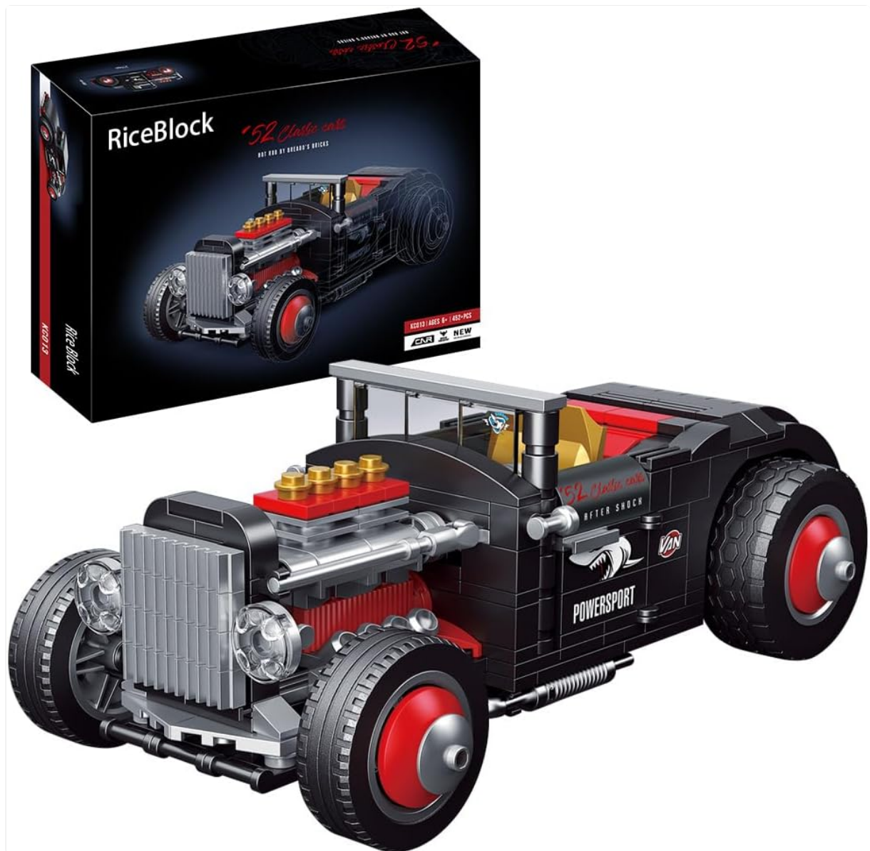
Image: The RiceBlock Retro Car Sedan Building Set, showing the assembled model alongside its product packaging.