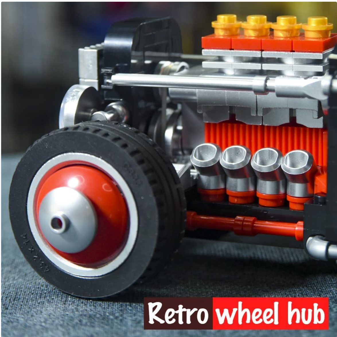
Image: A detailed view of the retro-styled wheel hub on the RiceBlock Retro Car Sedan.