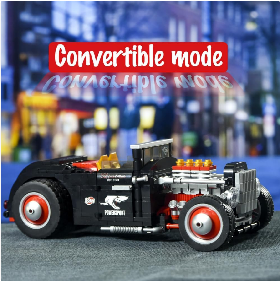
Image: The RiceBlock Retro Car Sedan displayed in its convertible mode, with the roof removed.