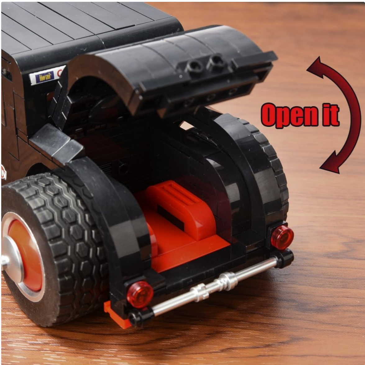
Image: The RiceBlock Retro Car Sedan with its rear trunk lid open, showing the interior compartment.