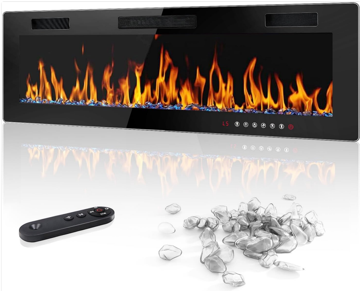
Image 2.1: The LEMBERI 60 inch Electric Fireplace, showcasing its sleek design, flame effect, and included remote control and decorative crystals.