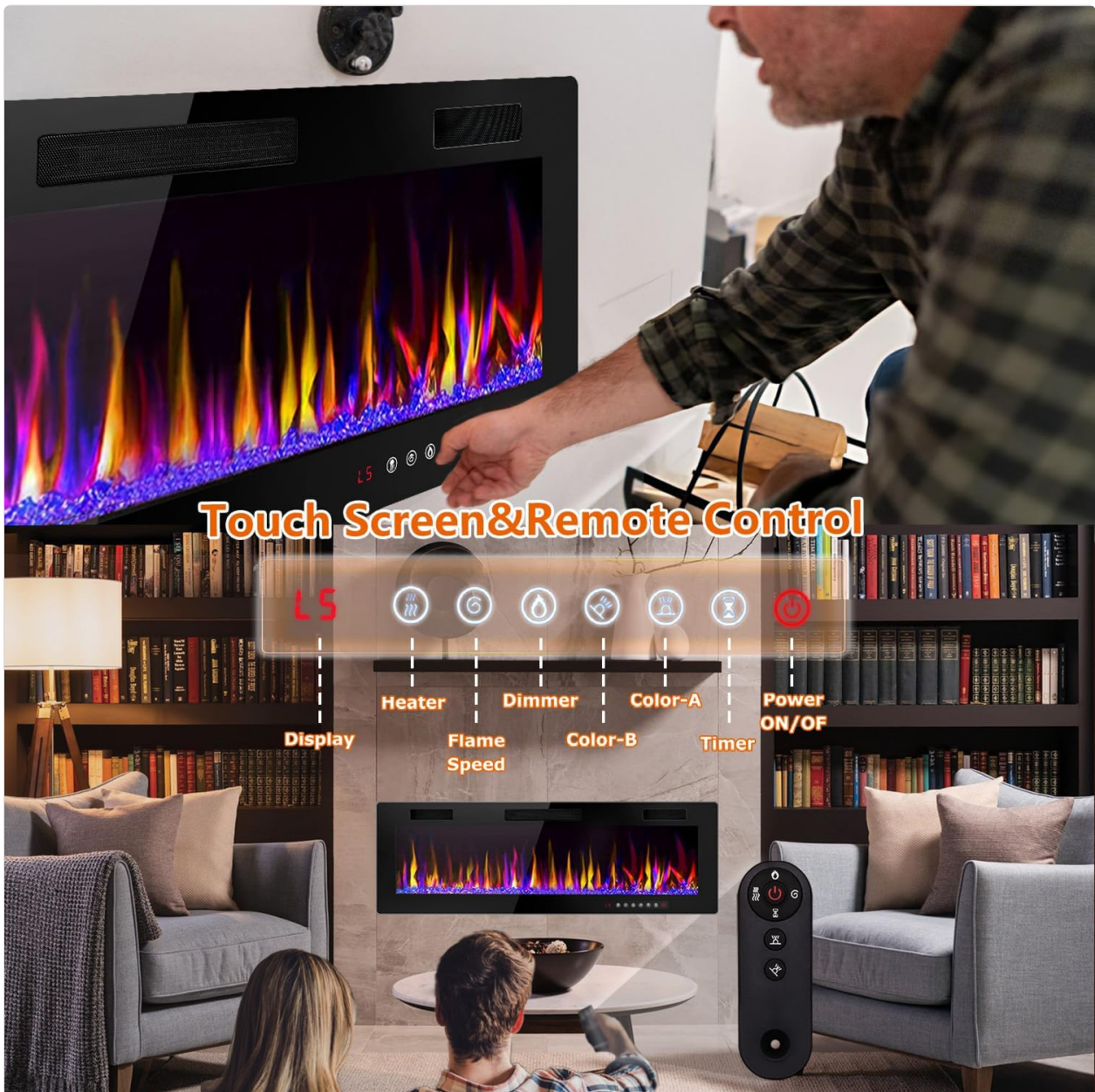
Image 4.1: The fireplace's touch screen control panel and the remote control, highlighting various function buttons.

the included remote control. Both methods provide access to all functions.