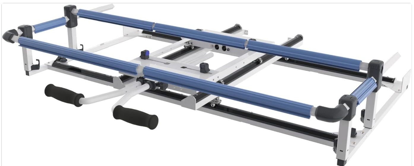
Figure 2.2: The Q'nique 16X Elite Longarm Quilting Machine, showcasing its compact design.