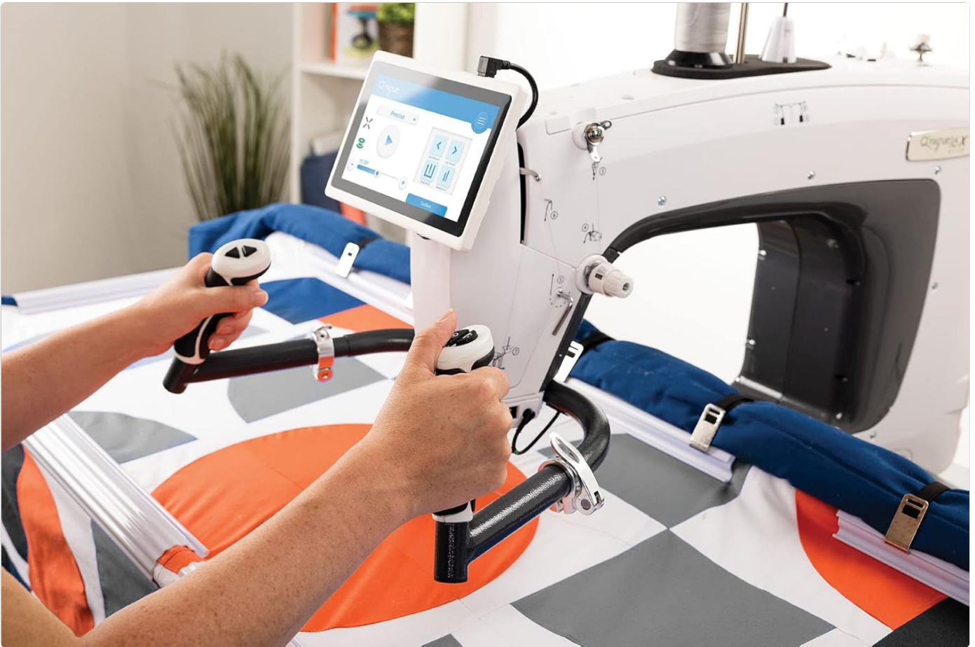
Figure 3.1: A user demonstrating the ergonomic handles and control buttons of the Q'nique 16X Elite.