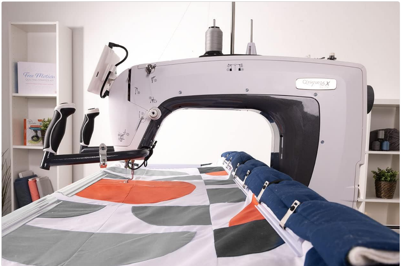
Figure 3.4: The Q'nique 16X Elite and Cutie Frame set up for a quilting project.

The Cutie Tabletop Fabric Quilting Frame simplifies fabric management, allowing users to focus on the creative aspects of quilting. Its lightweight and portable design enables use on any table or desk, and it can be easily stored. The frame supports projects of any size, from crib to king, utilizing a zone-to-zone quilting method.