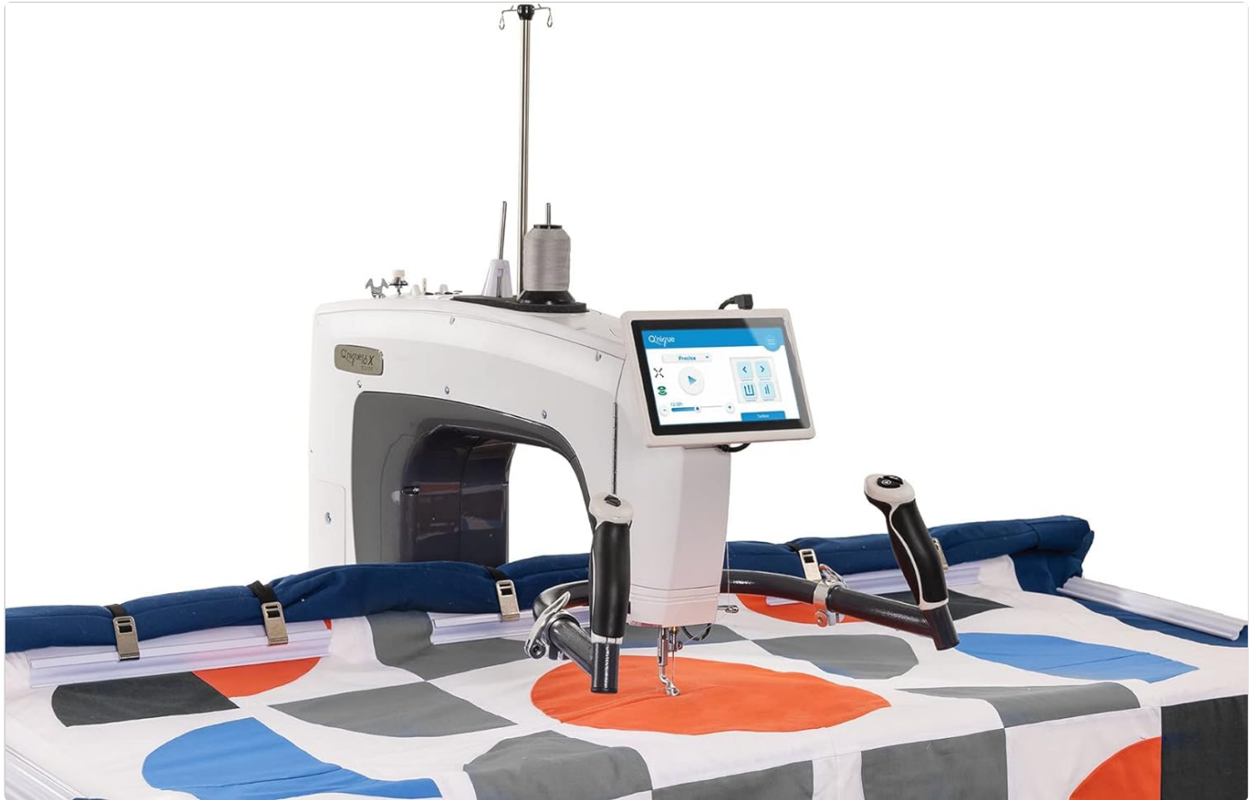
Figure 2.1: Q'nique 16X Elite Longarm Quilting Machine mounted on the Cutie Tabletop Frame, ready for use.