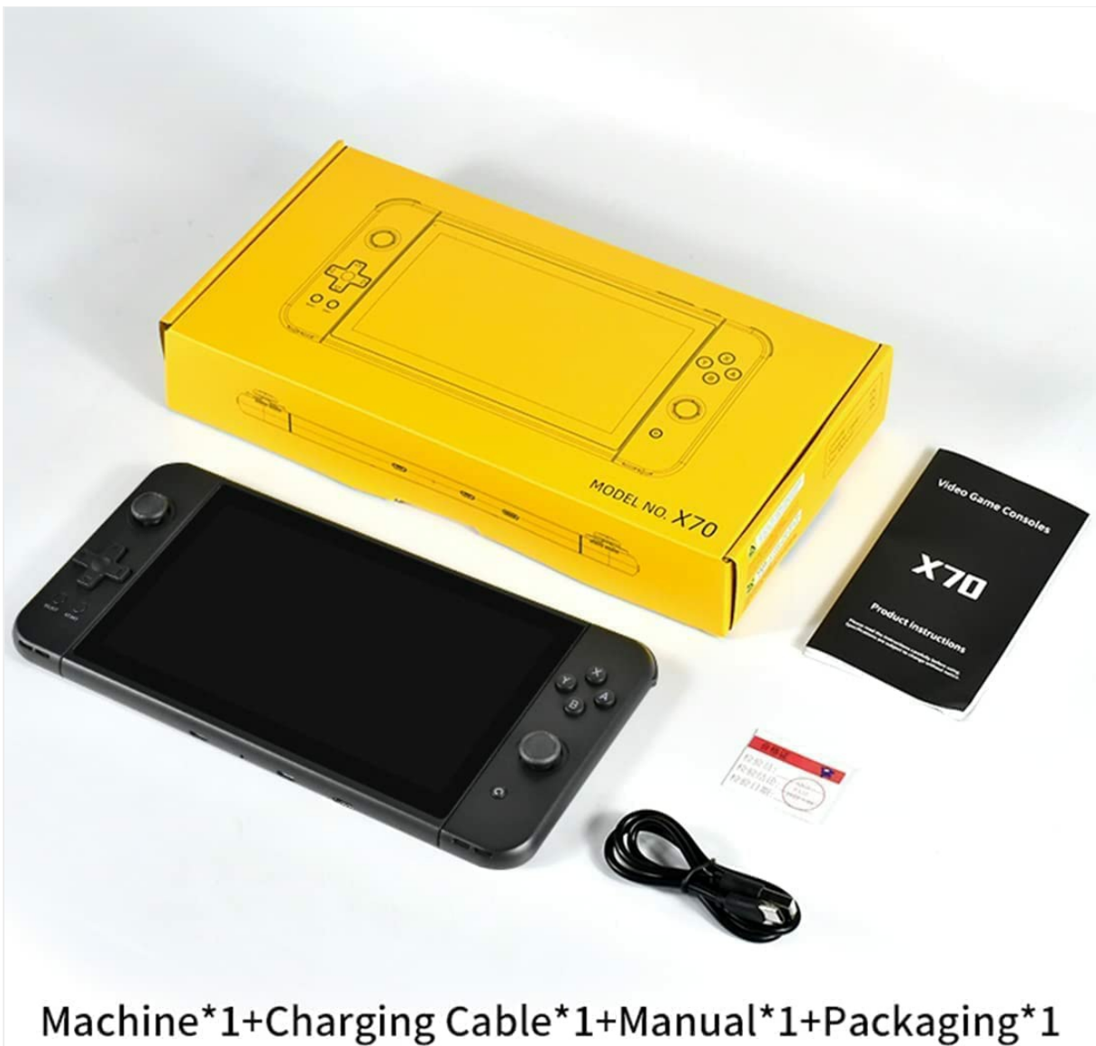
Figure 3.1: The Powkiddy X70 package contents, showing the console, charging cable, and product instructions manual.