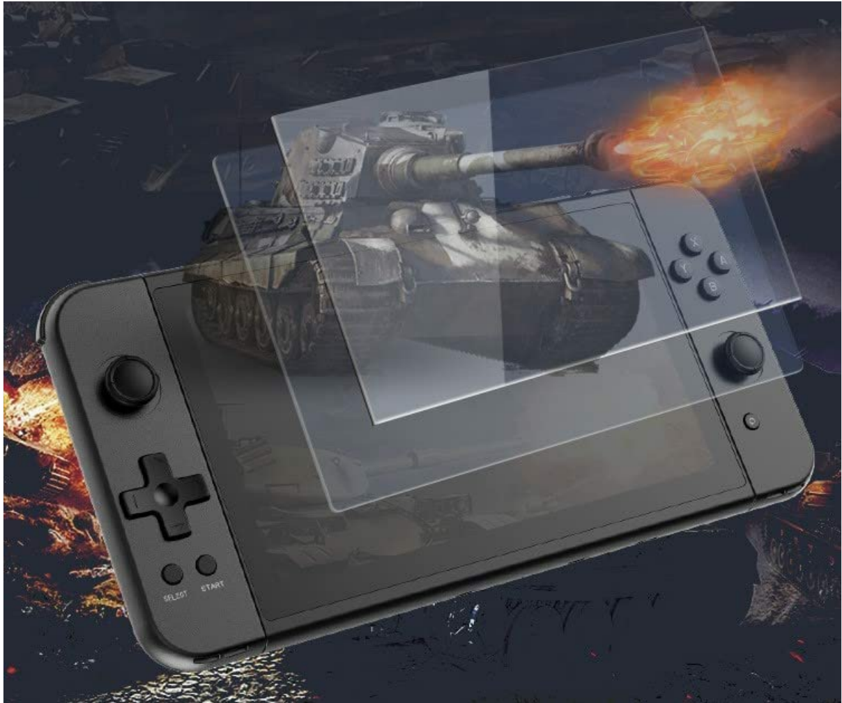
Figure 6.1: Illustration of a screen protector being applied to the Powkiddy X70 console, emphasizing screen care.

To protect the 7-inch IPS screen from scratches and damage, consider applying a screen protector.