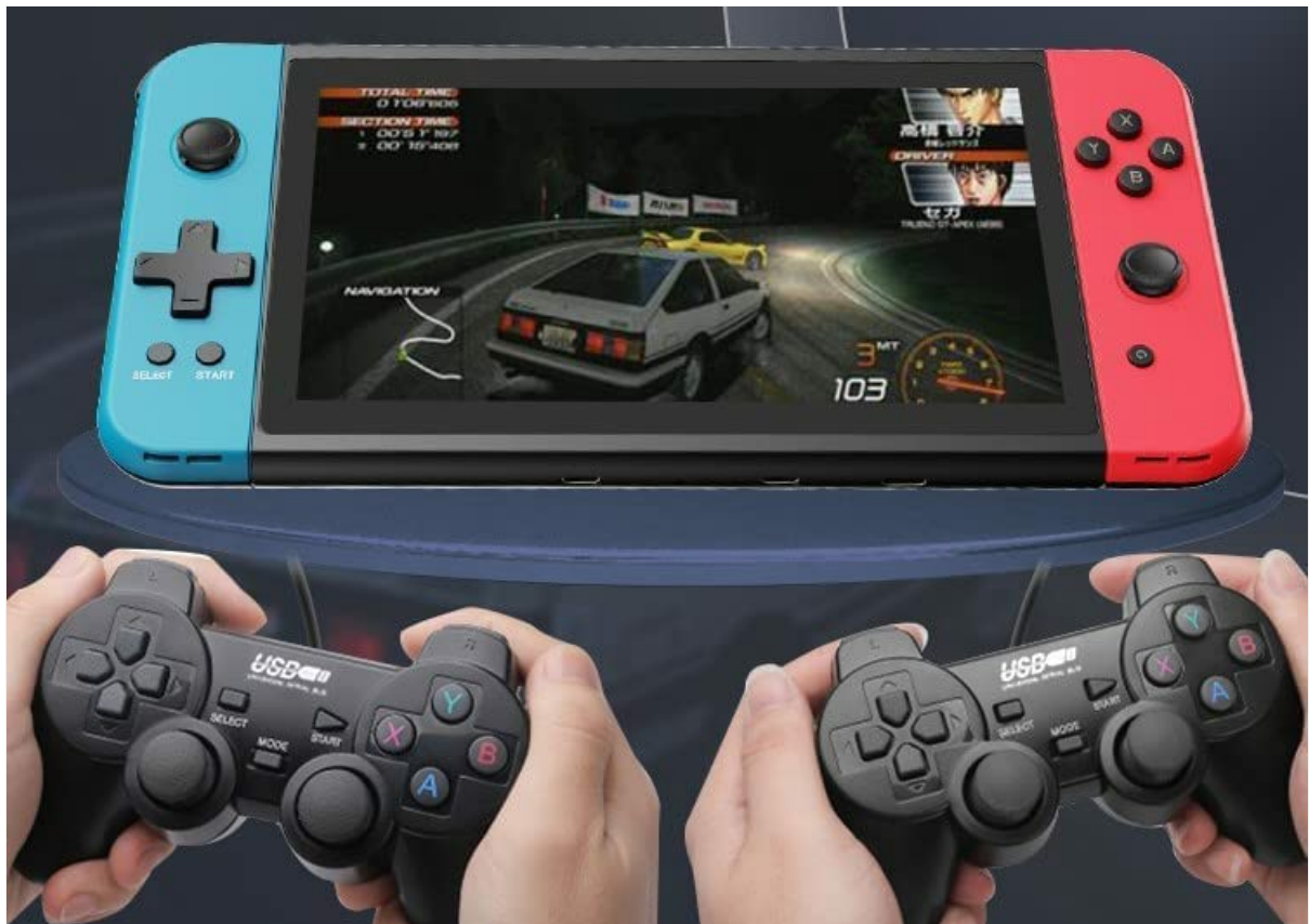
Figure 5.2: The Powkiddy X70 console demonstrating two-player functionality with external USB gamepads, playing a racing game.