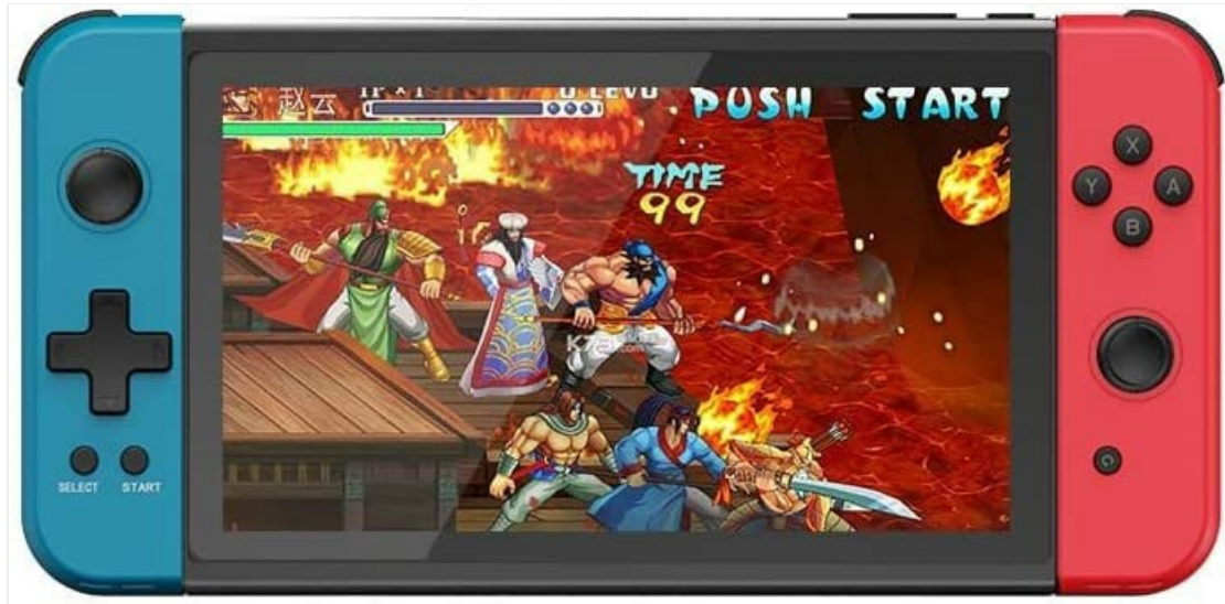
Figure 5.1: The Powkiddy X70 console in use, displaying a retro fighting game. This image illustrates the console's screen and control layout.

Use the D-pad (directional pad) or joystick to navigate through menus and game selections. The 'A', 'B', 'X', 'Y' buttons and 'SELECT', 'START' buttons are used for confirming selections, canceling, and in-game actions.