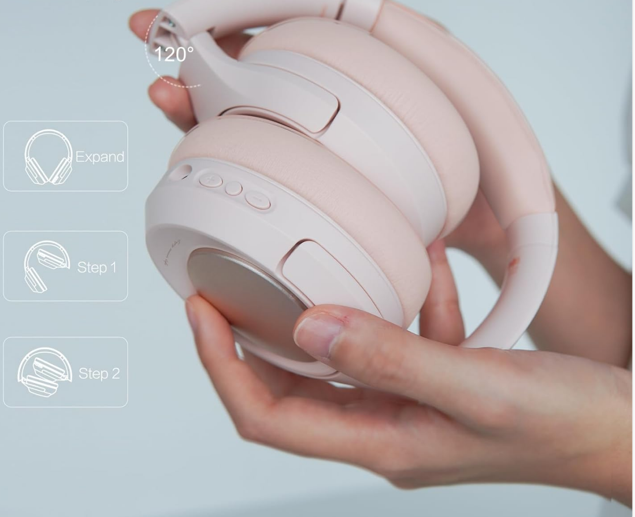
Image: Foldable Storage. This image demonstrates the folding mechanism for convenient storage and portability.

The headphone adopts a foldable design, which greatly increases the flexibility of storage and makes storage and carrying more convenient.