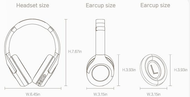
Image: Official Packaging and Product Dimensions. This image illustrates the items included in the box and provides detailed size specifications for the headphones and earcups.