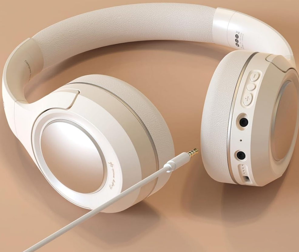
Image: Wireless/Wired Connection. This image demonstrates how to connect the headphones using the included 3.5mm audio cable.

Compatible with Android /Apple mobile phones, including computers, TVs, tablets and other electronic devices that can turn on Bluetooth, one headset can connect multiple devices. A 3.5mm audio cable is included for wired connection, keeping the music on even when the battery runs out.