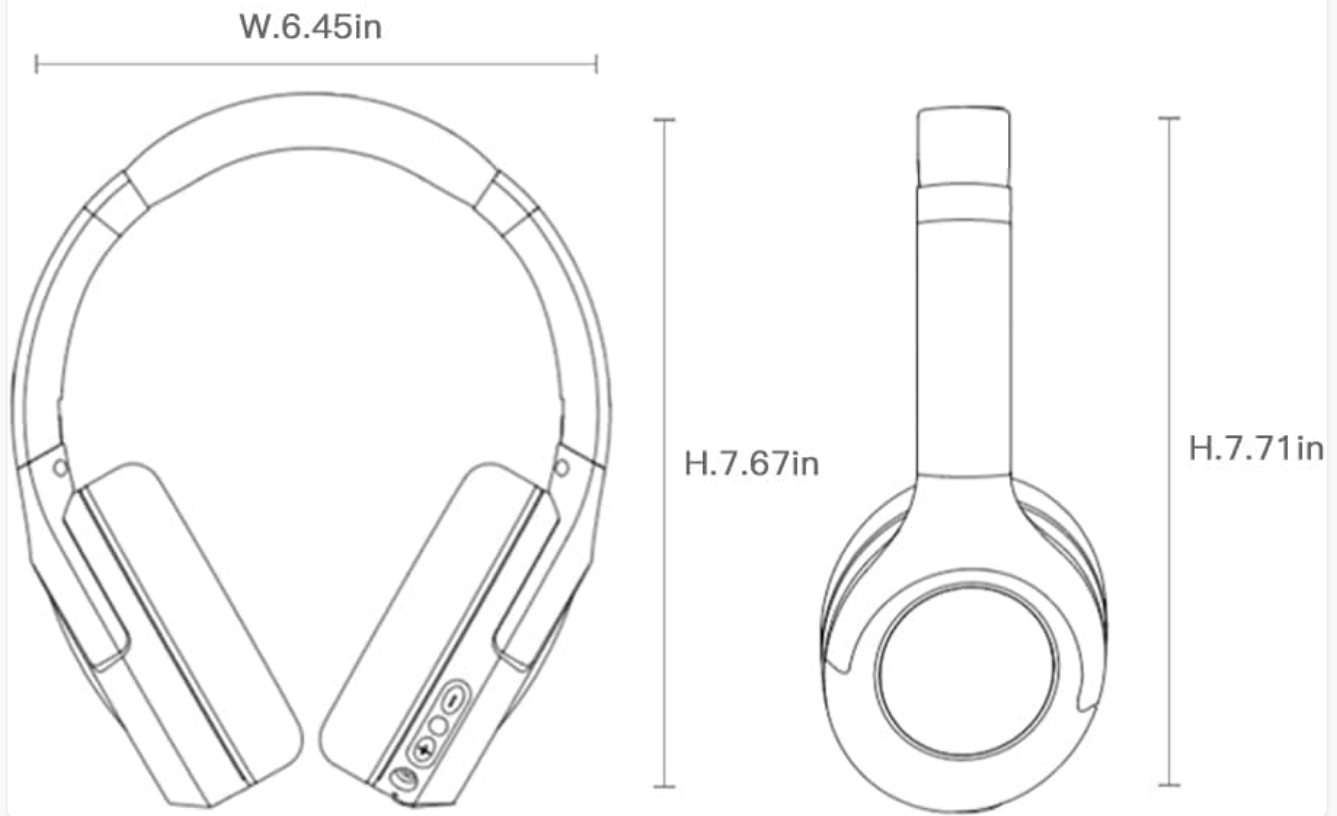
Image: Product Size Diagram. This diagram provides precise measurements for the headphones, including width and height.