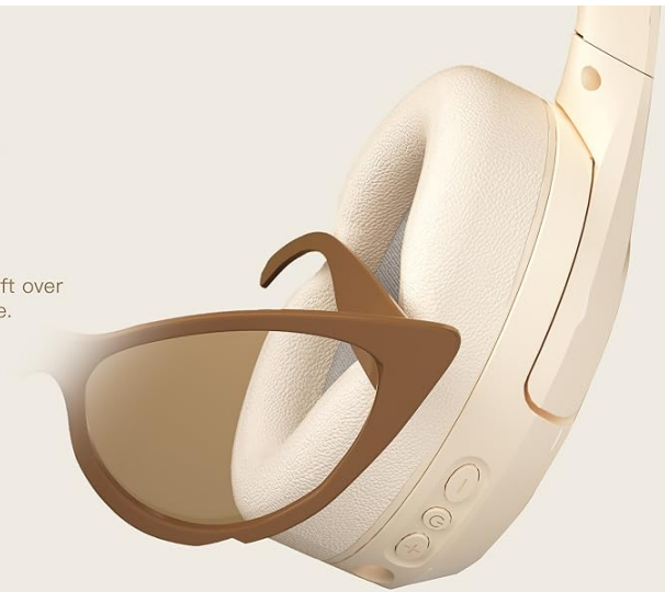
Image: Pressure-Free Comfort. This image highlights the soft, breathable materials designed for long-term wear.