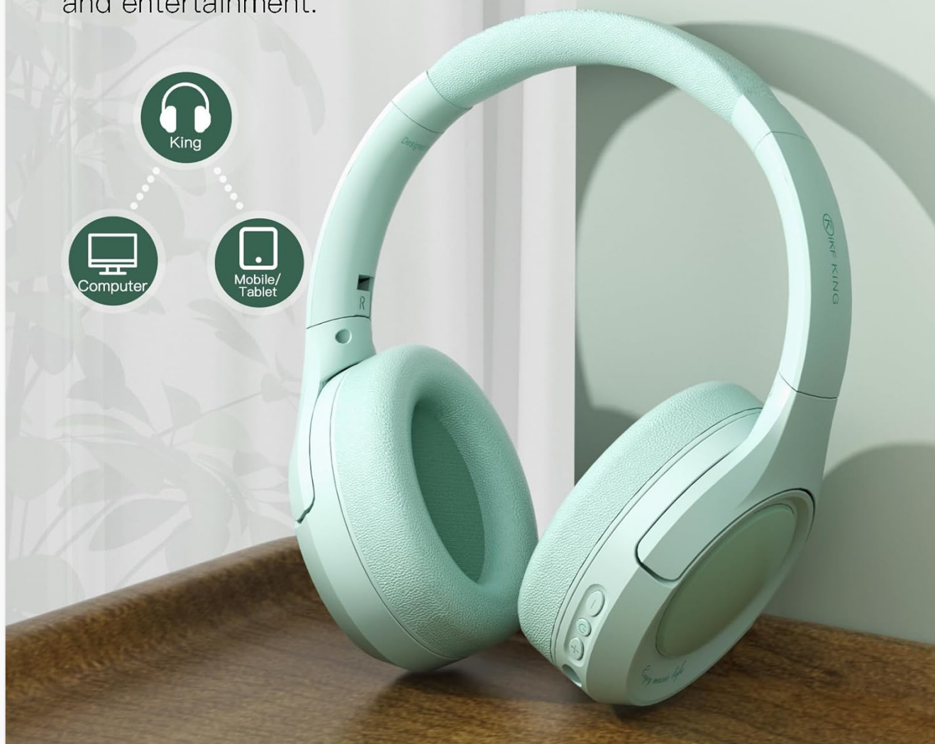
Image: Pairing 2 Devices. This image visually represents the ability to connect the headphones to multiple devices simultaneously.

Support connecting with two Bluetooth devices simultaneously. Easily switch between work and entertainment.