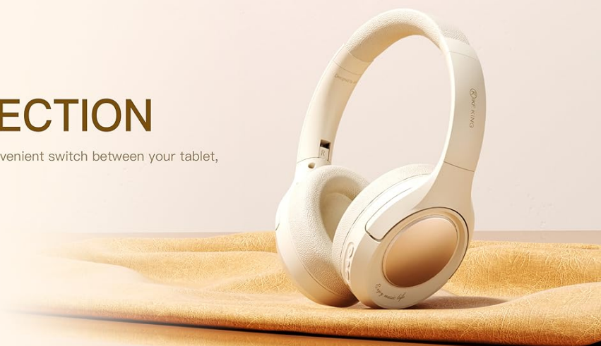
Image: Multi-Point Connection. This image further emphasizes the stable multi-point connection feature for various devices.