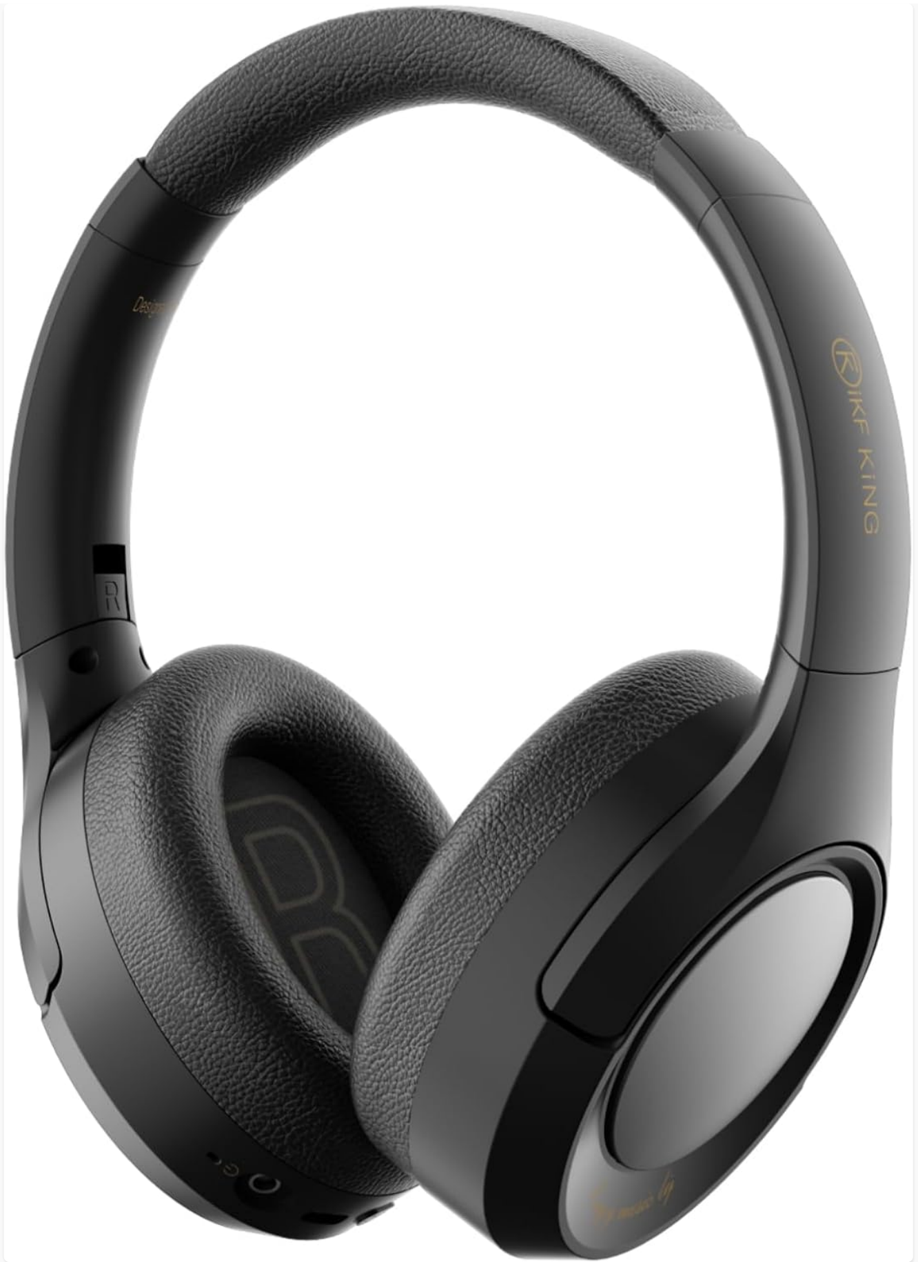
Image: Front view of the iKF King Wireless Active Noise Cancelling Headphones in black. This image highlights the overall design and form factor of the product.