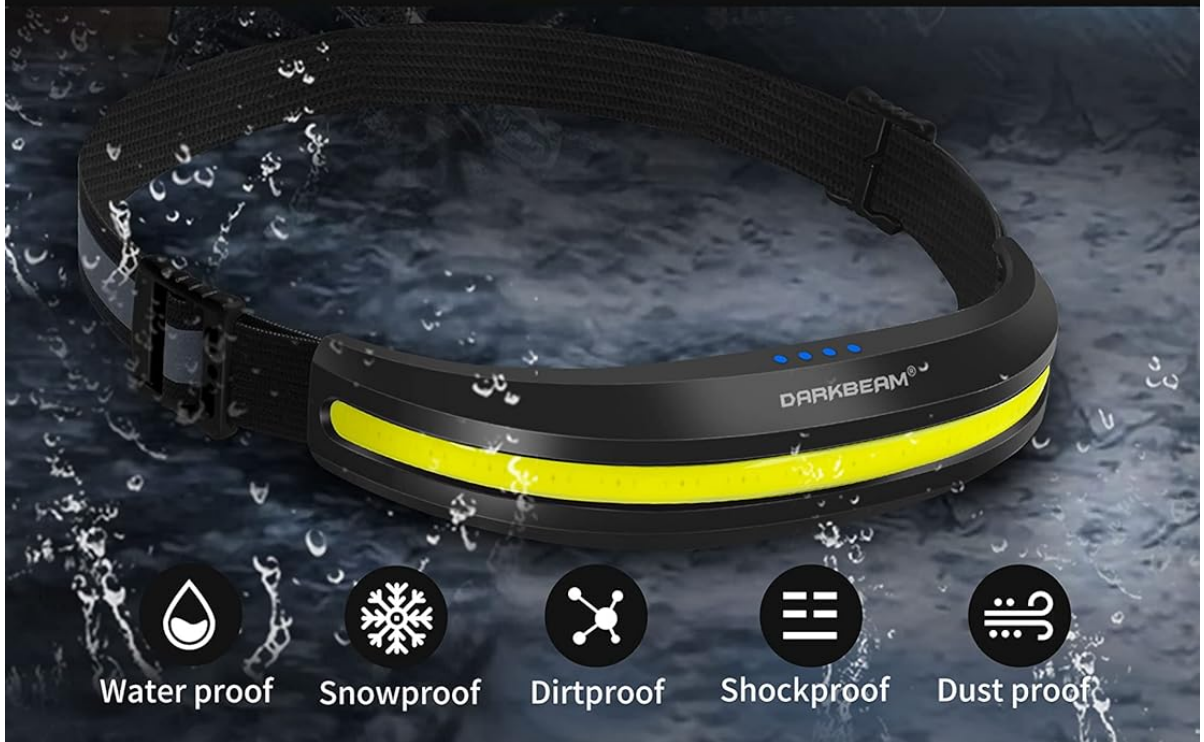
Image: The DARKBEAM LX300 headlamp shown in a wet environment, illustrating its IPX4 waterproof rating, indicating resistance to splashes and light rain.