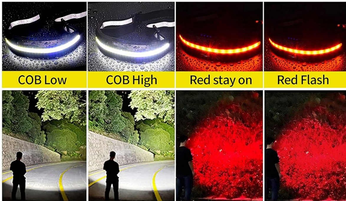
Image: The DARKBEAM LX300 headlamp illustrating its four distinct light modes: COB Low, COB High, Red Stay On, and Red Flash, with examples of their illumination patterns.