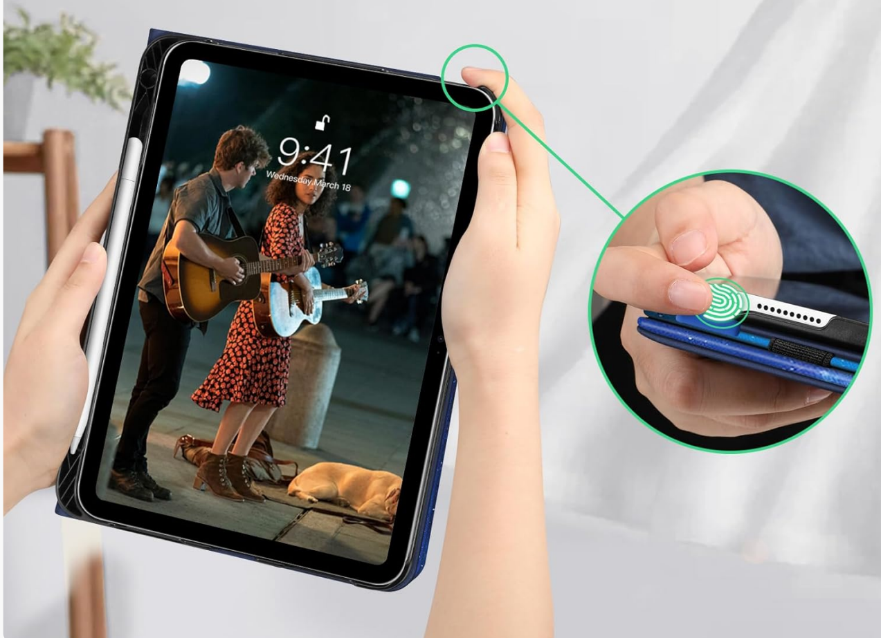
Figure 7: Touch ID Securely Unlock Your iPad, with exposed ports.

All buttons and ports are exposed for smooth control.