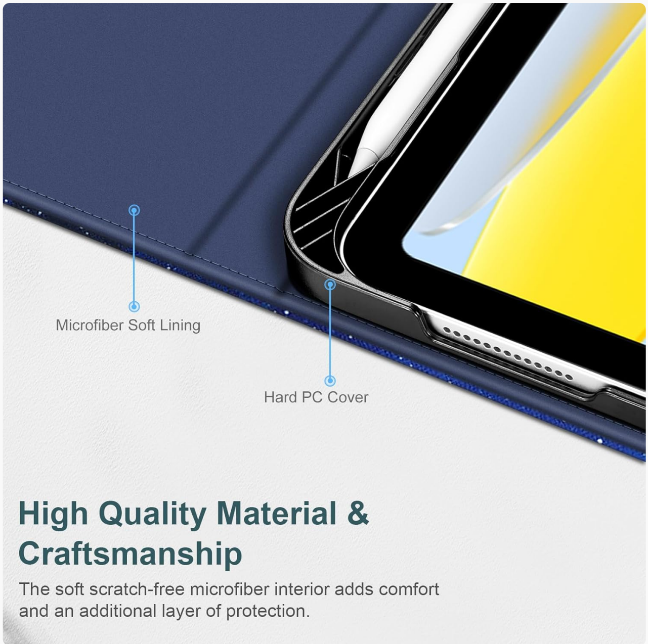
Figure 6: High Quality Material & Craftsmanship, showing microfiber lining and hard PC cover.