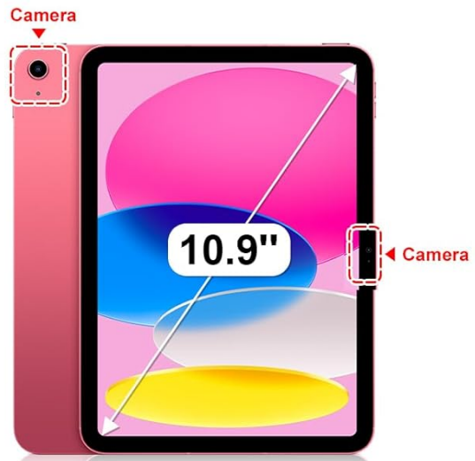
iPad 10th Gen 2022