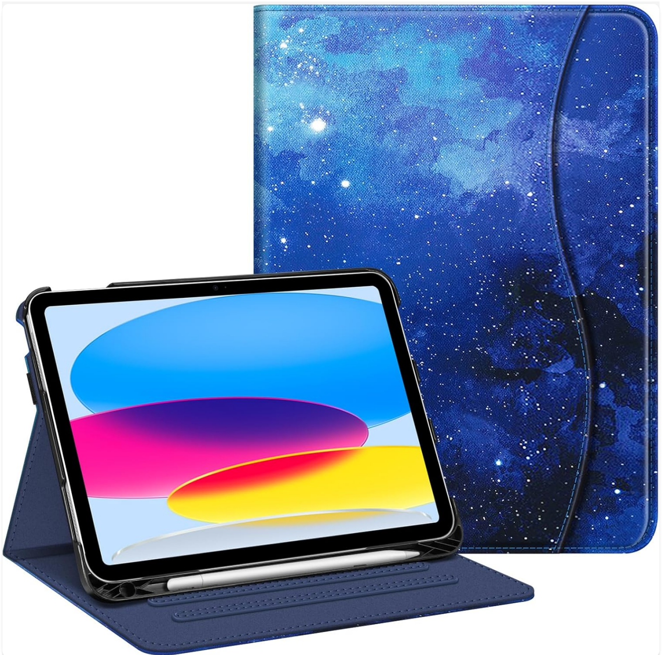
Figure 1: Fintie Case with iPad in viewing stand position.