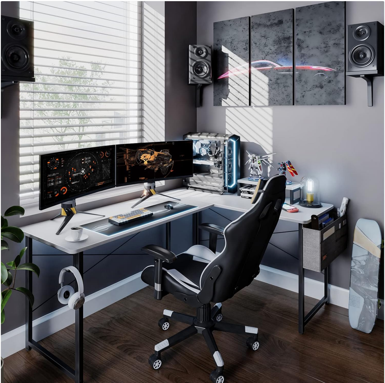
Image: An ODK L-shaped desk set up in a modern office, featuring multiple monitors and a gaming chair, demonstrating its spacious layout.