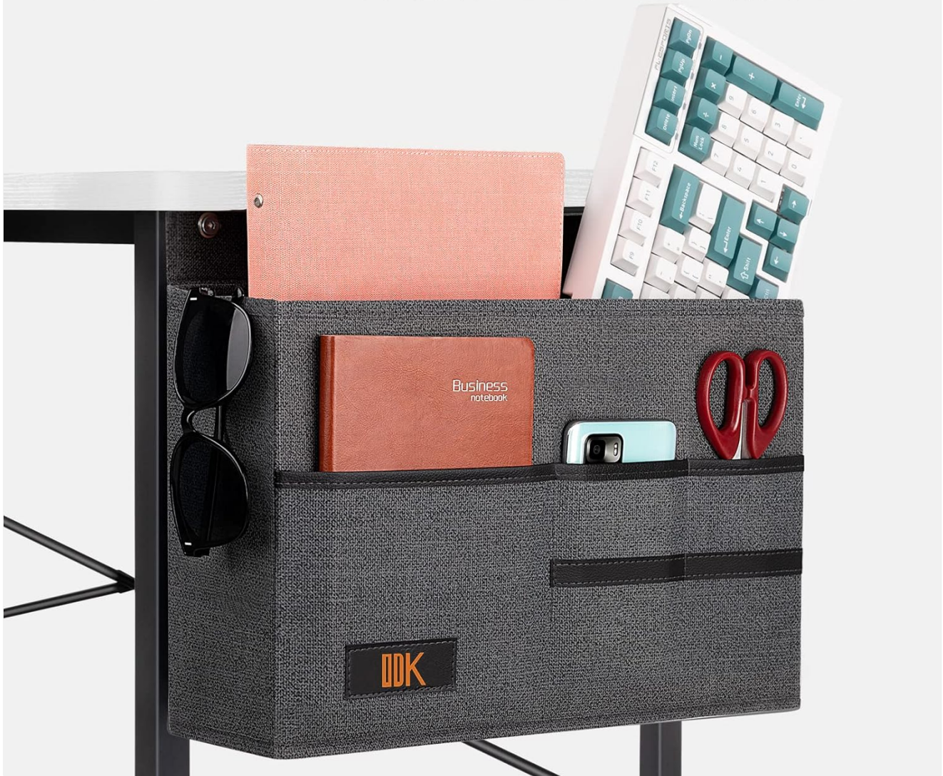
Image: A close-up of the desk's storage bag, showcasing its capacity for various office supplies and personal items.