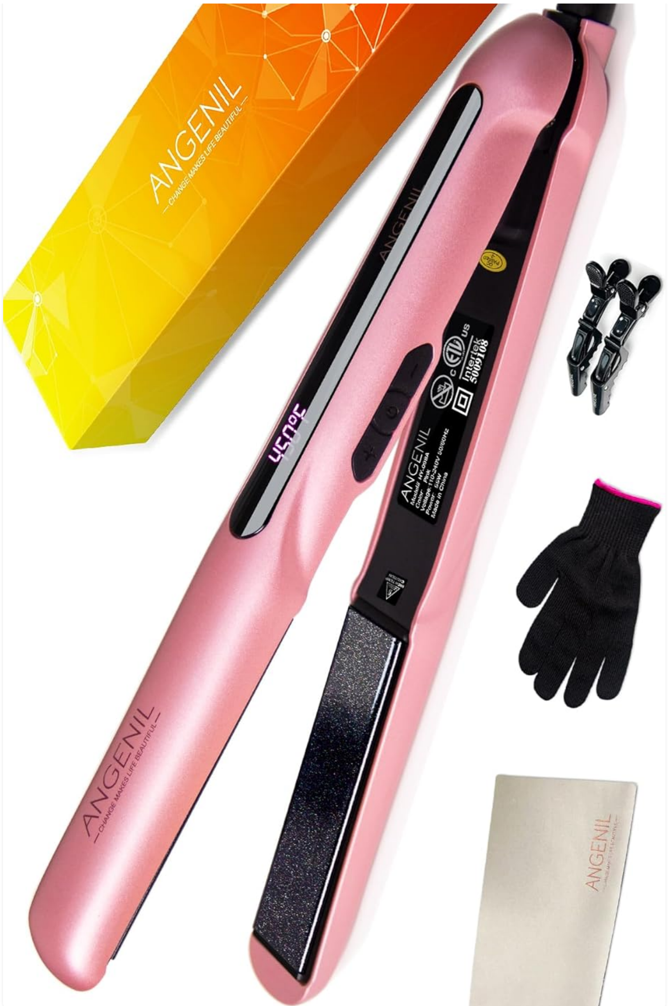
Image 3.1: The ANGENIL Ceramic Flat Iron, showing the pink straightener, its packaging box, two hair clips, a heat-resistant glove, and a small cleaning cloth.