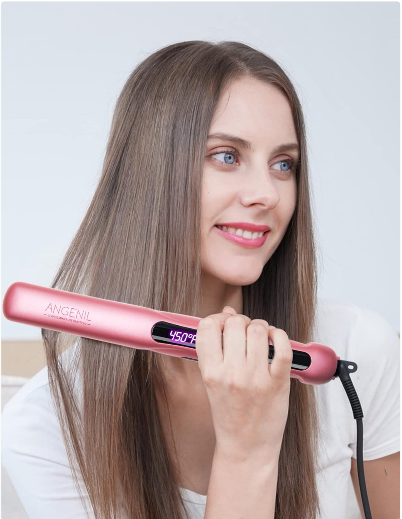
Image 5.2: A woman holding the ANGENIL flat iron, demonstrating its ergonomic design and ease of use for styling hair.