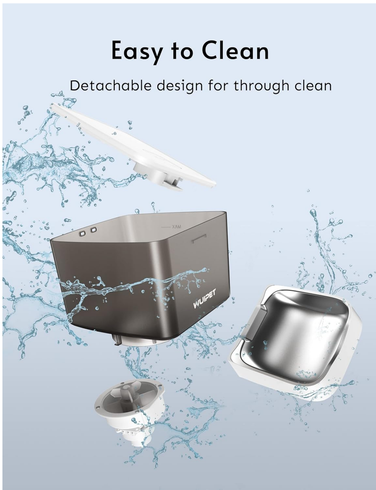
Image: The feeder features a detachable design for easy and thorough cleaning of food-contact parts.