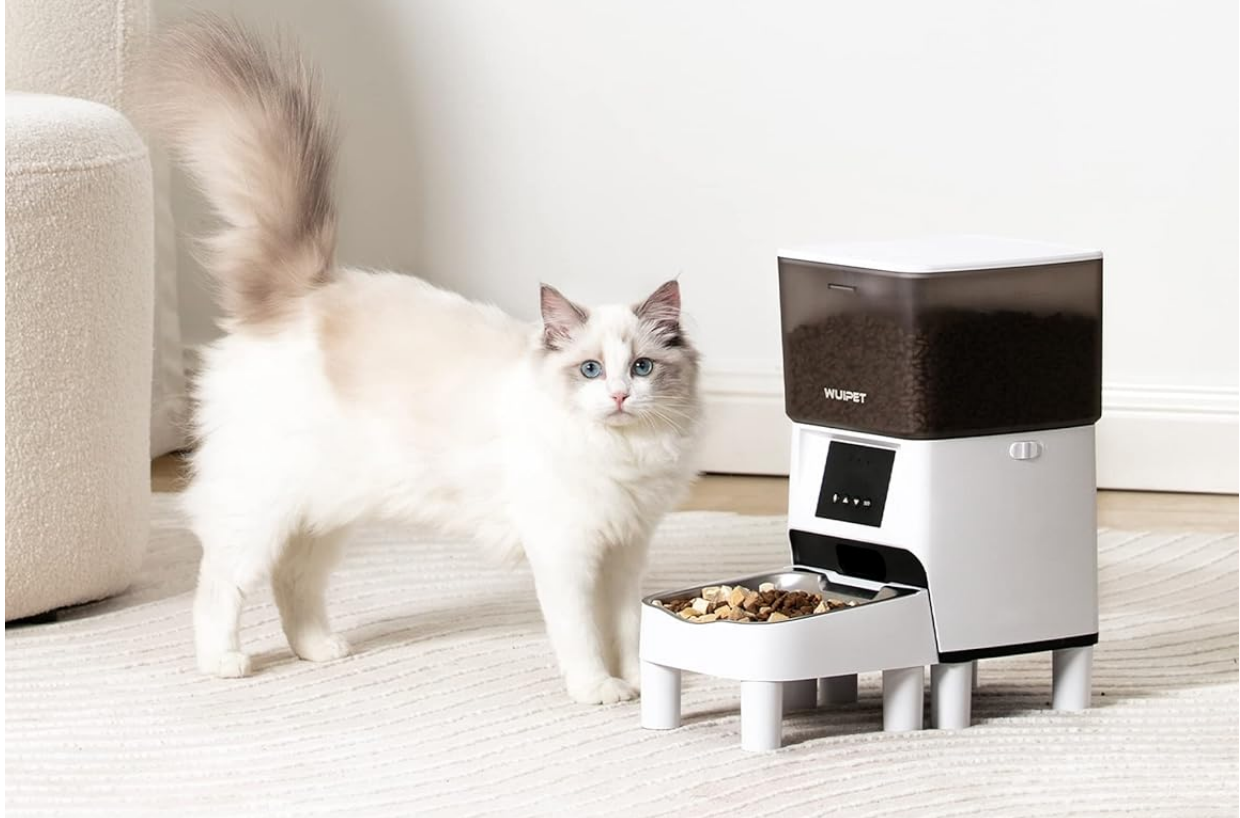
Image: The app enables you to manage your pet's feeding schedule from anywhere, ensuring timely meals.