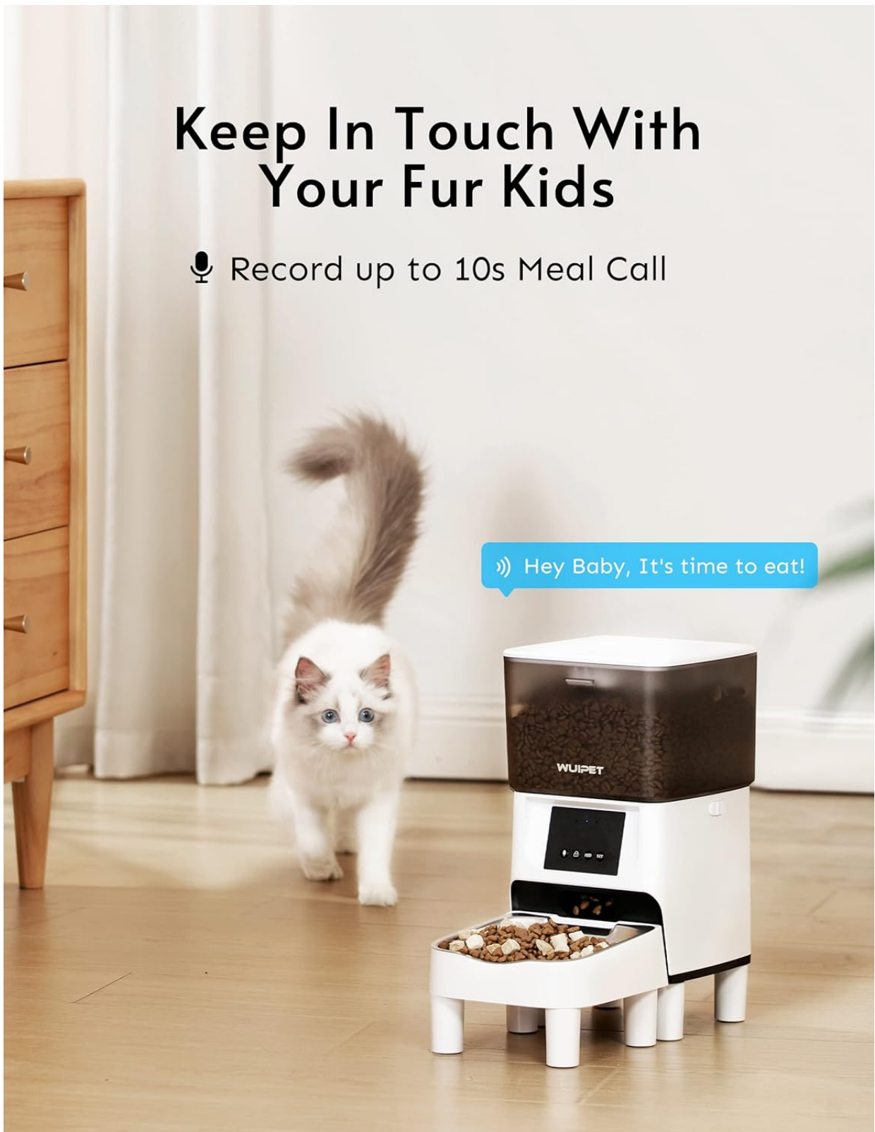
Image: Record a personalized 10-second message to call your pet for meals.