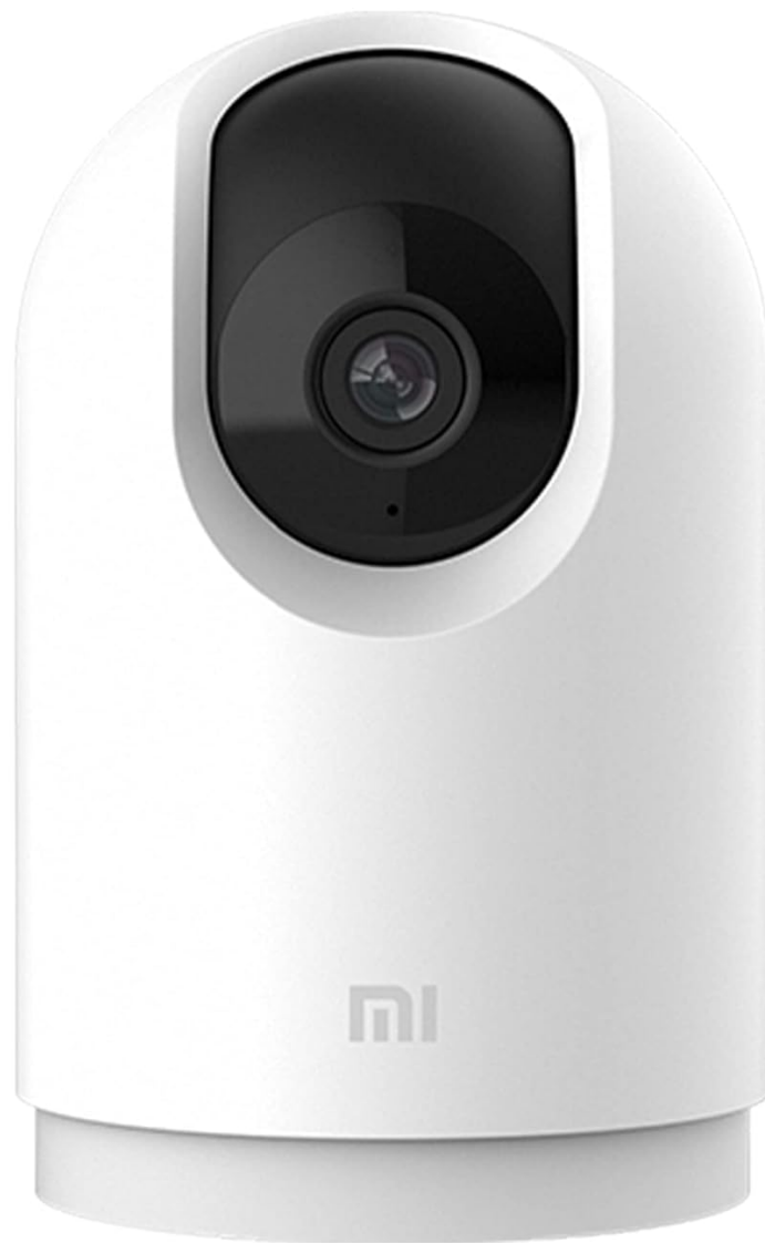
Image: The Mi 360° Home Security Camera 2K Pro, a white spherical camera with a black lens module.