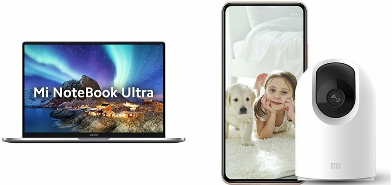
Image: The MI Xiaomi Notebook Ultra laptop, showcasing its display with a scenic wallpaper.