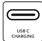
Image: Side profile of the MI Xiaomi Notebook Ultra, highlighting the various ports including Thunderbolt 4 and USB Type-C.