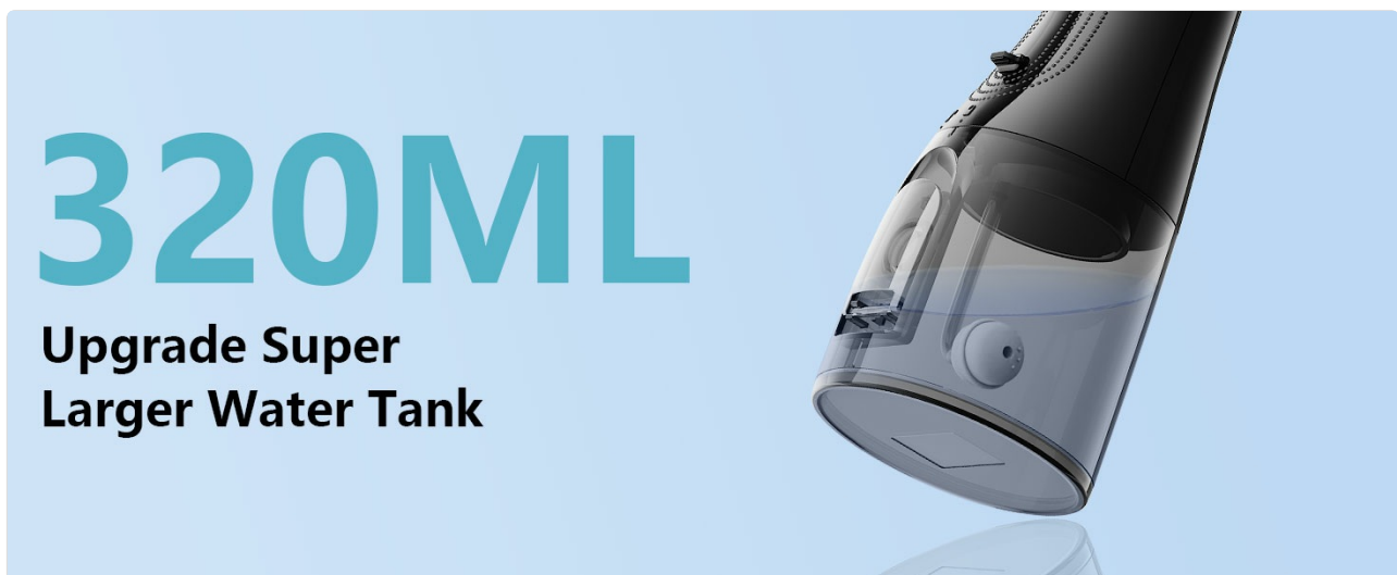
Image: Illustration of how to fill the water tank of the Grinest Water Flosser.