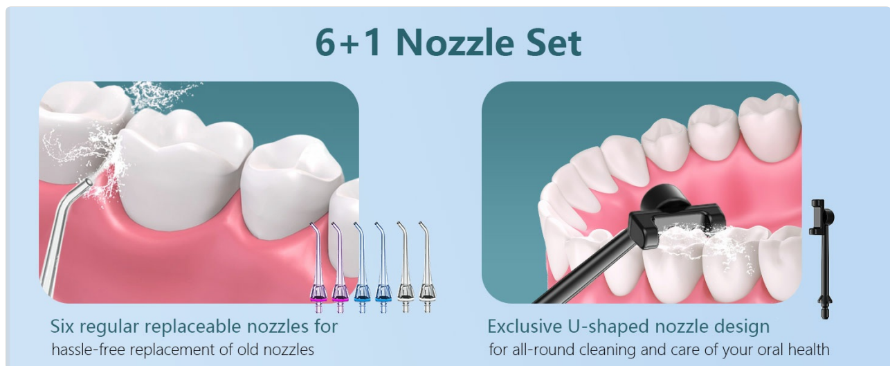
Image: The Grinest Water Flosser unit shown with its accompanying 6 regular nozzles and 1 unique U-shaped nozzle.