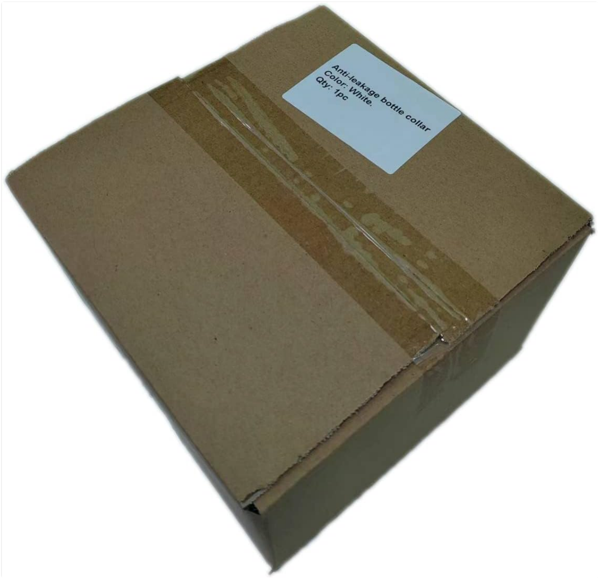
Image: The retail cardboard box for the SOOPYK Water Cooler Dispenser Bottle Base, indicating "Anti-leakage bottle collar" and "Color: White".