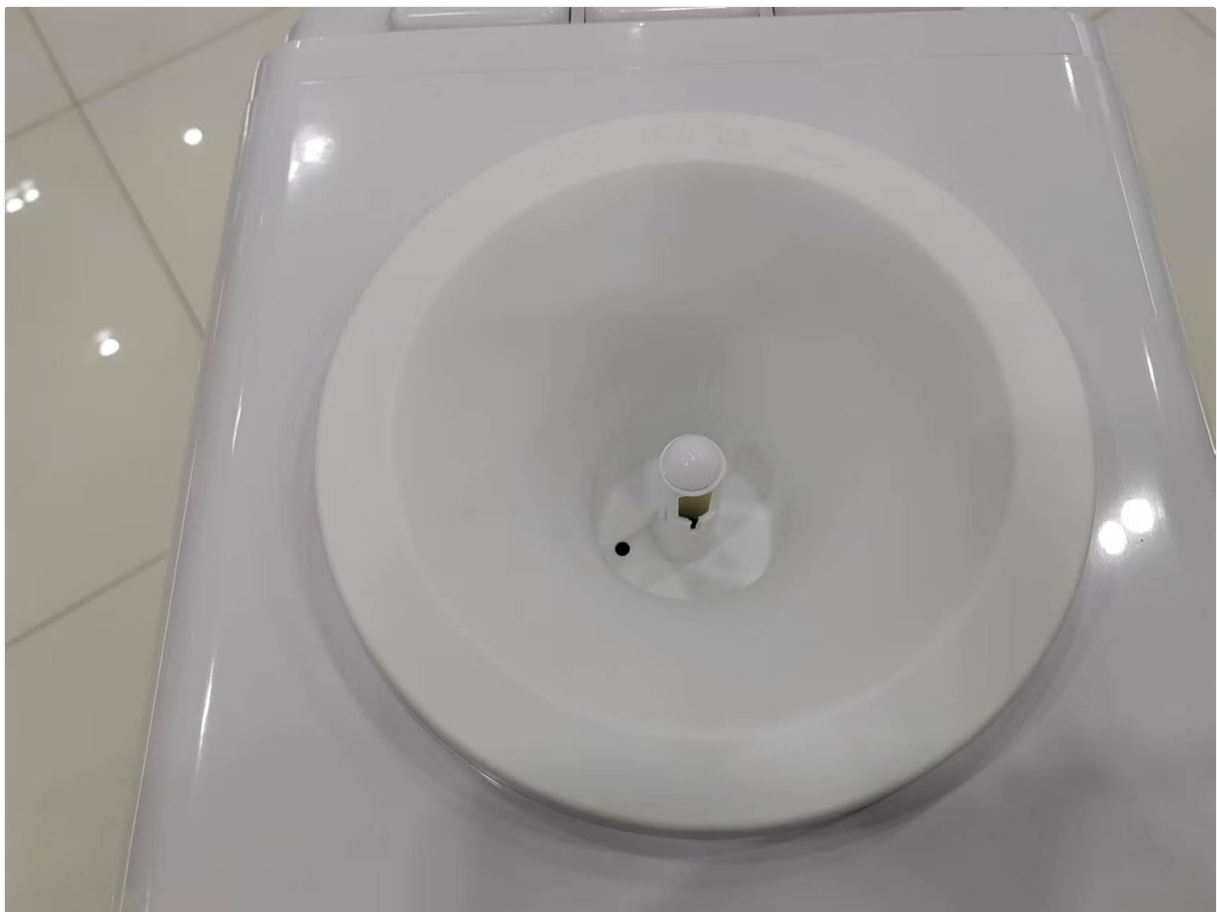
Image: The SOOPYK Water Cooler Dispenser Bottle Base correctly installed on the top of a water cooler dispenser.