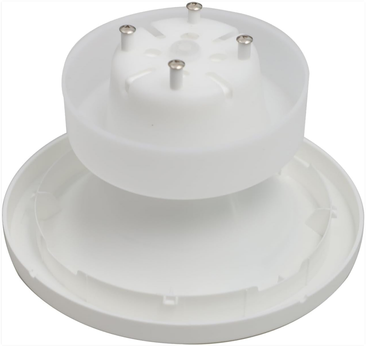
Image: Top-down view of the SOOPYK Water Cooler Dispenser Bottle Base, showing the four metal pins and central water inlet.