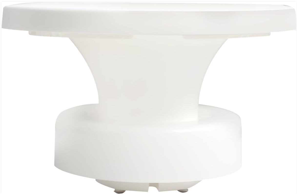
Image: Side profile of the SOOPYK Water Cooler Dispenser Bottle Base, illustrating its funnel-like shape.