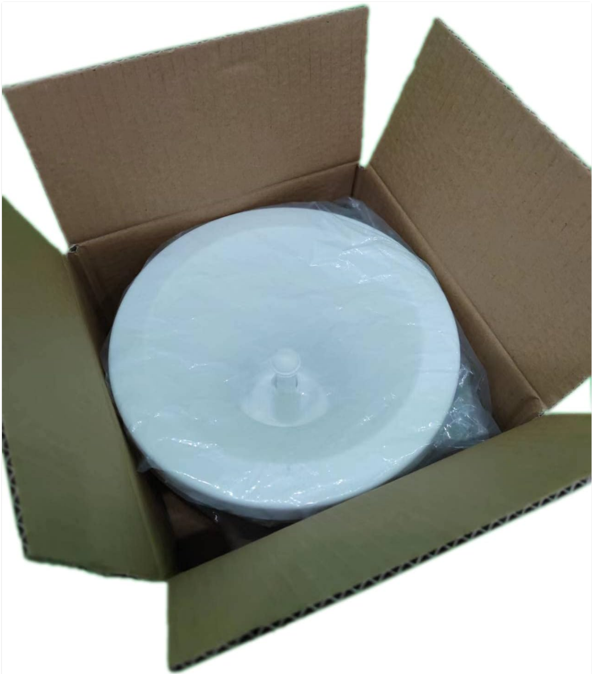
Image: The SOOPYK Water Cooler Dispenser Bottle Base, Model WB001, shown inside its cardboard packaging.