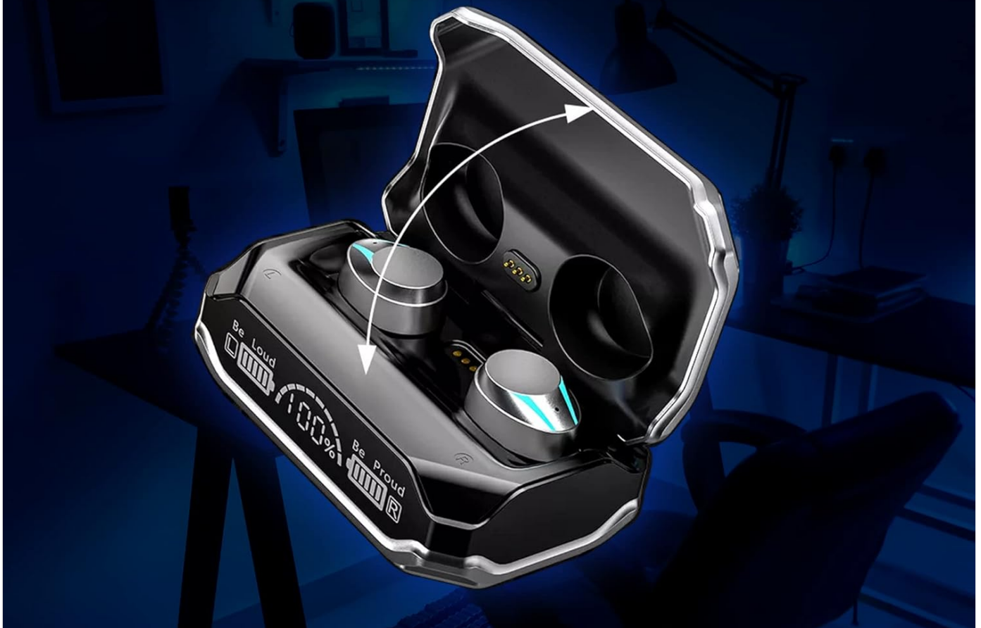
Figure 3.2: Magnetic Hatch Cover. The case opens with a slight toggle due to its built-in sensitive magnet.

The hatch cover has a built-in sensitive magnet, No need to force it open, It can be opened and closed with just a slight toggle