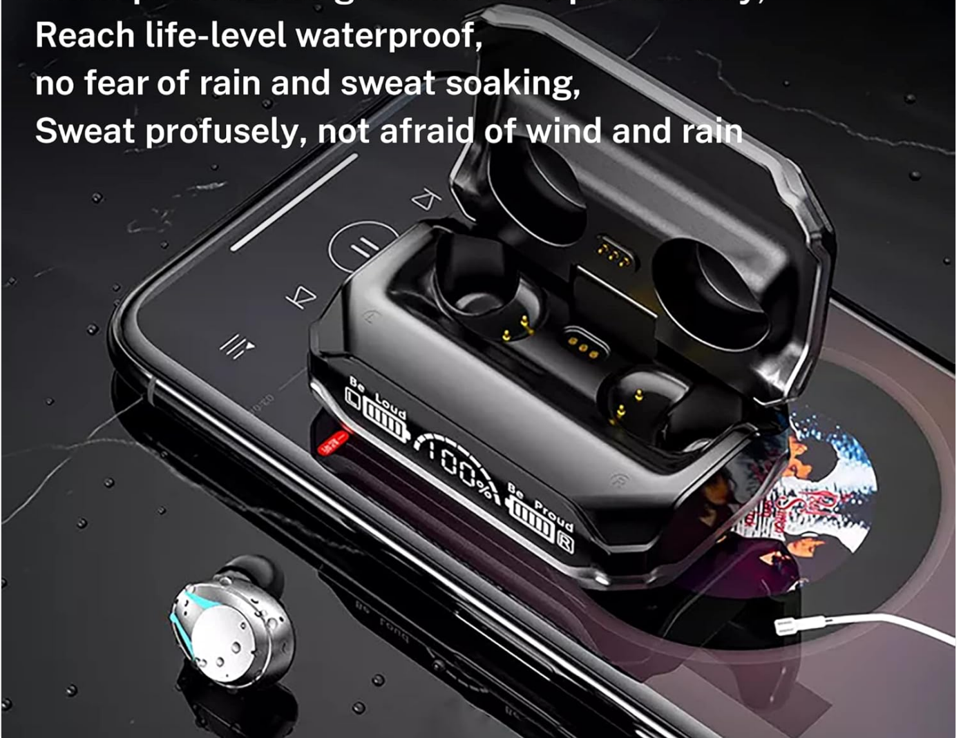
Figure 3.5: IPX7 Waterproof. The multi-process design ensures life-level waterproofing, protecting against rain and sweat.

Multi-process design of the headphone body, Reach life-level waterproof, no fear of rain and sweat soaking, Sweat profusely, not afraid of wind and rain