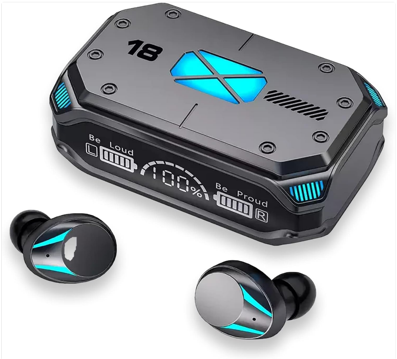
Figure 3.1: StitchGreen M41 Earbuds and Charging Case. The charging case features a digital display showing battery percentages for the case and individual earbuds, along with indicator lights.