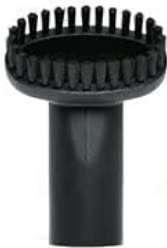
Brush suction nozzle