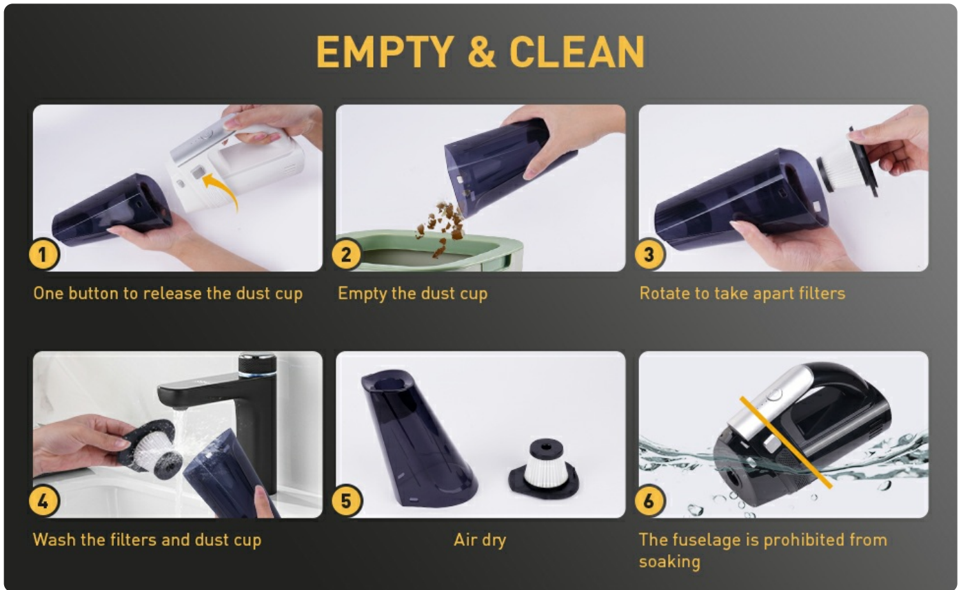
Image: A six-step visual guide demonstrating how to release, empty, disassemble, wash, air dry, and reassemble the dust cup and HEPA filter of the vacuum cleaner.

Important: Do not immerse the main body of the vacuum cleaner in water. Only the dust cup and filter are washable.