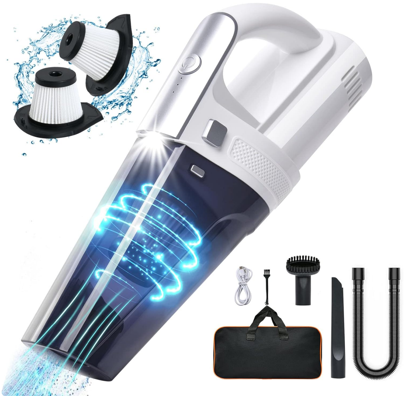
Image: The URAQT Handheld Cordless Vacuum Cleaner in white, shown with its various attachments and two HEPA filters, demonstrating its compact design and included accessories.