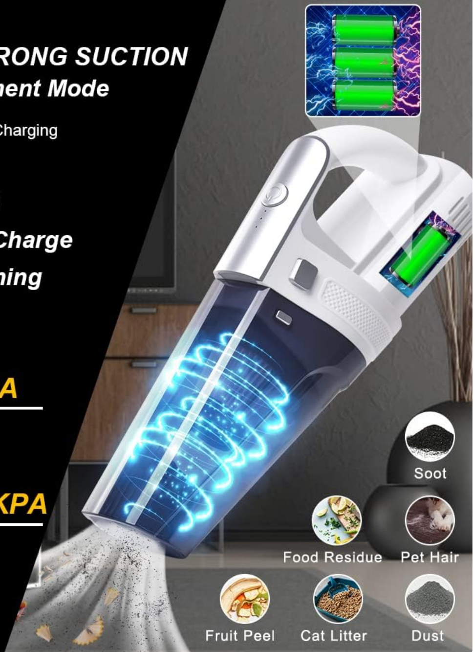
Image: The vacuum cleaner in action, illustrating its two suction levels: Level 1 (Standard 7kPa) and Level 2 (Max 10kPa), suitable for various debris like soot, food residue, pet hair, and dust.