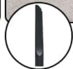
Crevice Nozzle for crevices and corners