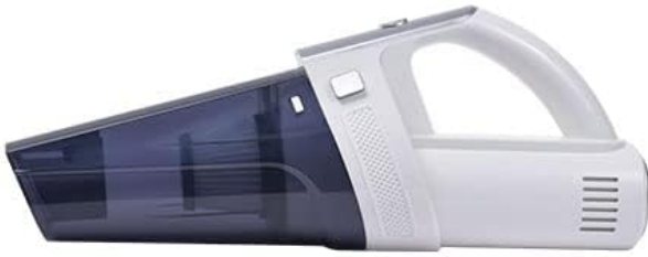
Vacuum cleaner host