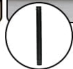
Long Hose Nozzle for the places that hard to reach

Image: The vacuum cleaner in various cleaning scenarios, highlighting the use of the brush nozzle for pet food, the crevice nozzle for sofa gaps, and the long hose nozzle for reaching under furniture.