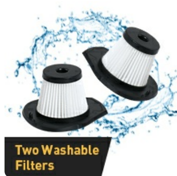
Image: A close-up of two washable HEPA filters, emphasizing their reusability and the importance of cleaning them.