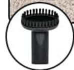
Brush Nozzle for carpet, sofa, hair, keyboard