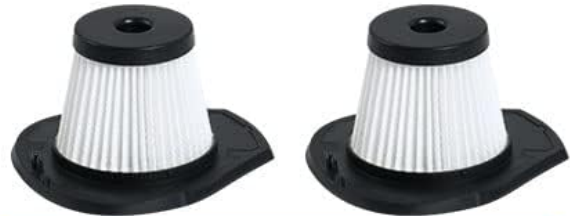
HEPA filter element X 2 (The product contains 1pc, and the package gives 1 pcs)

Image: A collage showing the vacuum cleaner being used for multipurpose cleaning, including dusting bookshelves, cleaning car seats, vacuuming a laptop keyboard, and picking up crumbs from a kitchen counter.