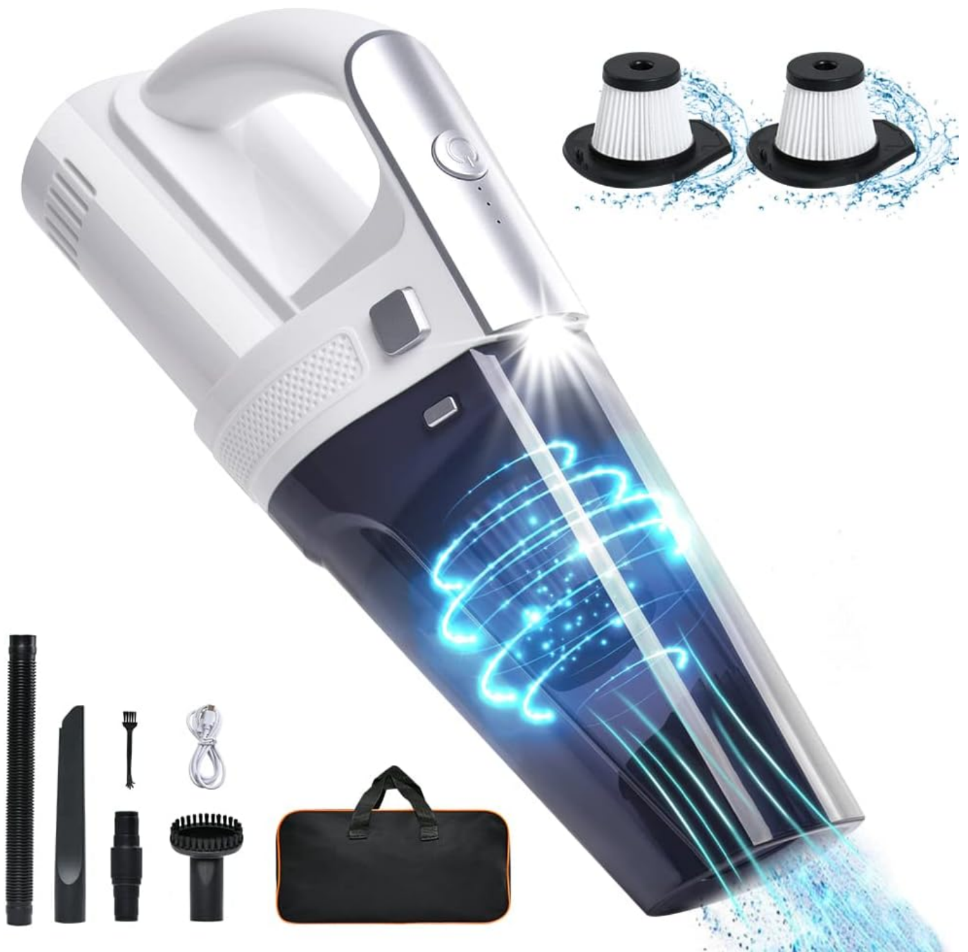
Image: A visual representation of all items included in the package, such as the vacuum unit, various nozzles, charging cable, and carrying bag.