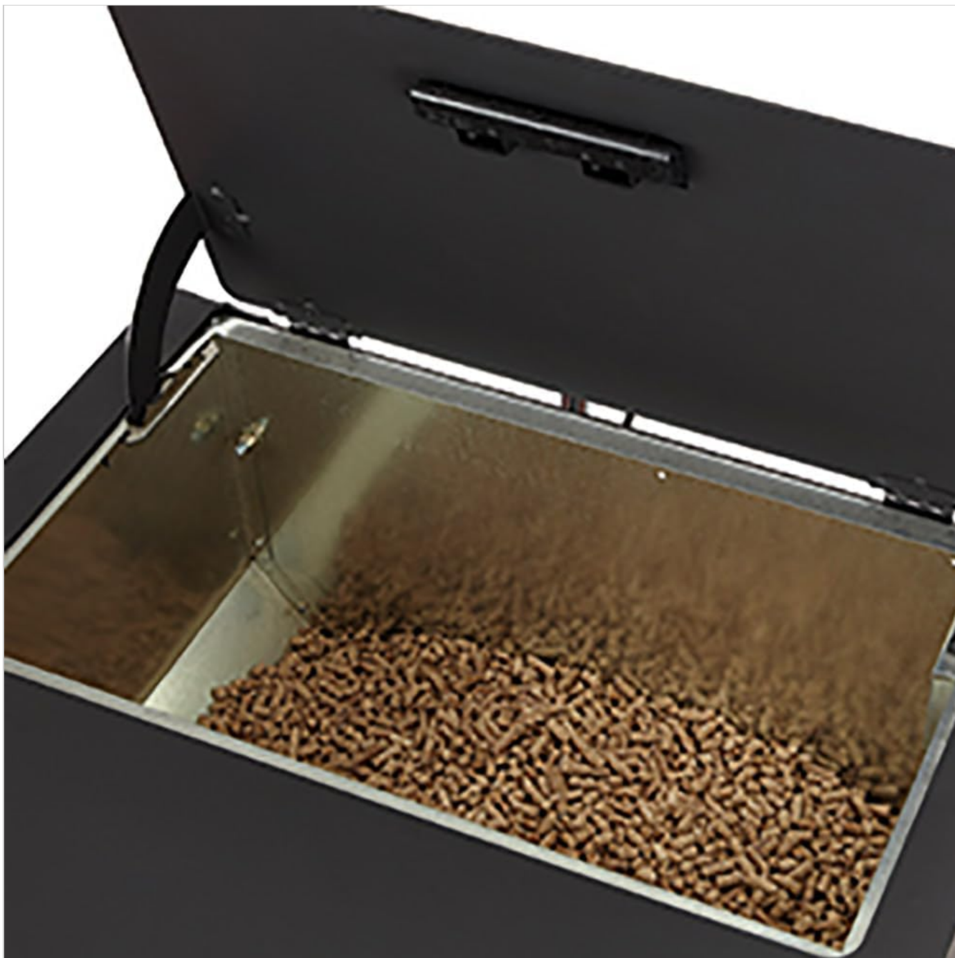
Image 2.1: The 60-lb capacity hopper, designed for easy filling with wood pellets.