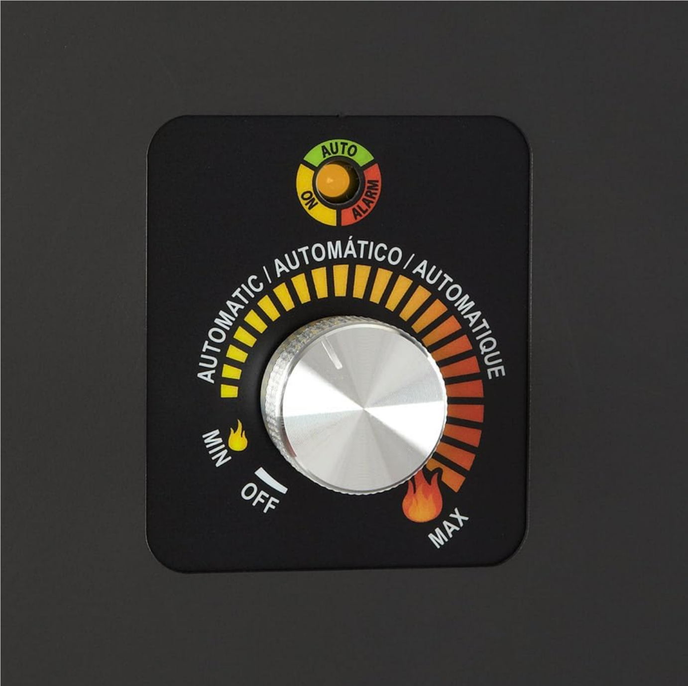
Image 2.3: The intuitive dial control for setting desired heat levels and managing stove operation.