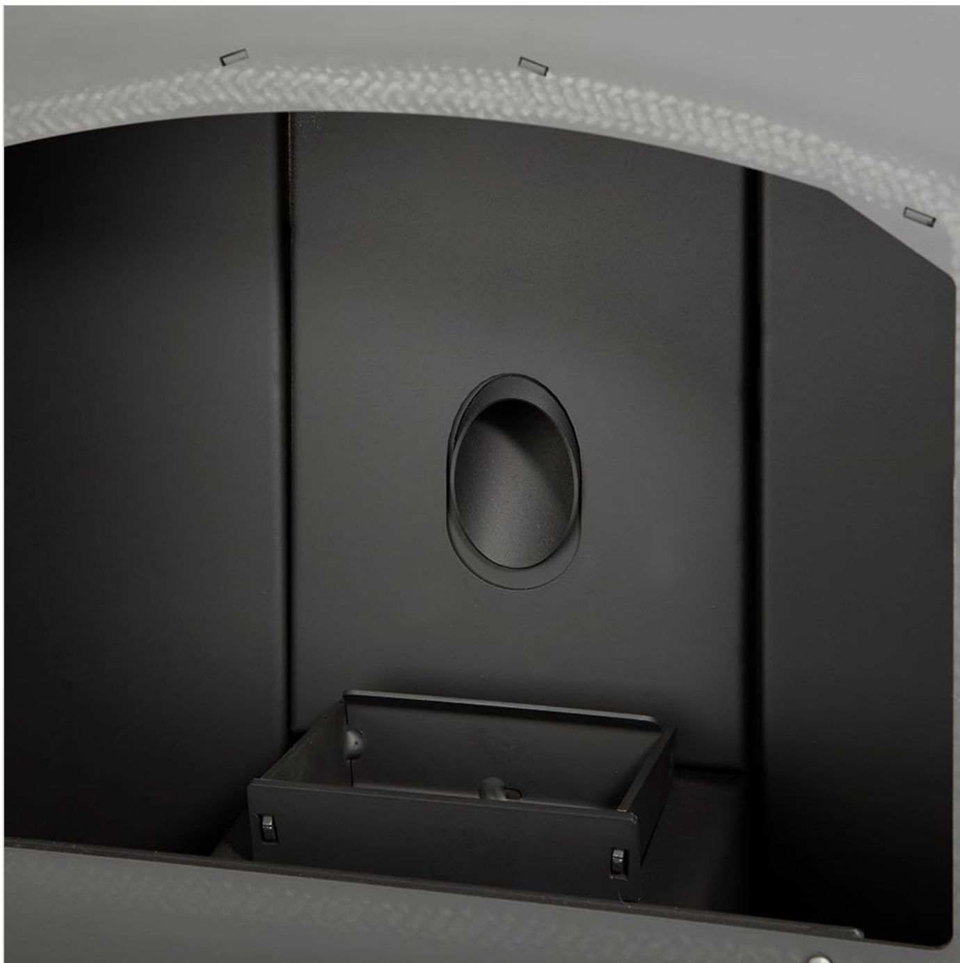
Image 3.1: Interior of the firebox, highlighting the burn pot which requires regular cleaning.