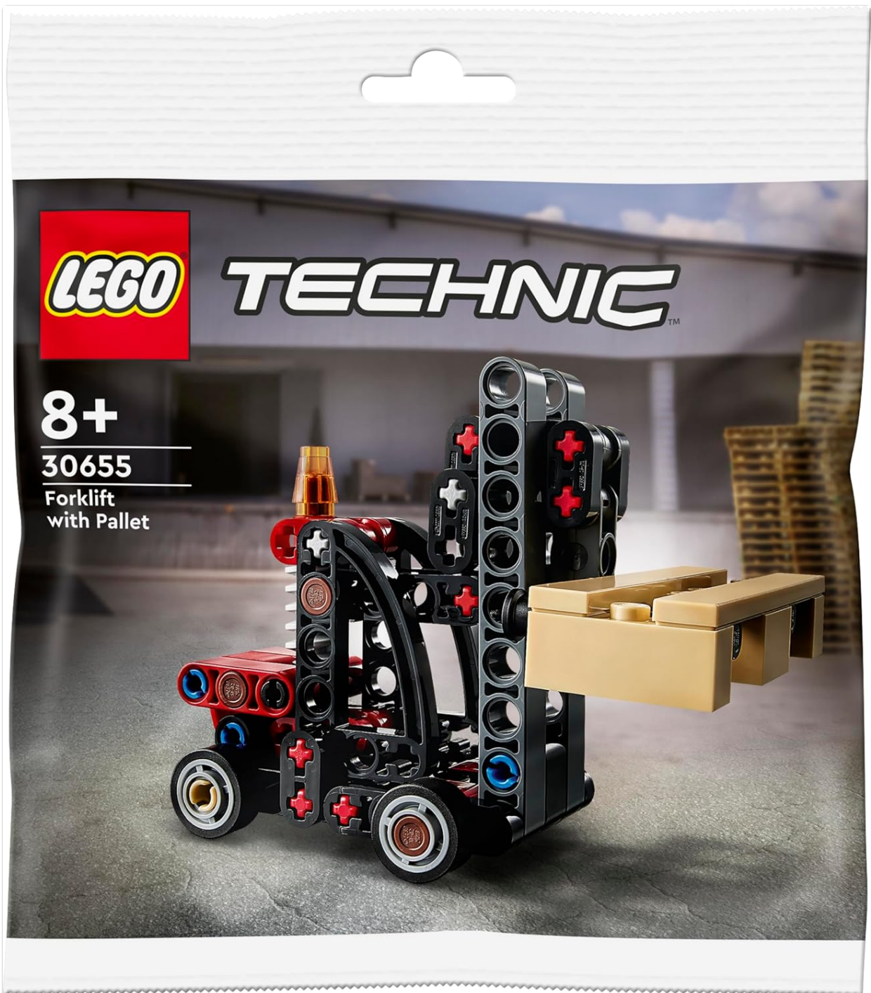
Figure 2: Packaging for the LEGO Technic Forklift with Pallet set.