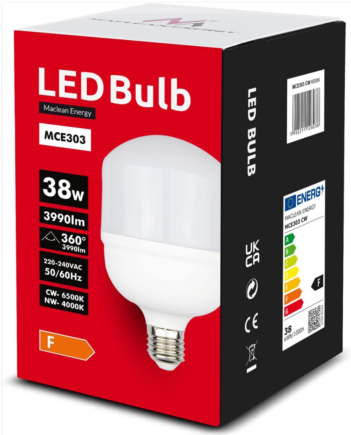
Image: Packaging of the Maclean MCE303 NW LED E27 Bulb, showing product details and energy efficiency class.