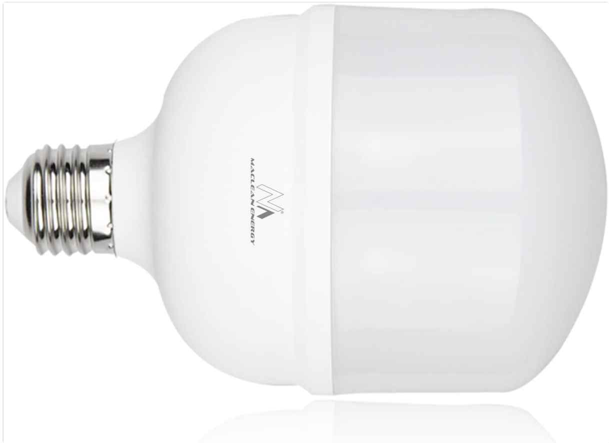
Image: Close-up view of the Maclean MCE303 NW LED E27 Bulb, highlighting its E27 screw base.

For optimal performance, ensure the fixture provides adequate ventilation around the bulb.