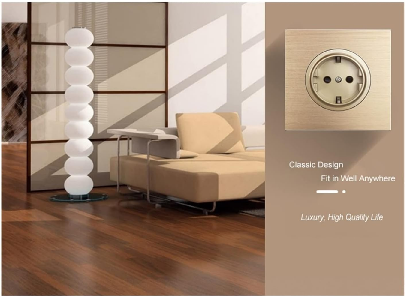
Figure 5.2: An example of a Wallpad L6 EU French Socket module, showcasing its design within a living space.