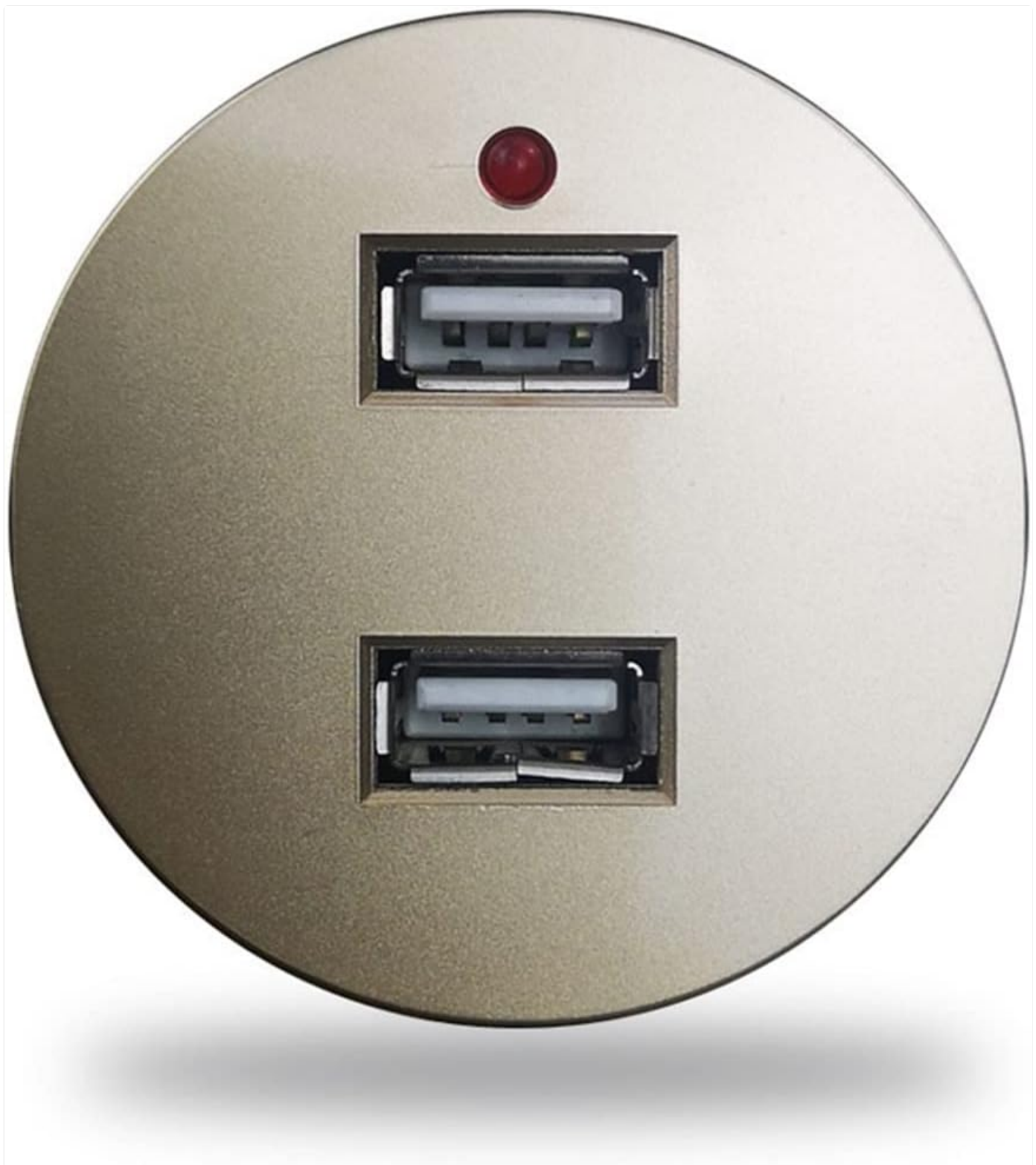
Figure 5.1: Front view of the Wallpad L6 dual USB charging module. It features two USB-A ports and a red LED indicator light at the top.