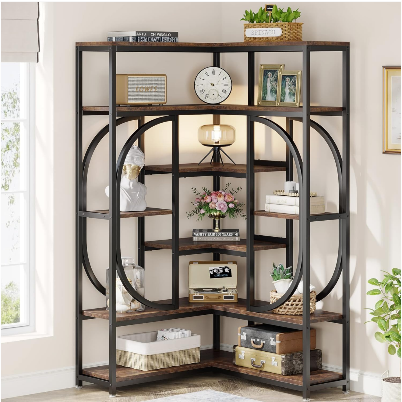
Figure 1.1: Tribesigns 7-Shelf Corner Bookshelf in a typical home environment.