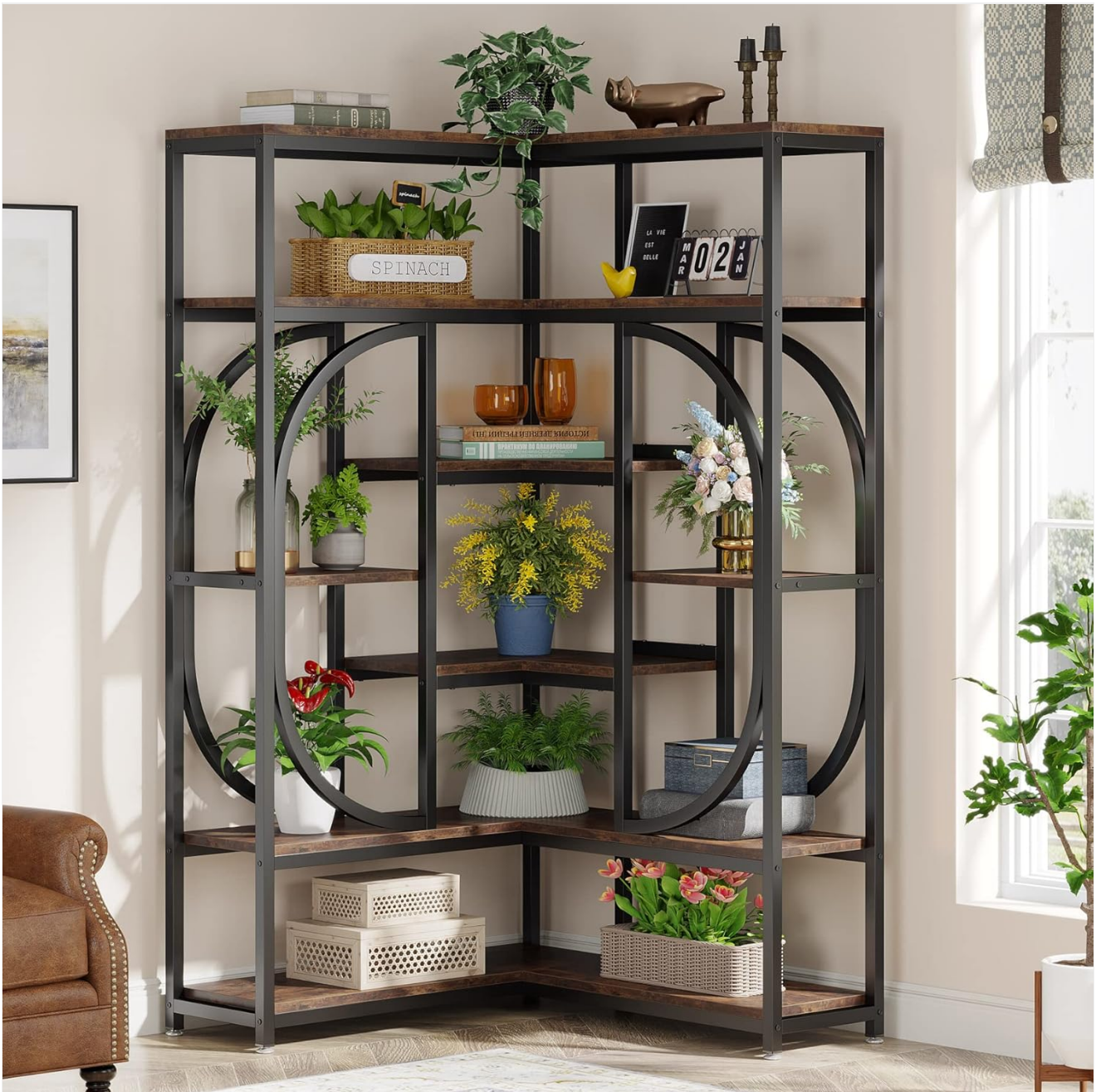
Figure 5.1: Example of items displayed on the bookshelf.