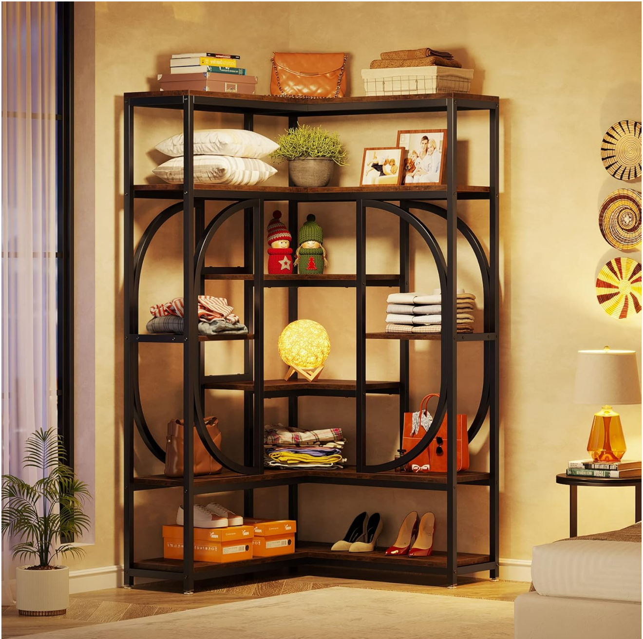
Figure 4.1: The assembled bookshelf ready for use in a home office.