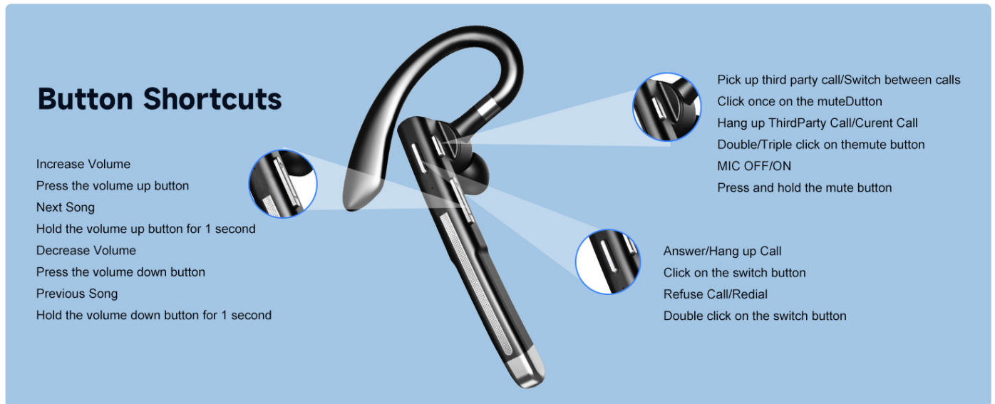
Image: A diagram illustrating the various button functions and their corresponding actions on the headset.