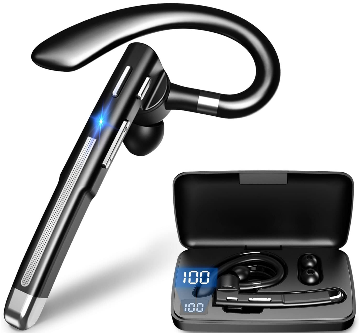
Image: The Boytond Bluetooth Headset YYK-520, its charging case, and included accessories.