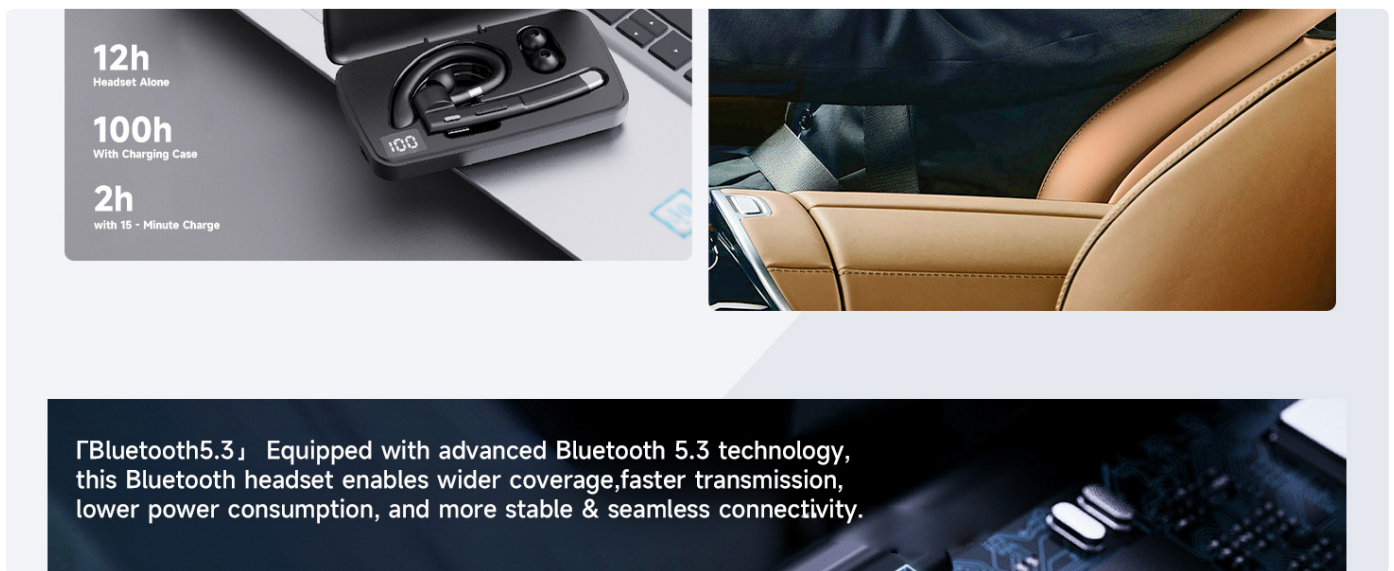
Image: A visual of the Bluetooth 5.3 technology chip, highlighting stable and fast connectivity.