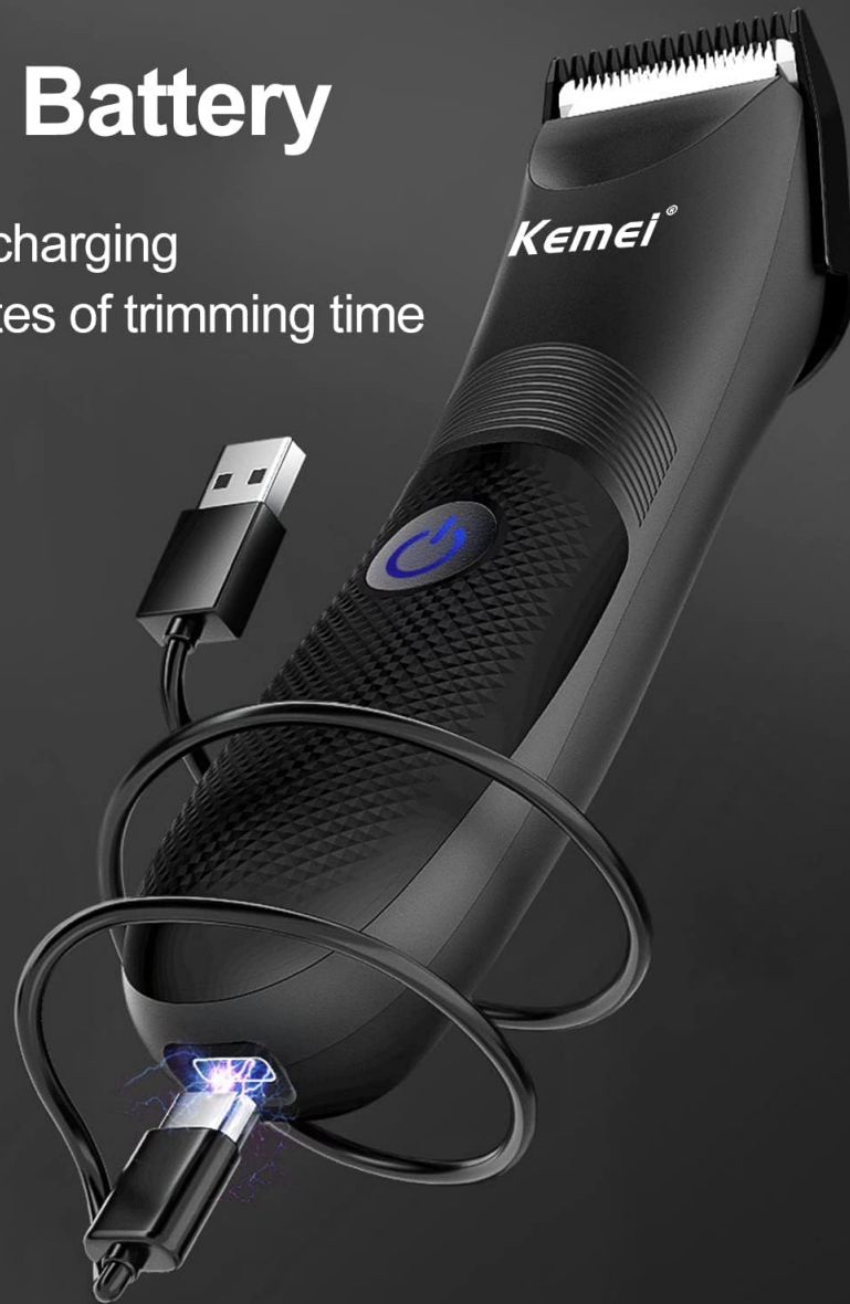
Image: The KEMEI Body Trimmer connected via USB for charging, illustrating various compatible power sources like computers, car chargers, USB adapters, and power banks.