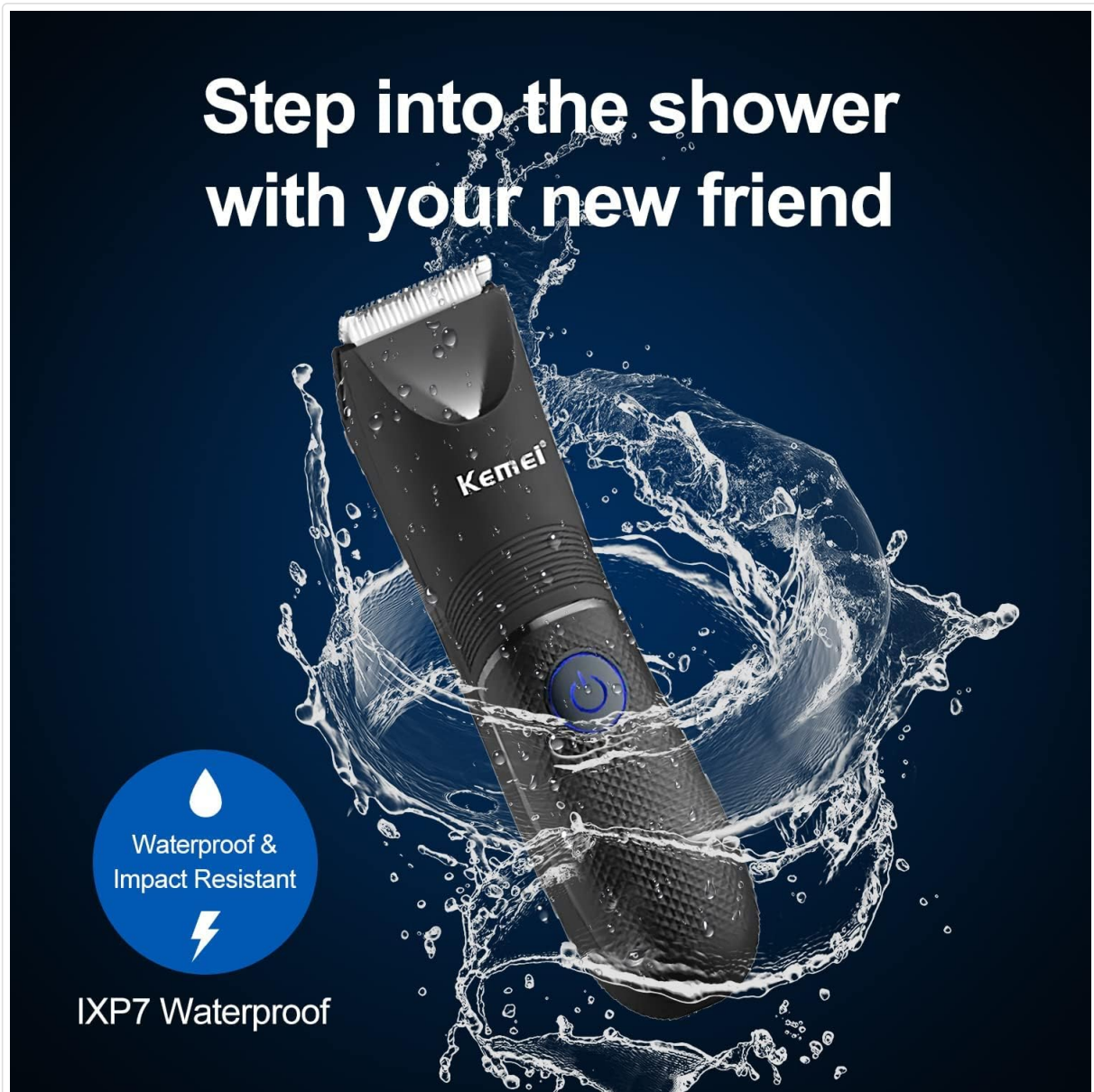
Image: The KEMEI Body Trimmer being used in a wet environment, demonstrating its IPX7 waterproof and impact-resistant capabilities.