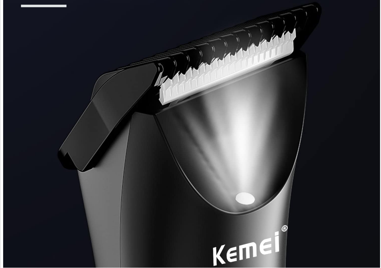
Image: Close-up view of the KEMEI Body Trimmer highlighting the integrated LED light for enhanced visibility during use.

Better view and trim cleaner with illumination