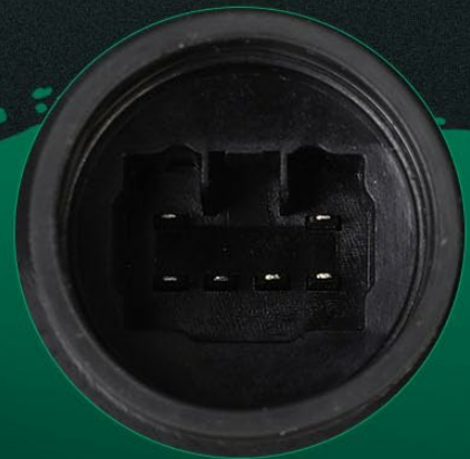
Image: Shows the powerful lift motor with fine copper and craft, and the 6-pin plug & play connector.