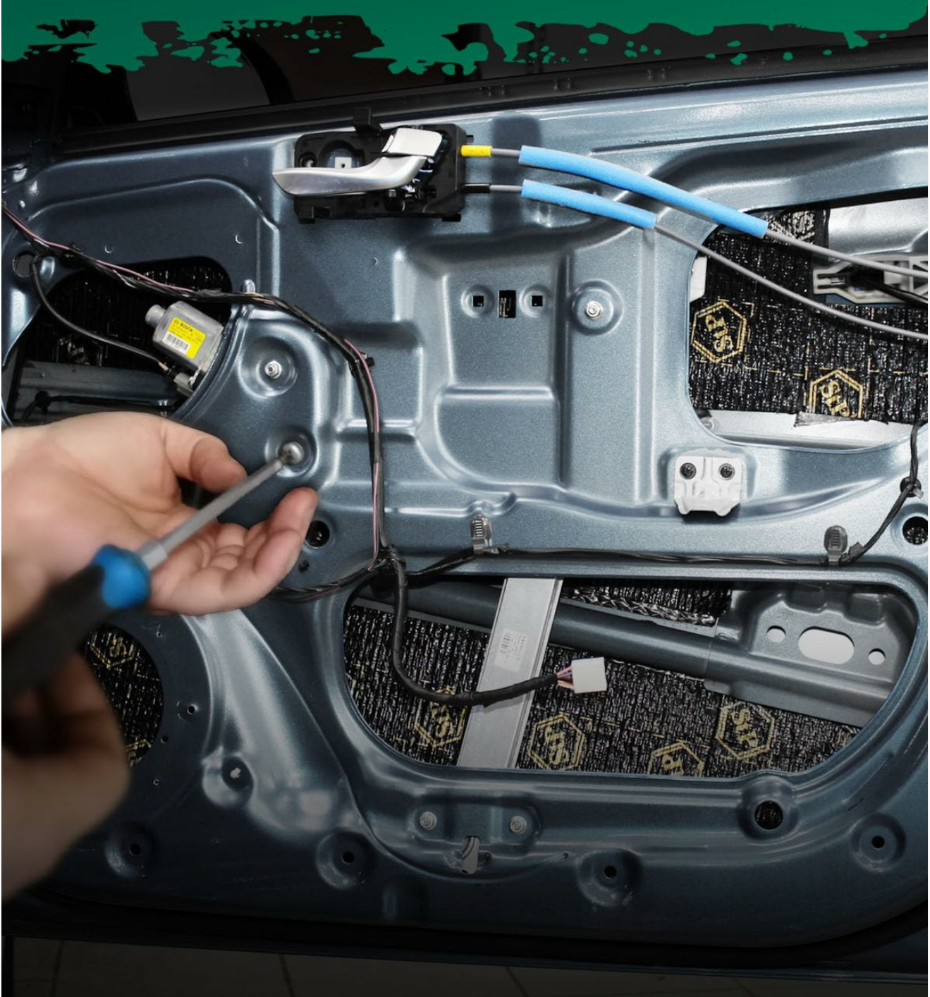
Image: A close-up of a hand using a screwdriver to install a component into a car door, illustrating the "Easy Installation" process.