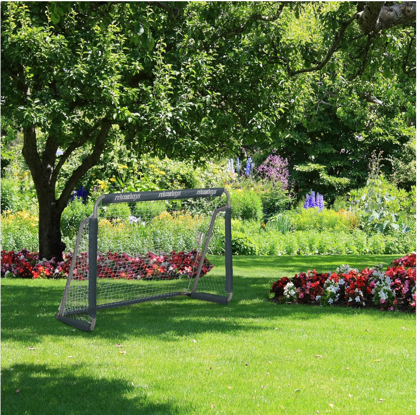
Figure 4.1: The football goal ready for use in a garden setting.