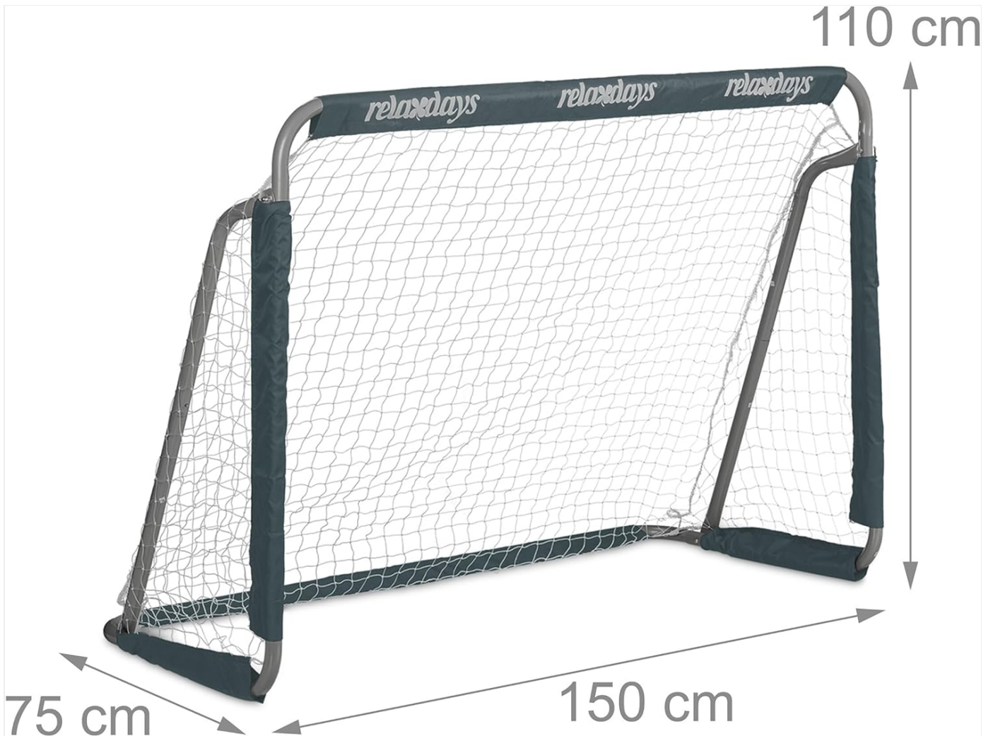
Figure 3.1: Goal dimensions for planning placement.