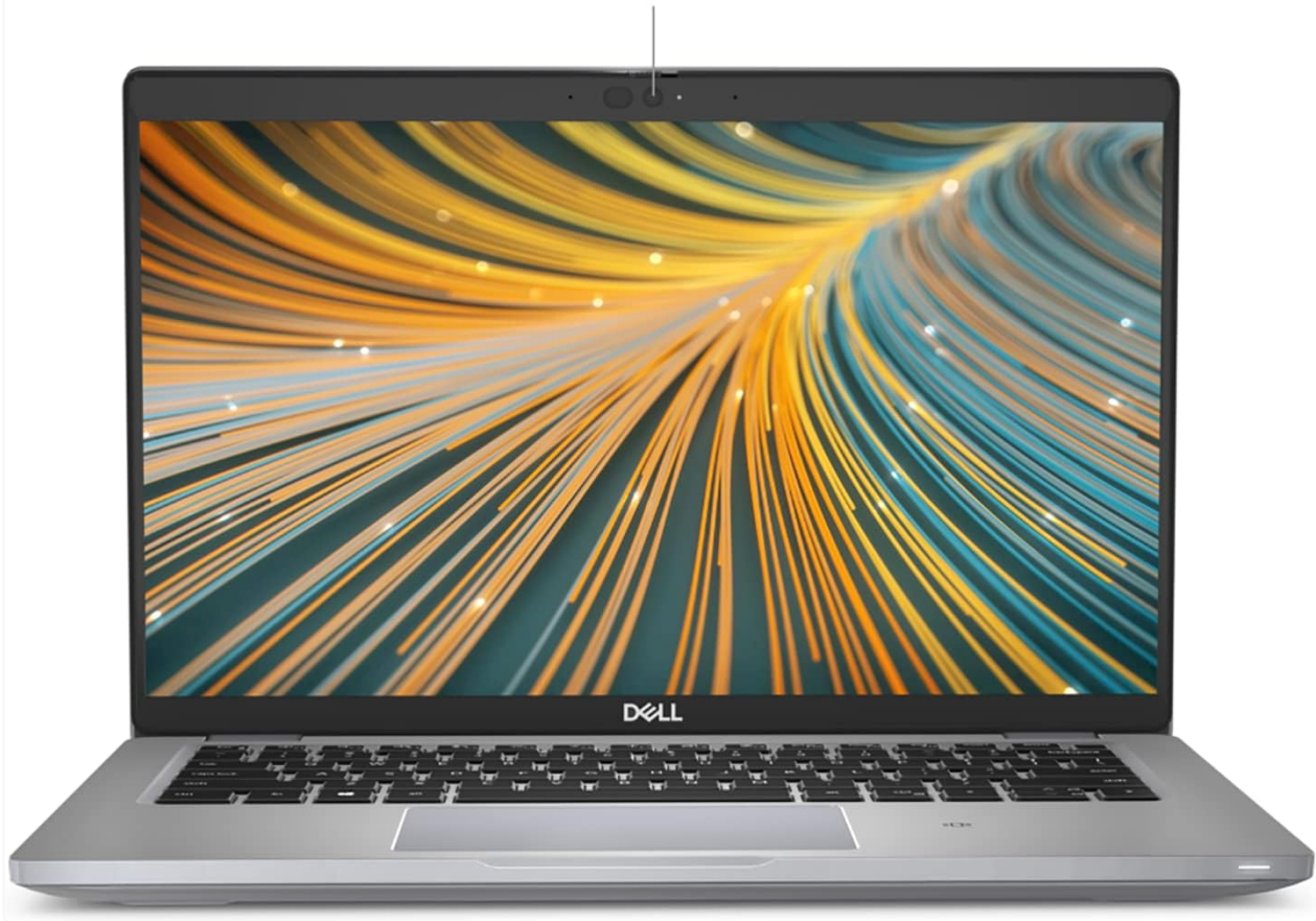
Figure 5: Front view of the Dell Latitude 5510, showing the display and the integrated webcam with its privacy shutter.