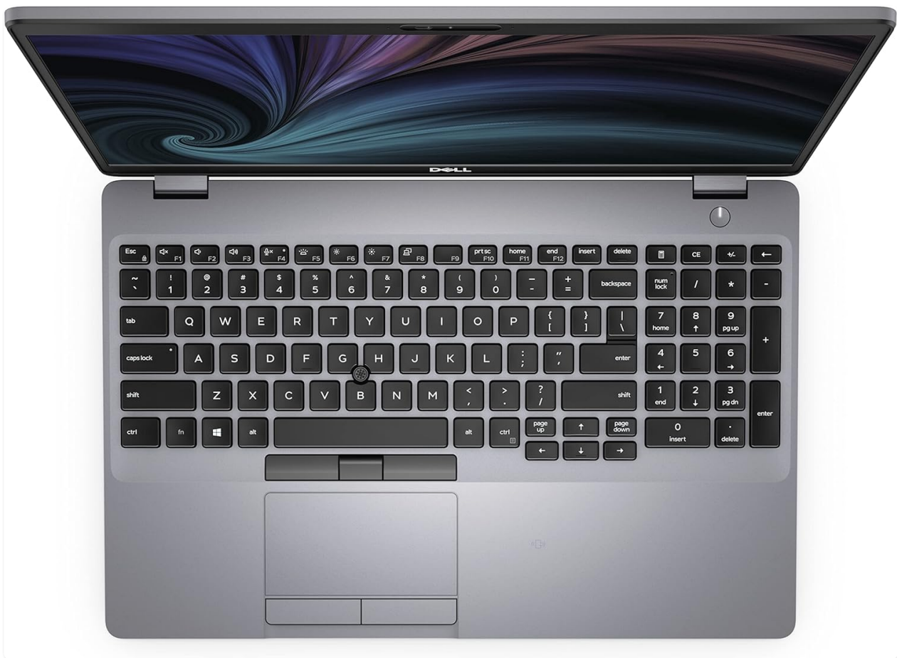
Figure 4: Top-down view of the Dell Latitude 5510 keyboard and trackpad, highlighting the layout and design.