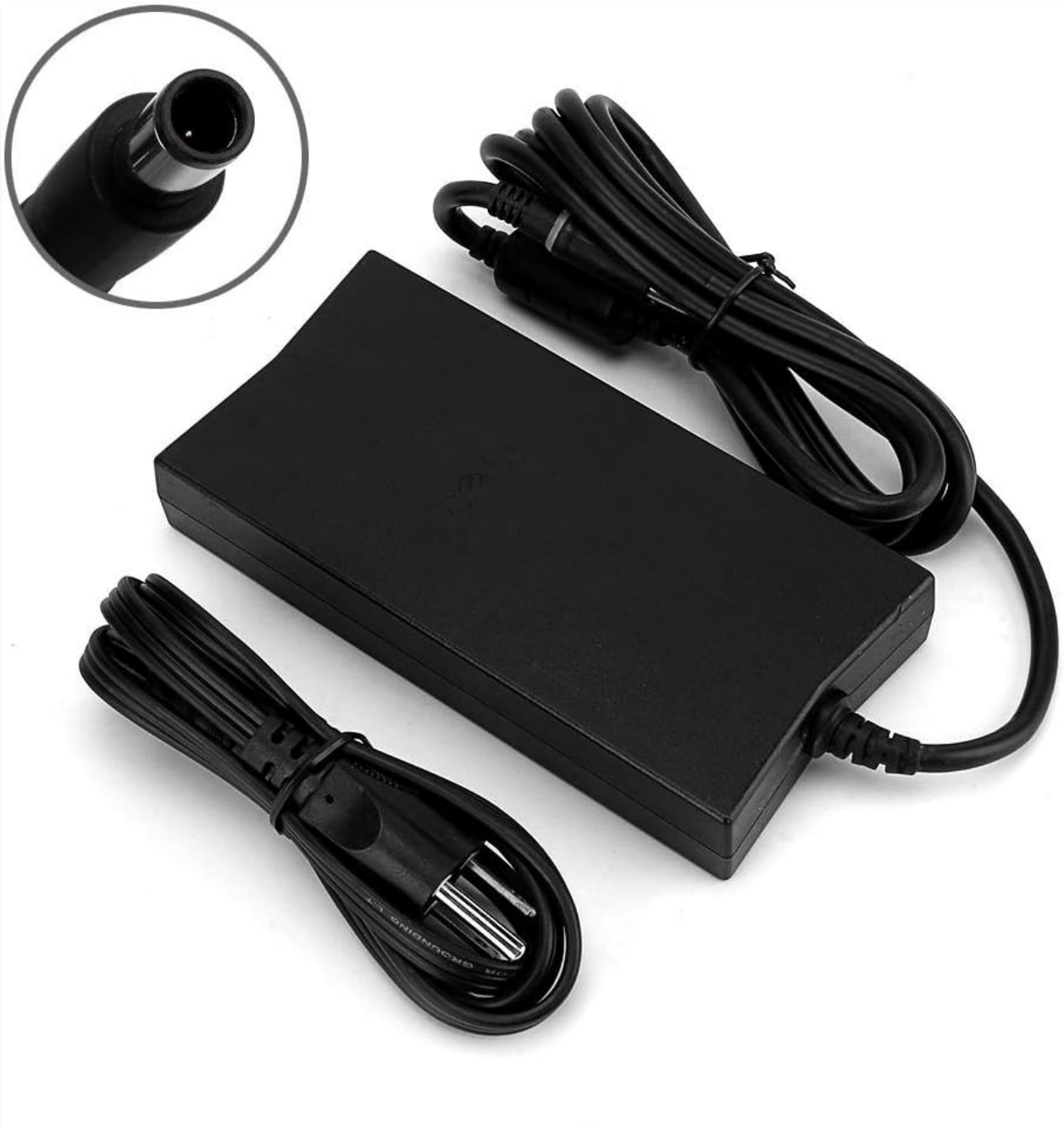
Figure 1: Dell Latitude 5510 AC Adapter. This image shows the AC adapter and its connector, essential for powering and charging the laptop.