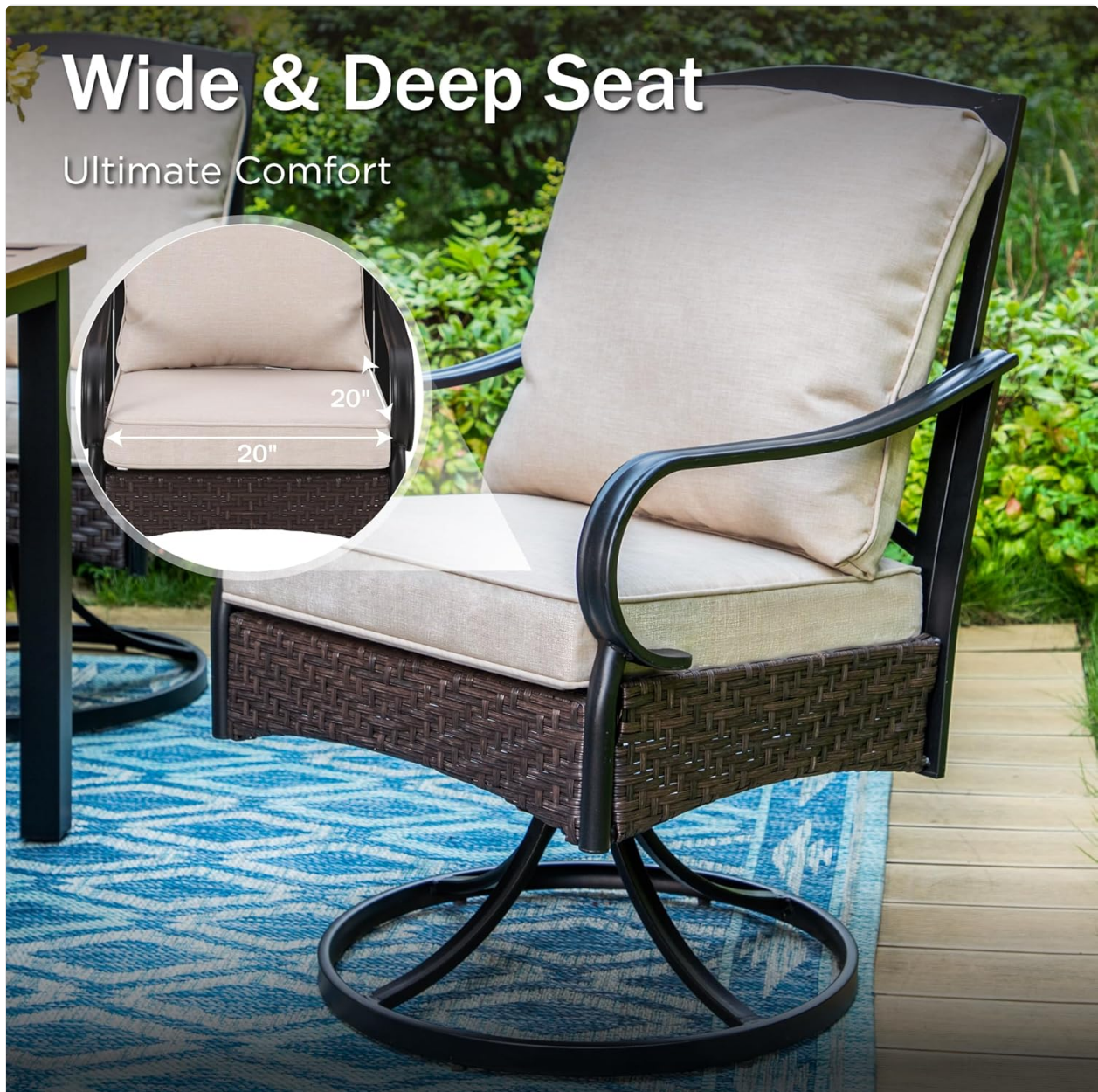
Figure 4.1: Cushion features for easy maintenance.

Cushion covers can be removed via zippers for more thorough cleaning.