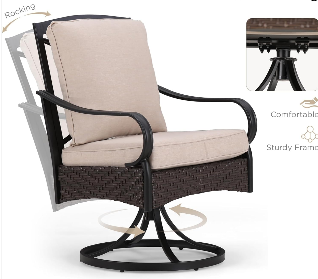
Figure 3.1: Swivel and rocking features of the patio chair.

Video 3.1: Demonstration of the PHI VILLA Swivel Patio Dining Chairs with Cushions.