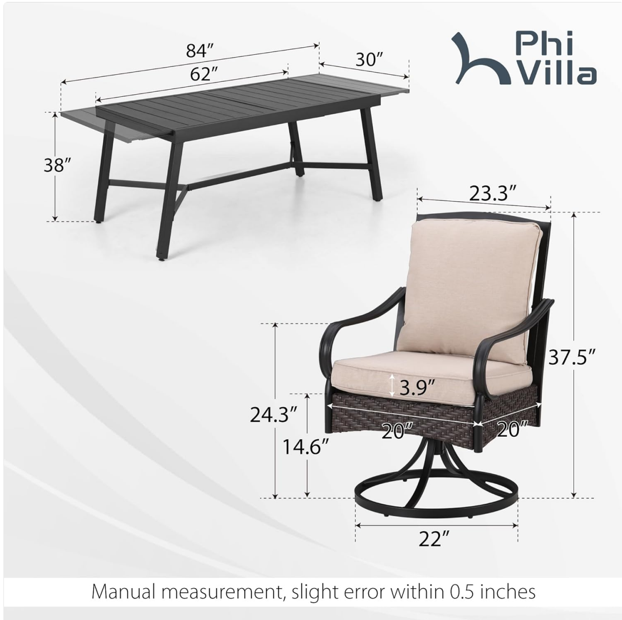
Figure 2.1: Dimensions of the dining table and swivel chair.