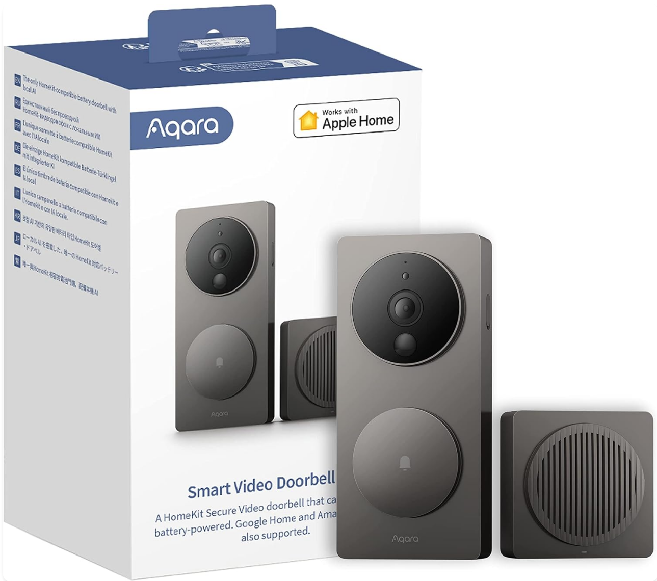
Figure 1: Aqara Video Doorbell G4 product packaging and included components.